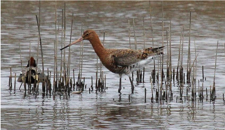
Black Tailed Godwit

There are good numbers of Black Tailed Godwits and depending on the tide they alternate between the Pans and Avon water.