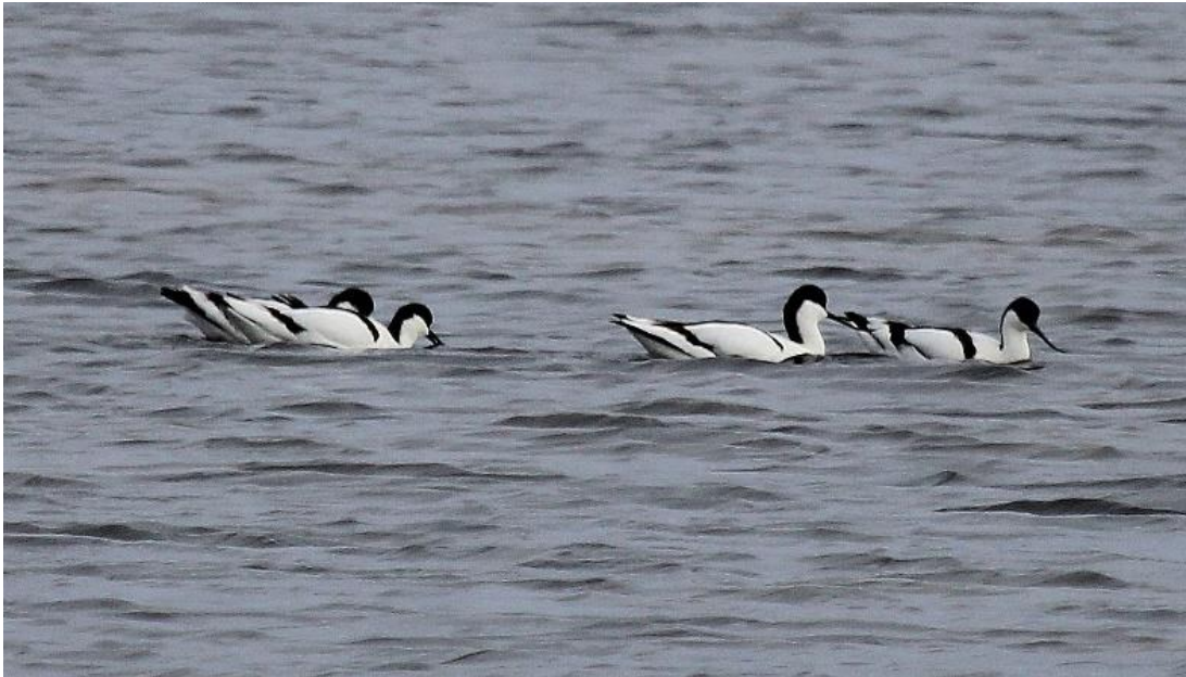
4 Avocet (none of them ringed).