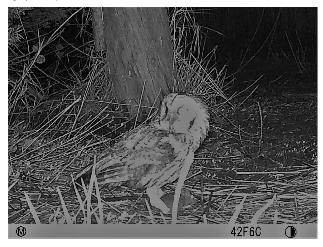
Tawny Owl (thanks Keith).

When I checked the trail cams photos/videos I discovered that a Grey Heron had been dispatching and eating the rats, there was also three photos that showed that a Tawny Owl had joined in. This was the first time an Owl had been photographed by the trail cameras.