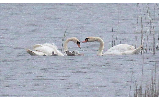
Avon Water Cygnets. (06.12 16/5/2021) The Pans Cygnets. (06.27 16/5/2021)

Oystercatcher: Two were present on 13 occasions.