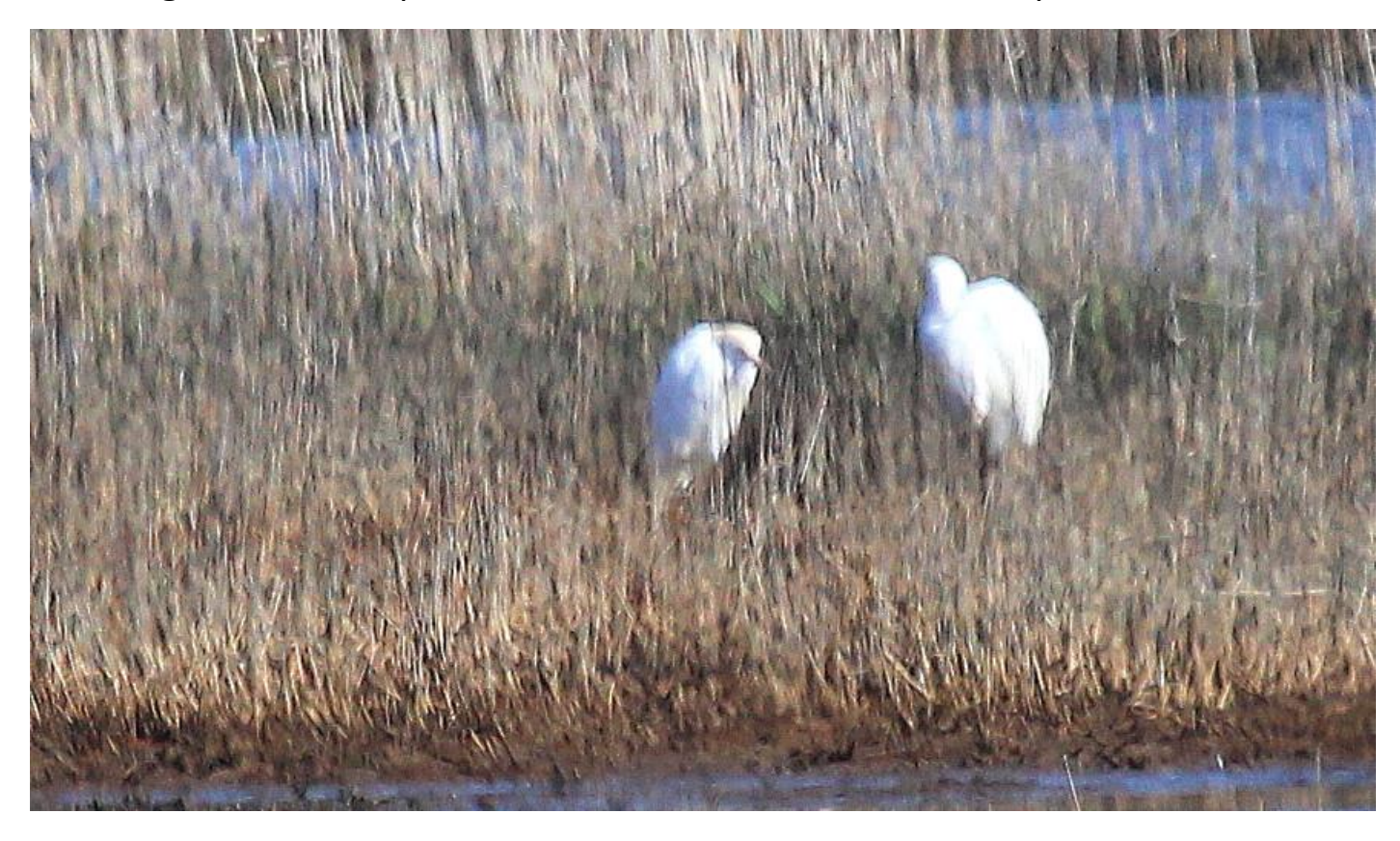
The Cattle Egret is the bird on the left.

Cattle Egret: A new species for the site. One seen on 23rd April.