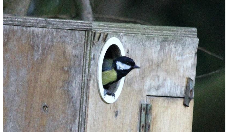
Blue Tit Great Tit

A Female Mallard with 11 ducklings on the Pans. (9th May)