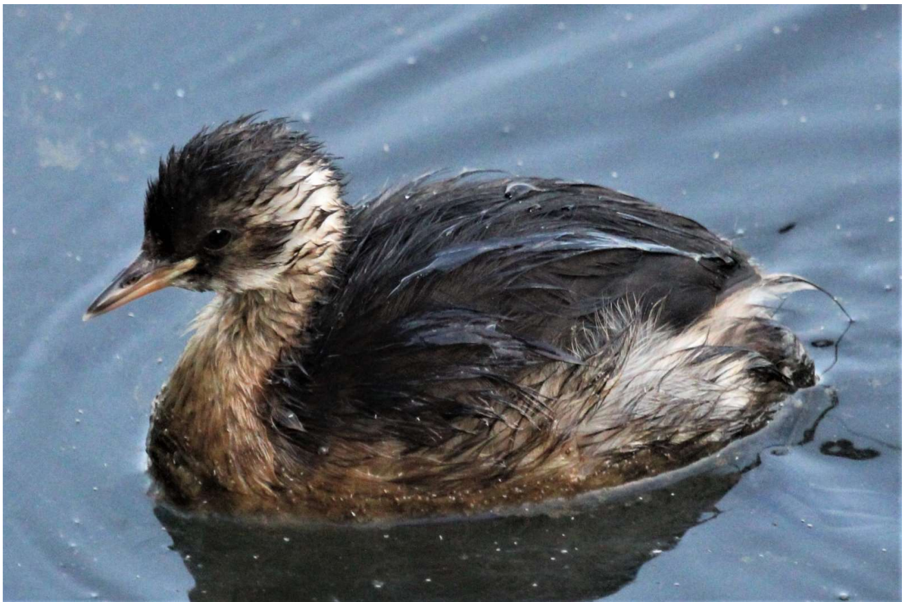
Little Grebe in the Kingfisher Pool.

Little Grebe: Present in high numbers. 34 birds recorded on 5 th September