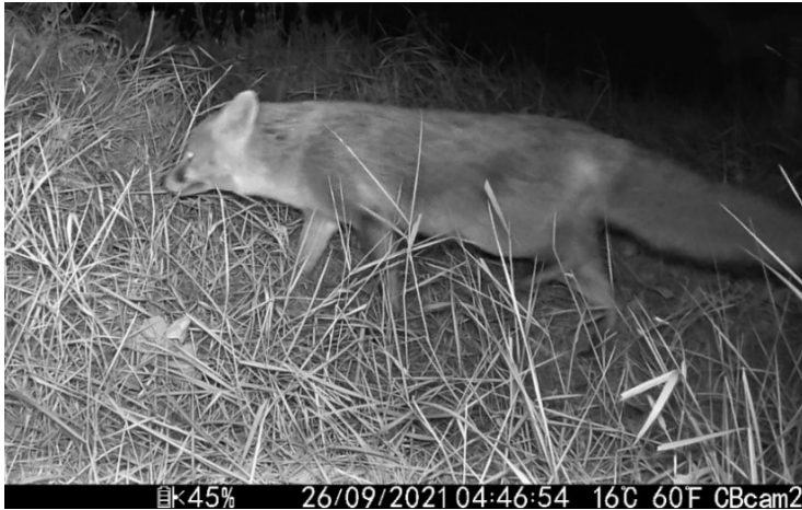
Fox on the prowl