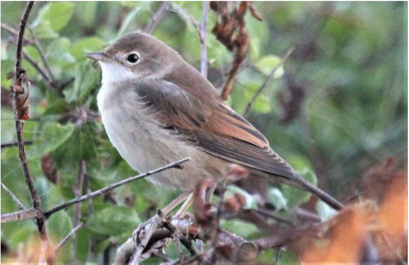
Whitethroat 24 th September

Other birds recorded but not mentioned in this report.