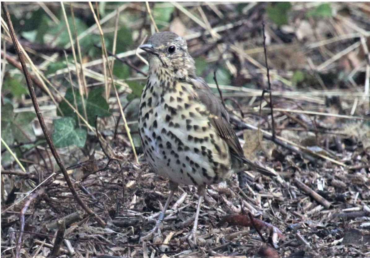
Song Thrush (with ring on its right leg).

Song Thrush: A ringed bird has been seen near the Observatory on three occasions.