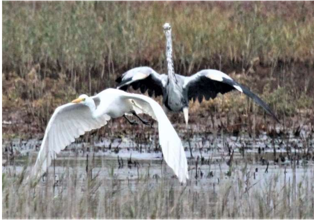
Grey Heron harassing the GWE.

Great White Egret: Present on 8 occasions. Usually, a Grey Heron will harass this bird causing it to fly off. It has been seen perched on the Pine tree behind the Observatory on two occasions.