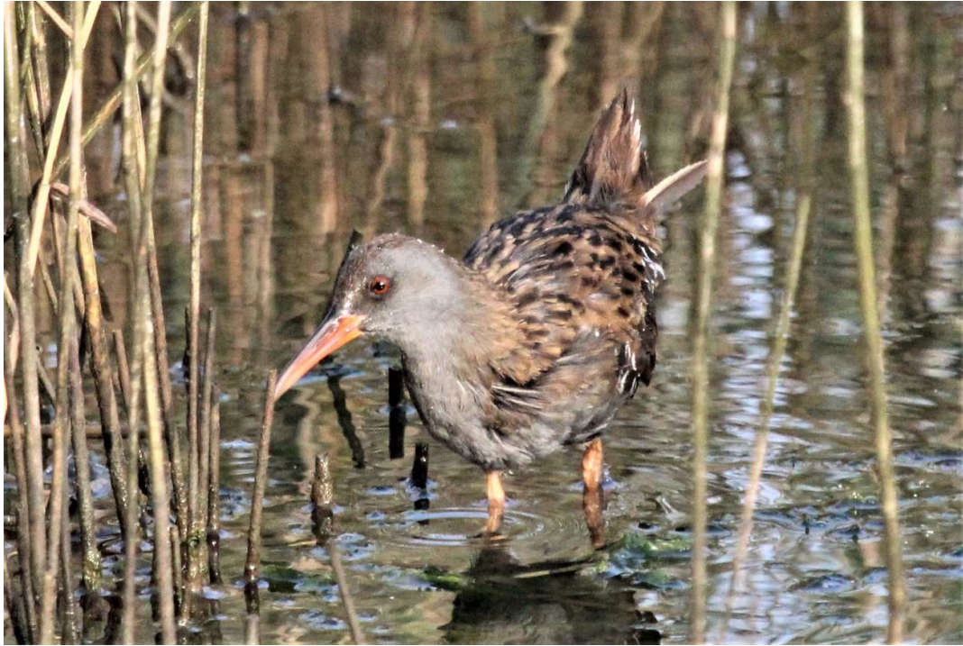
First brood Water Rail. (above).

Water Rail: Regularly seen. Three on the 5 th September. All three were photographed. Photos below.