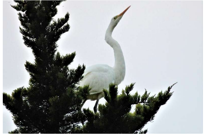
GWE in the Pine tree

While trying to photograph the Egret in the tree on 11 th September, two Spoonbills flew over. (Photo below).