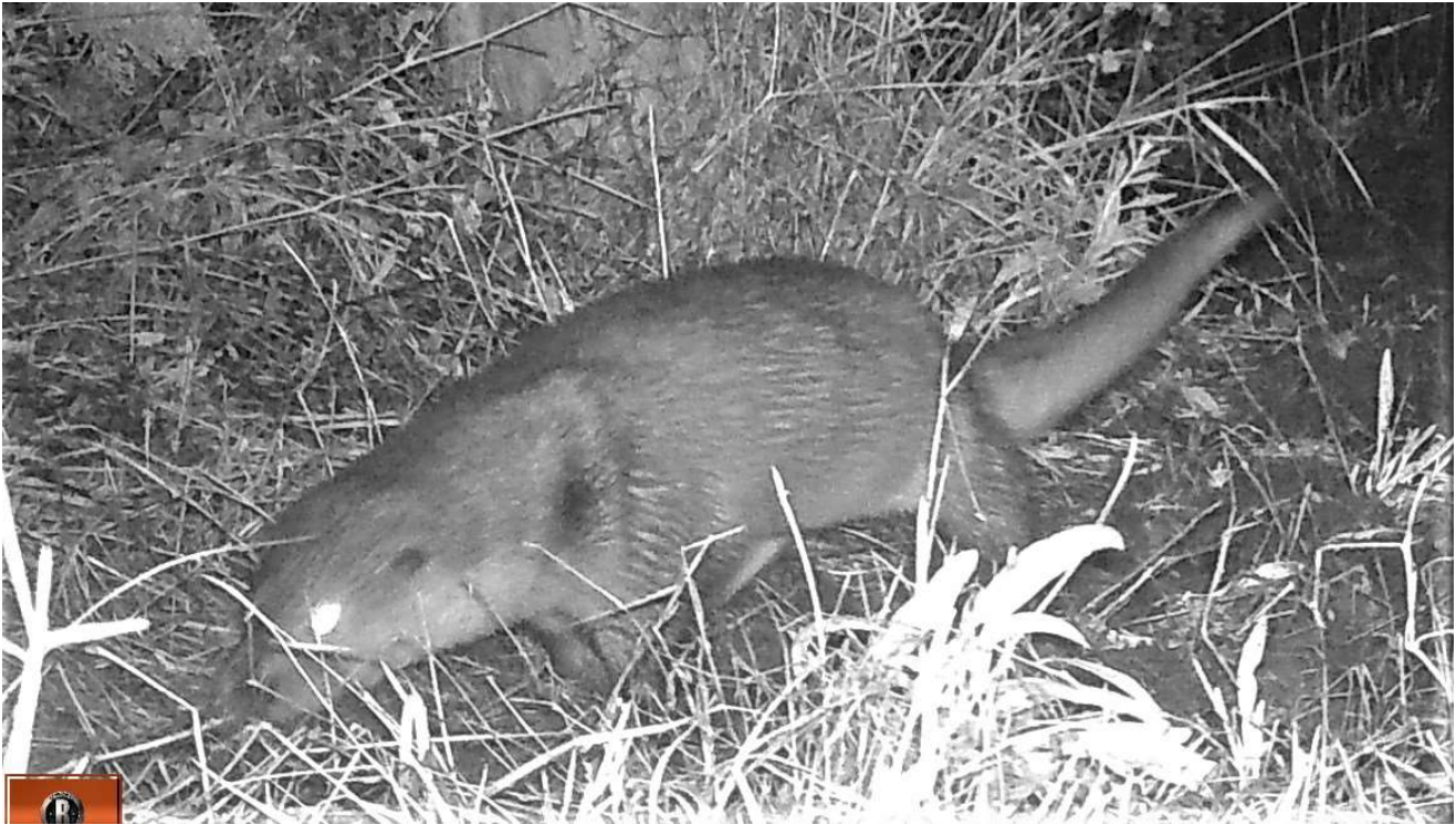
One of the two Otters photographed on 3 rd and 26 th November.