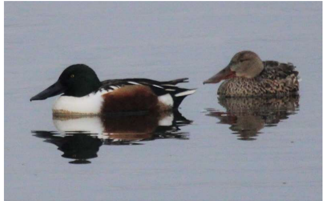
male and female Shoveler

Shoveler: 16 present on the 25 th November. They have been seen near the Kingfisher Pool on several occasions.