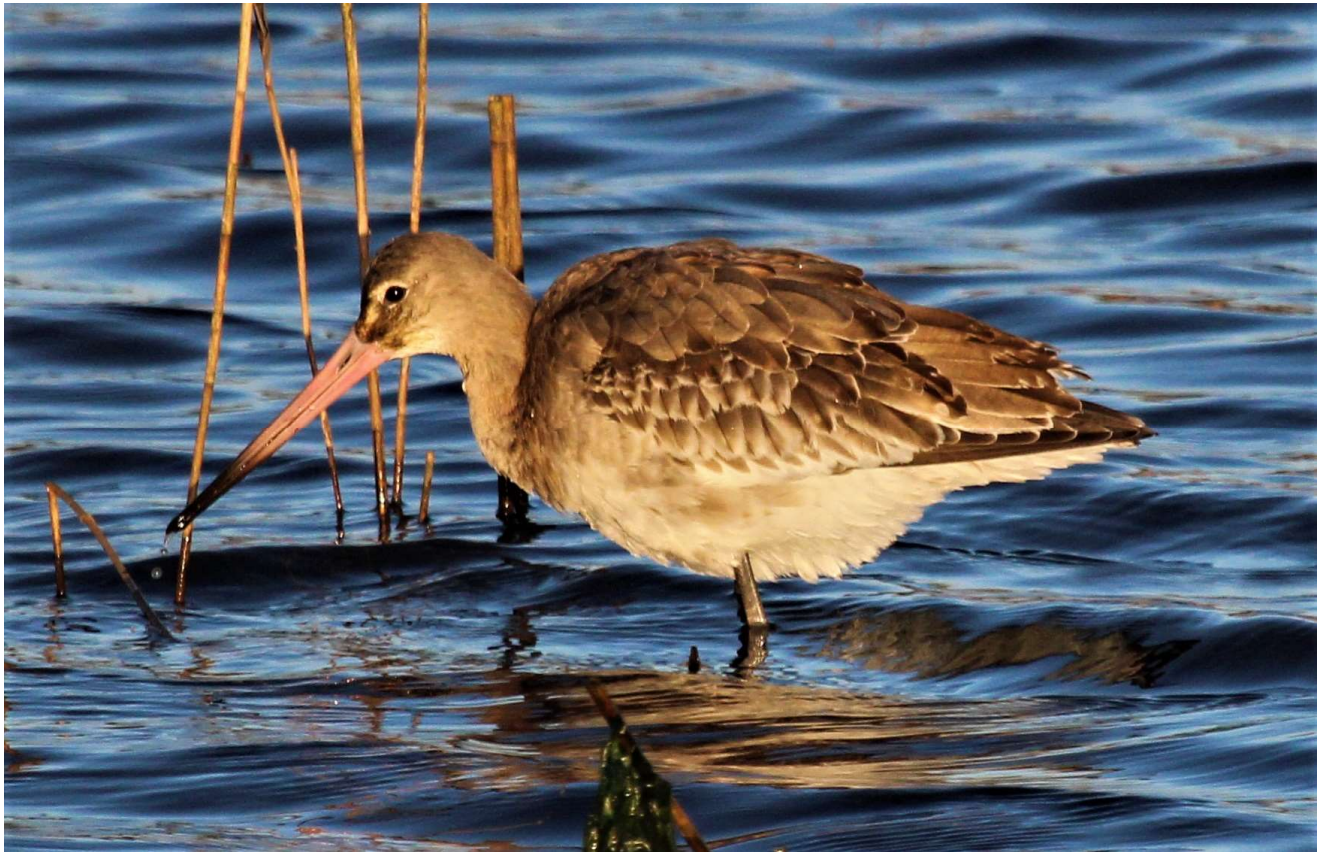
Black Tailed Godwit by the Kingfisher Pool

Black Tailed Godwit: Until 10 th November only seen flying over. Since then 200+ is the highest number recorded on the Pans. One has been seen close to the Kingfisher pool for several days.