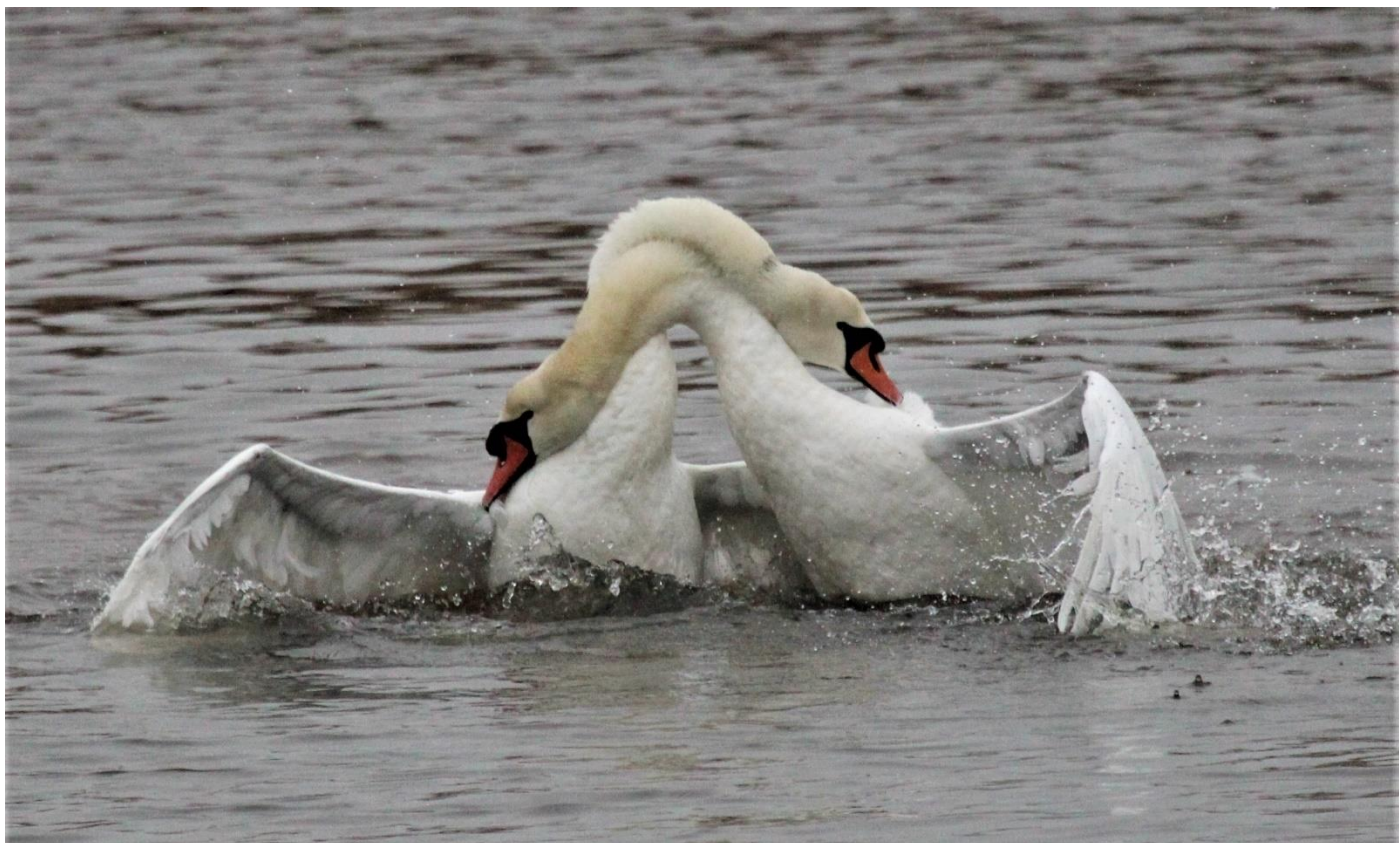
Two male Mute Swans having a tussle on Avon Water on the 25 th January.

Redshank: Present on 28 days during January. A colour and number ringed bird was photographed near the Observatory on the 11 th January. Photo below.