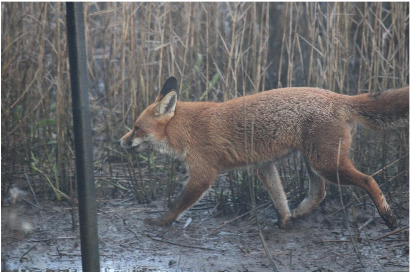
One of the three Foxes running past the Kingfisher Pool on 18 th Jan.

Fox: I thought there was only one Fox being photographed on the trail cams until the morning of the 18 th January when I saw three Foxes run past the Kingfisher Pool. A fourth Fox was seen calling on the far bank.