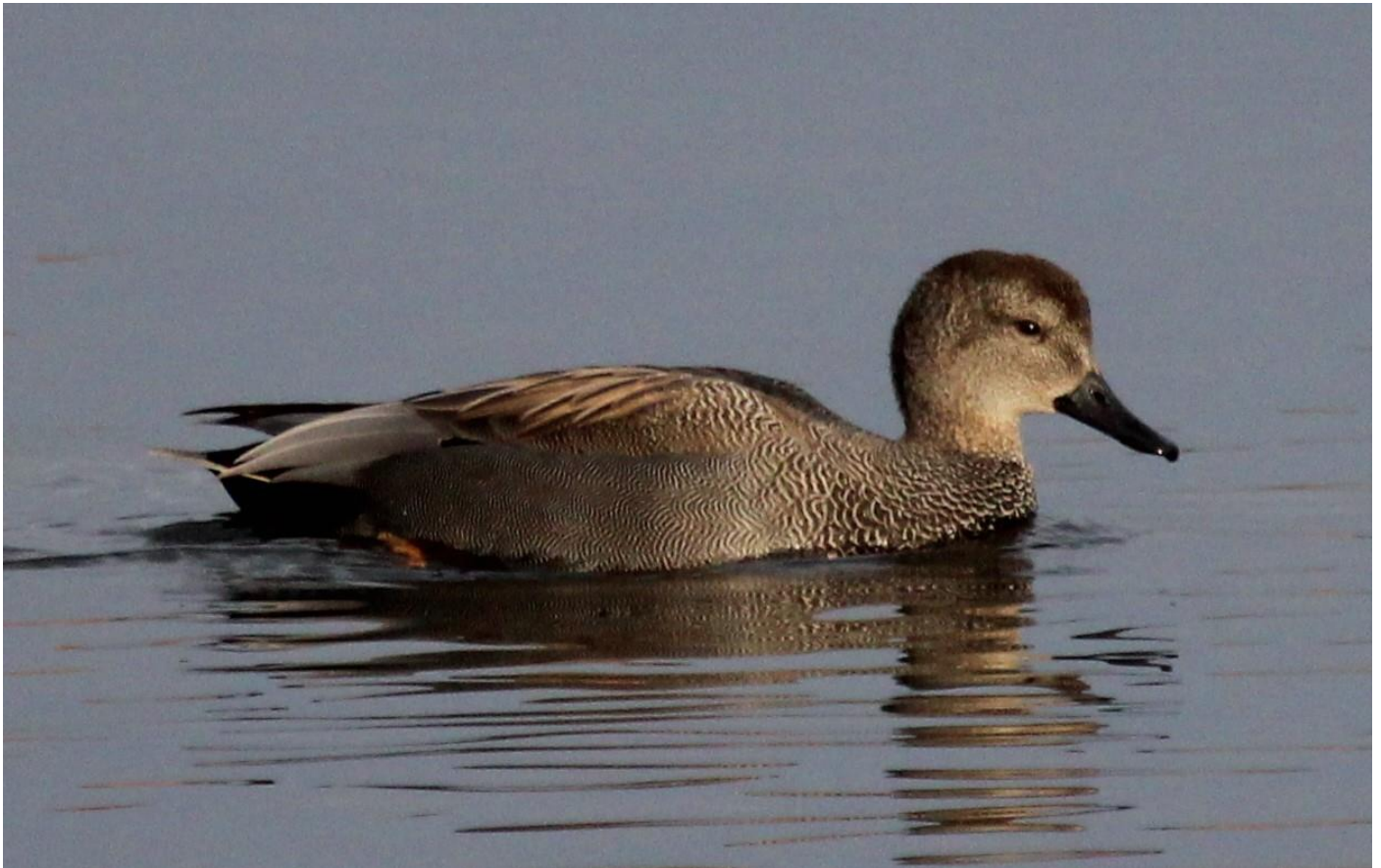
Male Gadwall near the Observatory.

Gadwall: Present every day. 56 was the highest number recorded on the 23 rd January.