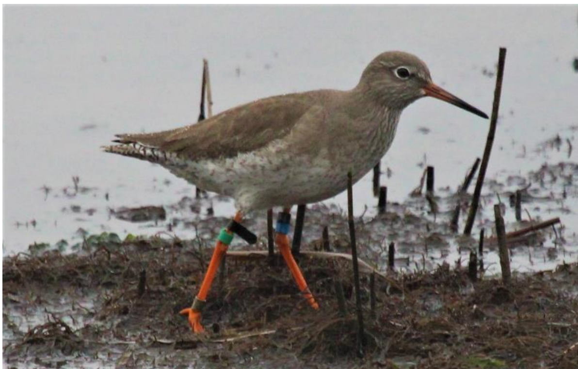
A colour and number ringed Redshank on the edge of the Kingfisher Pool.

Redshank: Present on 28 days during January. A colour and number ringed bird was photographed near the Observatory on the 11 th January. Photo below.