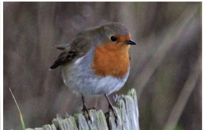
Robin (not ringed).