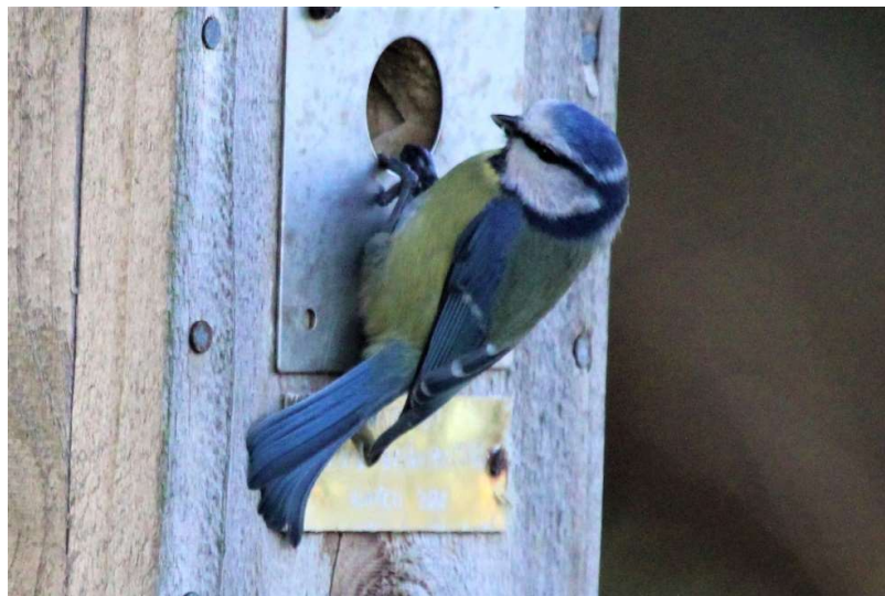
Blue Tit checking out the nest box.

Blue Tit: Common for the site, one bird is showing a lot of interest in one of the nest boxes.