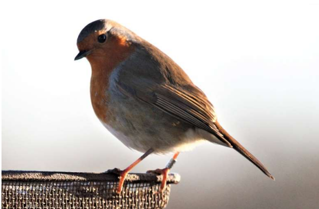
The ringed Robin (ring on right leg)

Robin: Seen nearly everyday. There are at least two Robins around the Observatory, one has been ringed and one that has not been ringed.