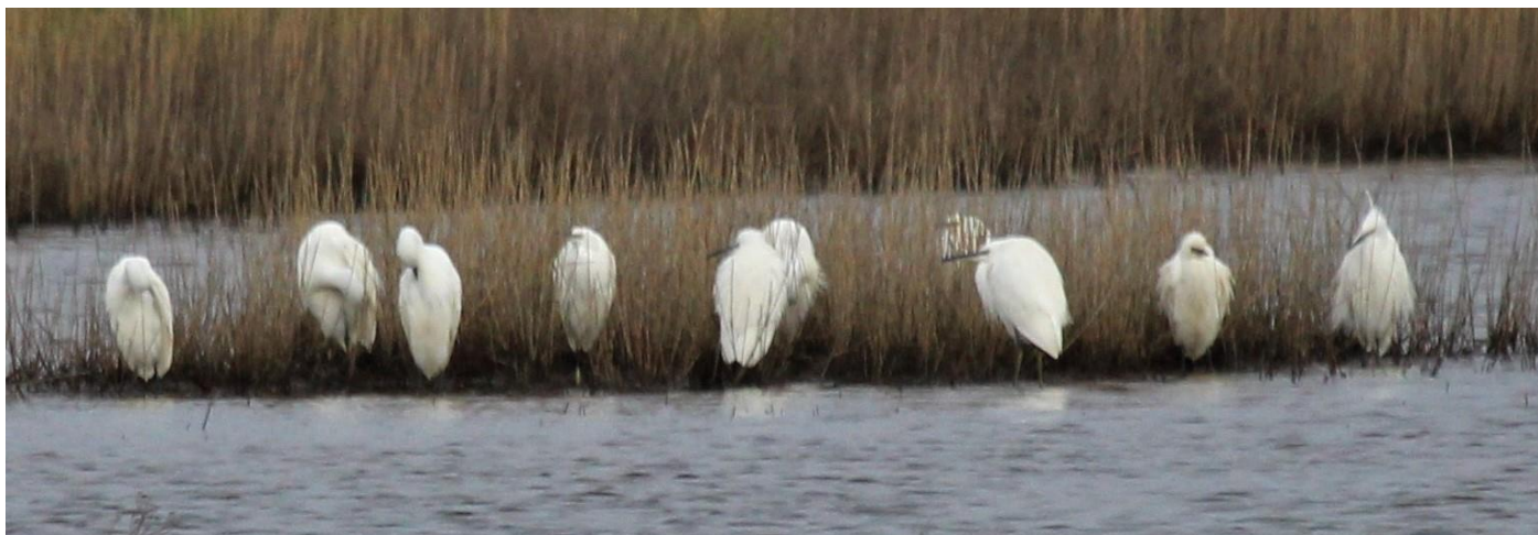
10 Little Egrets.

Little Egret: Have been present every day. 22 were seen on March 27 th .