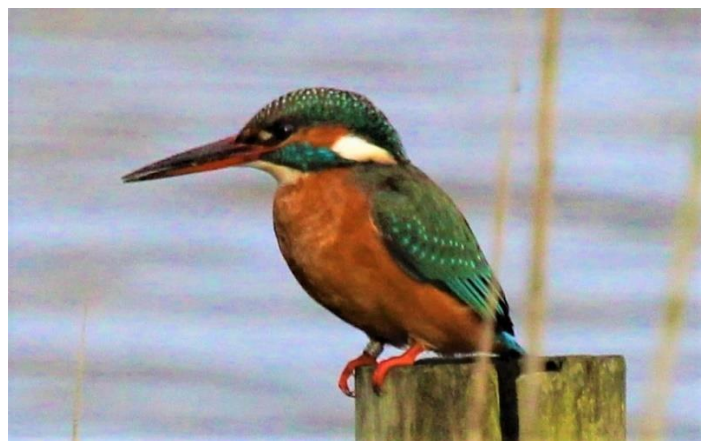
Female Kingfisher (note ring on right leg).

Little Egret: Have been present every day. 22 were seen on March 27 th .