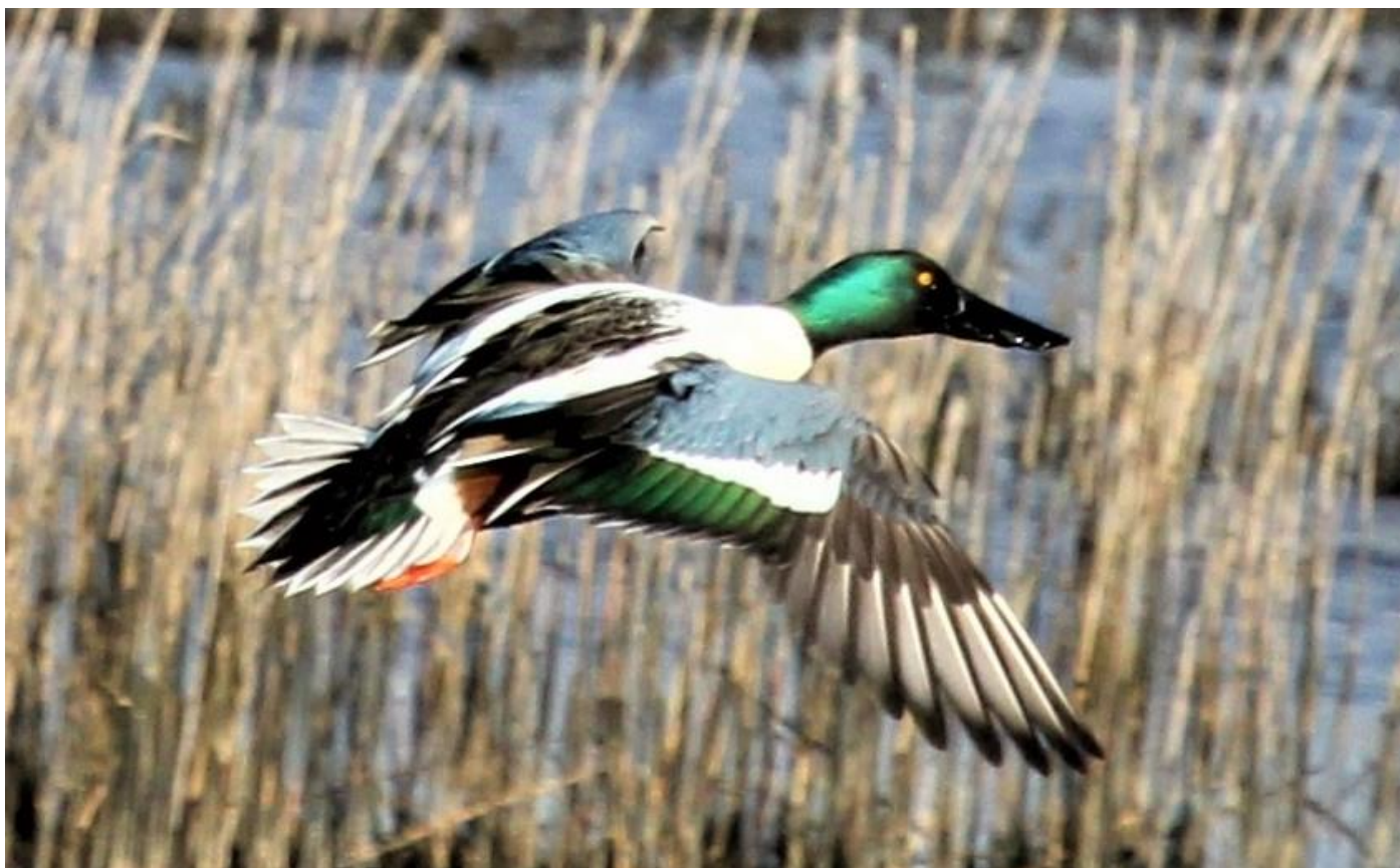
A male Shoveler in flight.

Shoveler: Has been present every day. 22 recorded on the 9 th March.