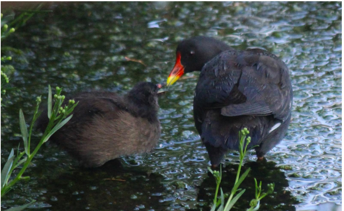
One Moorhen chick with one of the adults.

Moorhen: One or two adults seen around the Kingfisher Pool with three but usually only two chicks.