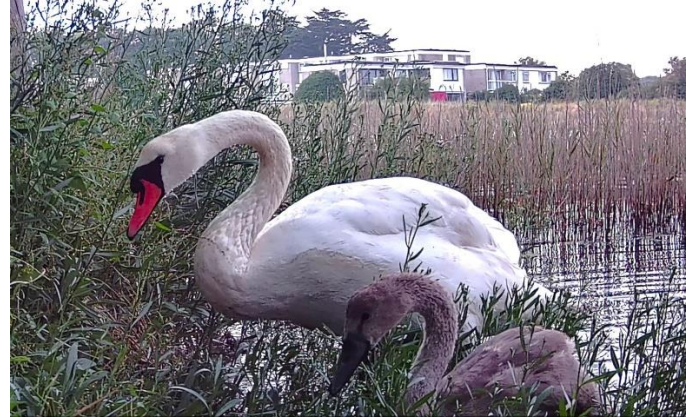
Mute Swan with one of the Cygnets.

Animals photographed: Badger, Brown Rat, Cat, Fox and Otter.