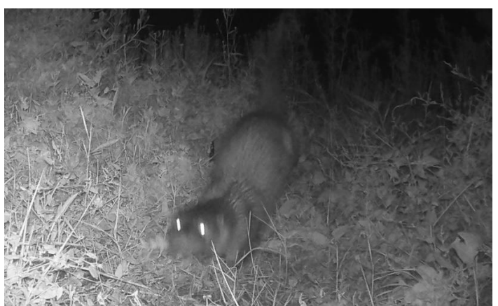
Otter. (27 th August).