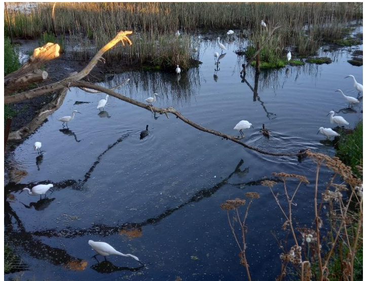
Kingfisher Pool with the tide going out. Kingfisher Pool with the tide coming in.

At the moment the Kingfisher Pool becomes filled with Blanket weed as the tide goes out. This clears as the tide comes back in.