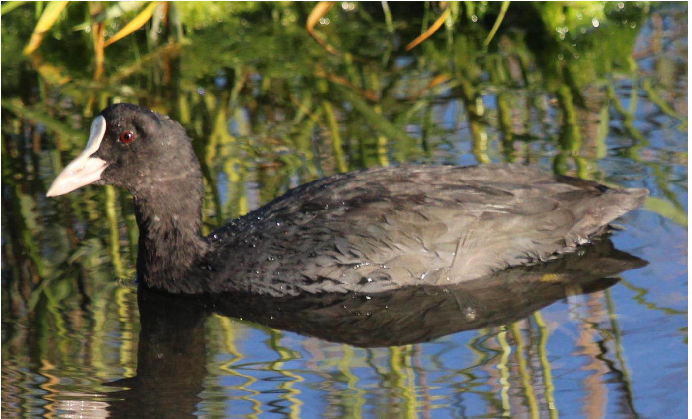
Coot in the Kingfisher Pool.

Coot: Present every day. 21 recorded on the 8 th August.