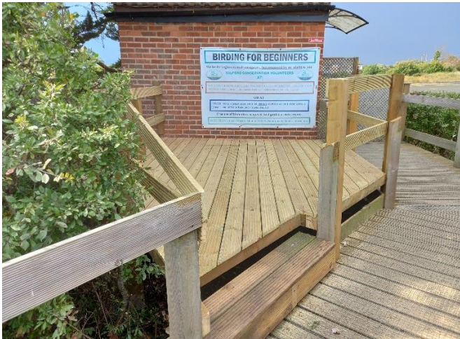
The new raised decking.