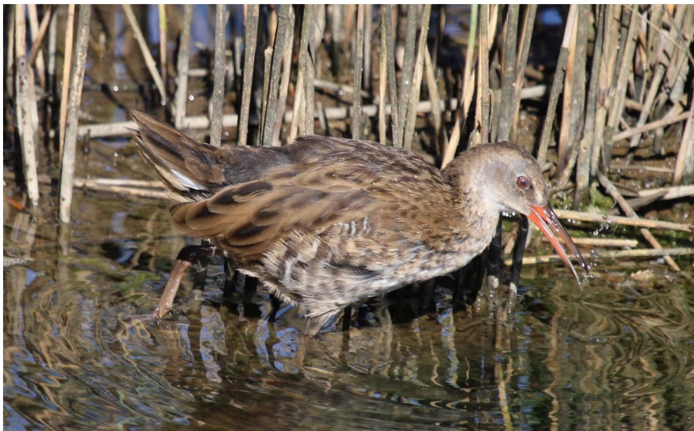
Water Rail in the Kingfisher Pool.

Water Rail: Present nearly every day. Three birds seen on the 6 th August.