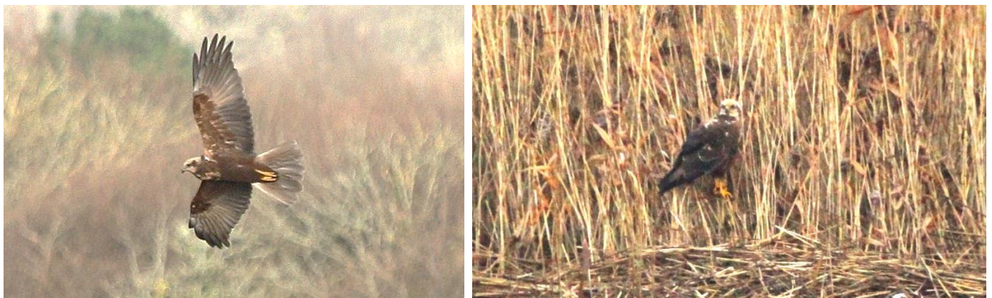
Marsh Harrier in flight and one in the reeds of Avon Water.

Marsh Harrier: Recorded every day. 5 present on the 6 th and 17 th November.