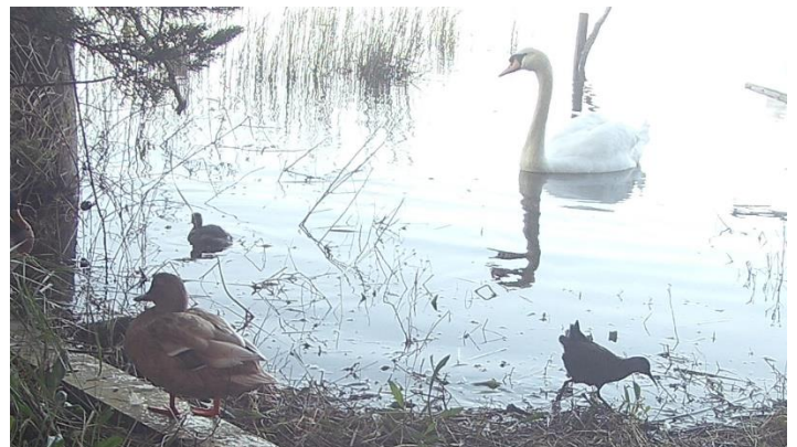
Mallard, Little Grebe, Mute Swan and Water Rail.