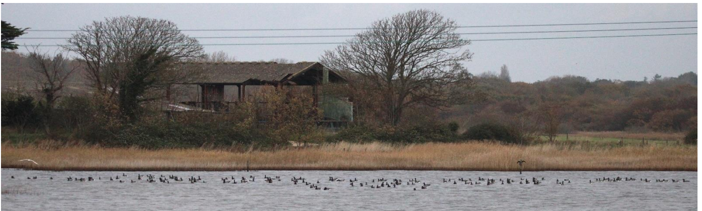
Part of the flock of Brent Geese at the Pans on 21 st November.

Brent Goose: First recorded on the Pans on the 2 nd November when 7 birds were present. Recorded on 26 occasions since then, with over 400 present on the 21 st November.