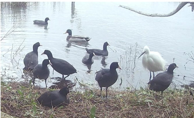
Coot, Mallard and Little Egret.

Birds Photographed: Blackbird, Coot, Lesser Black Backed Gull, Little Egret, Little Grebe, Mallard, Moorhen, Mute Swan, Pheasant, Robin, Water Rail and Woodpigeon.