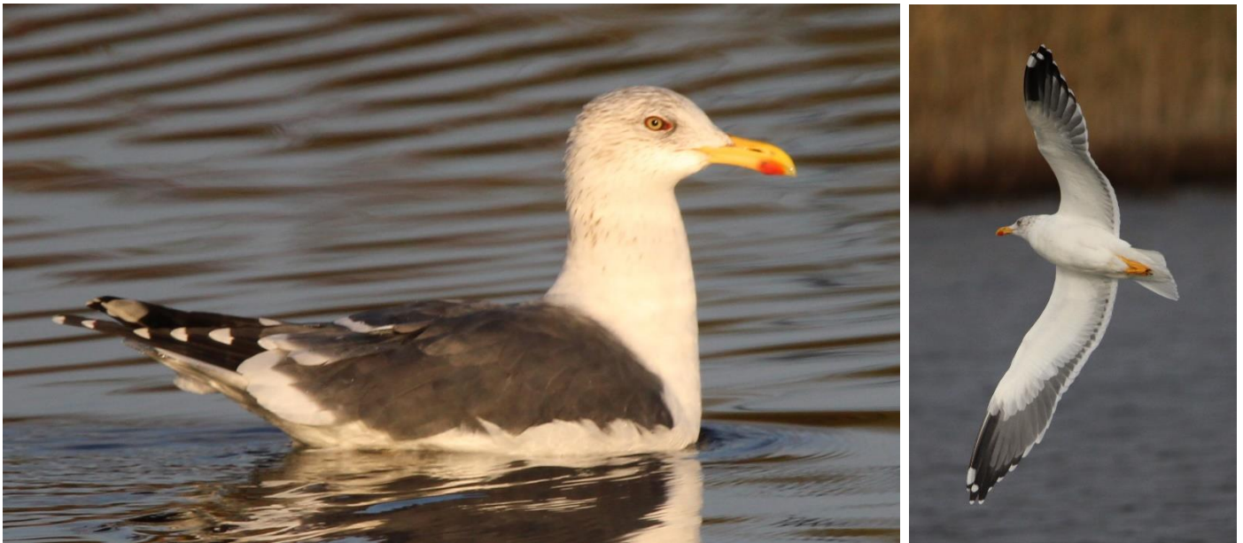
Lesser Black Backed Gull.

Lesser Black Backed Gull: One present nearly every day.