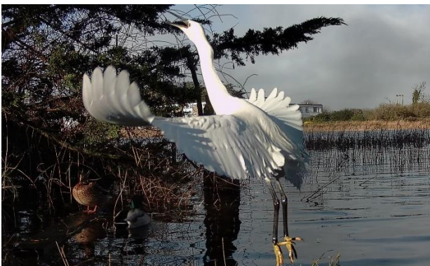
Little Egret taking off.

Birds recorded: Blackbird, Buzzard or Marsh Harrier, unable to positively identify the bird photographed, Coot, Grey Heron, Kingfisher, Little Egret, Little Grebe, Lesser Black Backed Gull, Magpie. Mallard, Moorhen, Mute Swan, Pheasant, Shoveler, Snipe, Tufted Duck, Water Rail and Woodpigeon.