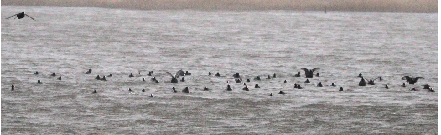
Part of a large flock of Coot.

Coot: Present every day. 92 Coot were recorded on the 27 th December. This is probably the highest number recorded since the Observatory opened in November 2017.