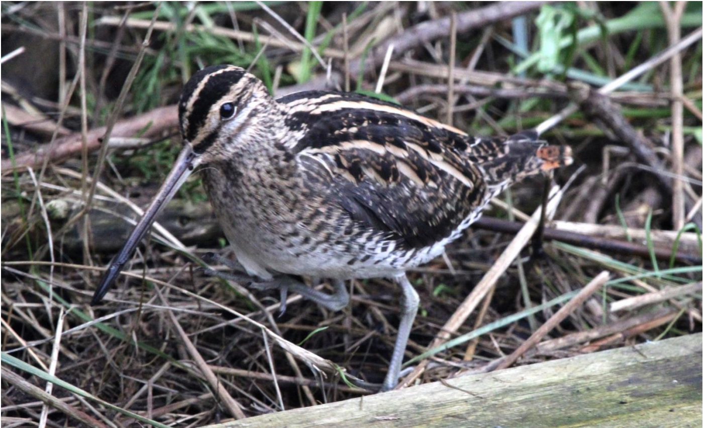
Snipe near the Kingfisher Pool.

Snipe: Have only been seen on 12 occasions up until the 16 th of December, since then there have been no more sightings.