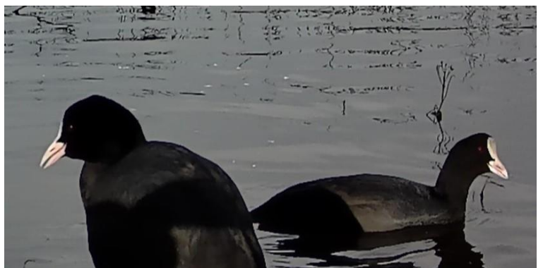
Coot in the Kingfisher Pool.