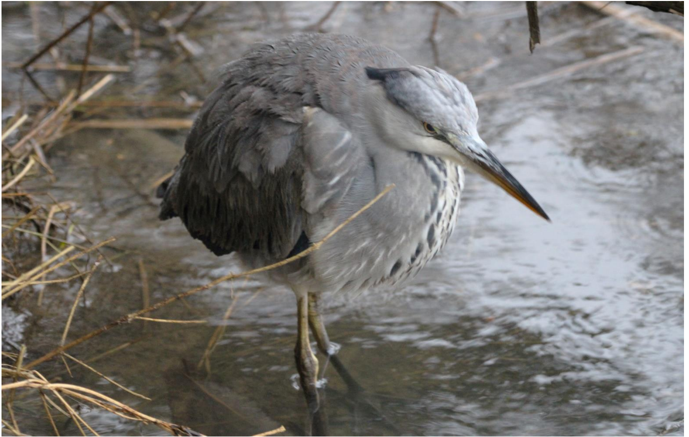
A juvenile Grey Heron.

Grey Heron: A single bird Present on 17 days during December.