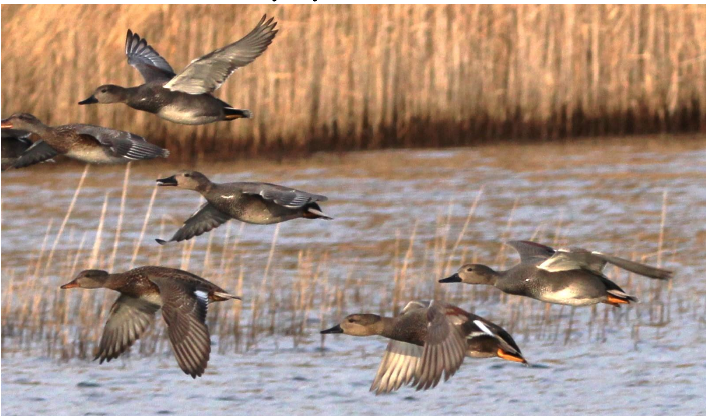
Gadwall flying in.

Gadwall: Recorded every day. 162 were seen on the 21 st December.