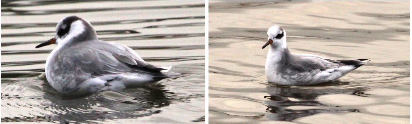
The Grey Phalarope as it swam past the Observatory.

Grey Phalarope: A first for the site. One was present on the 8 th January and it wasn't there for long.