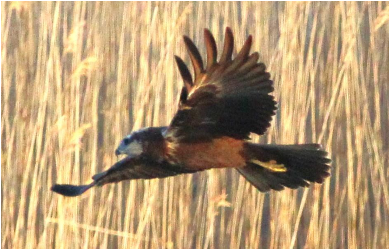
Marsh Harrier over Avon Water.

Marsh Harrier: One or two birds seen most days.