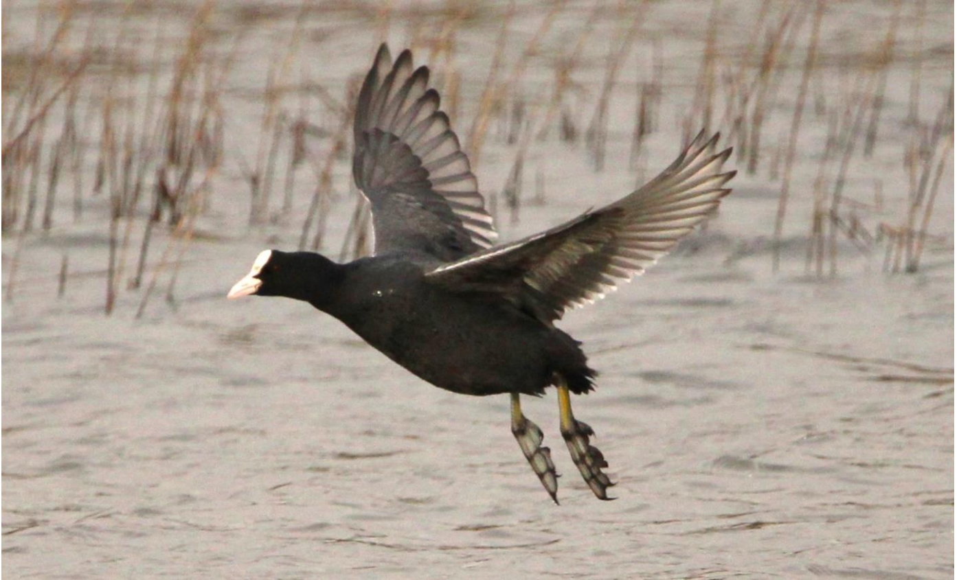
A Coot in flight