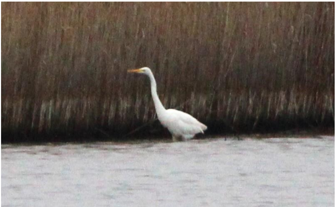
Great White Egret on the 29 th January.

Great White Egret: One seen at the far end of the Pans on the 29 th and 30 th January.