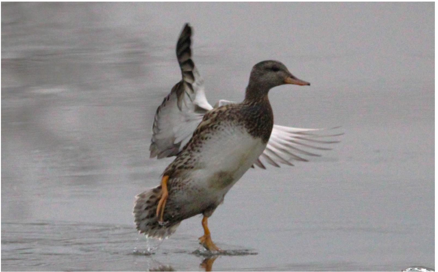
Gadwall landing on the melting ice.

Gadwall: Recorded every day. 102 has been the highest number.