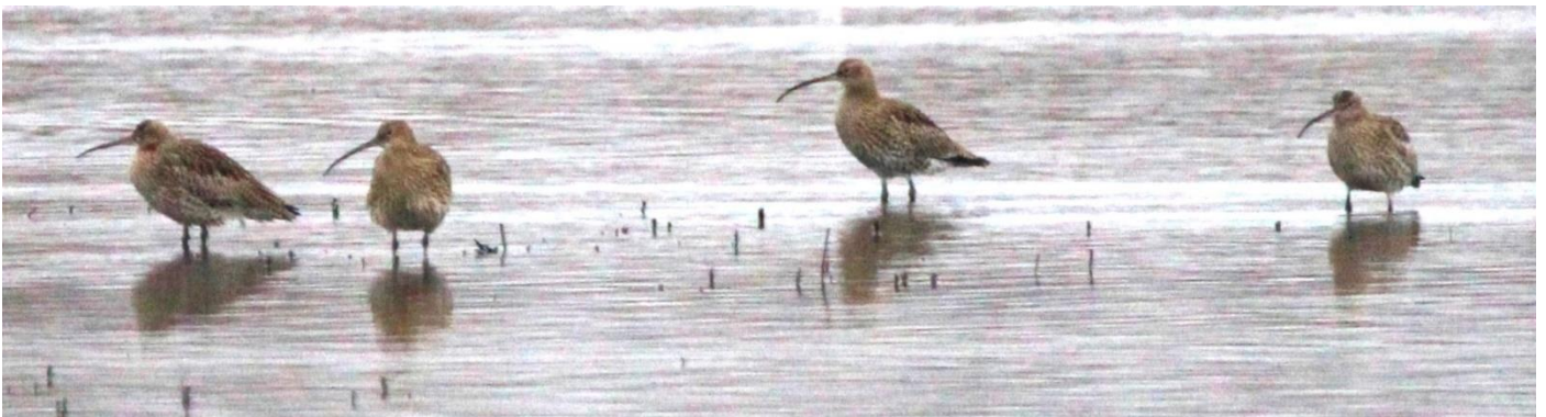
4 of the 8 Curlew present on the 29 th January.

Curlew: Since the water levels have started to go down, Curlew as well as Redshank and Greenshank have returned to the Pans. 8 Curlew were present on the 29 th January.