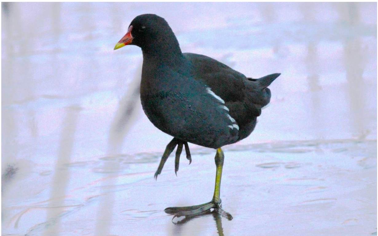
Moorhen on the frozen Pans.

Moorhen: Recorded on only 13 days this month. 3 were seen on the 18 th and the 29 th .