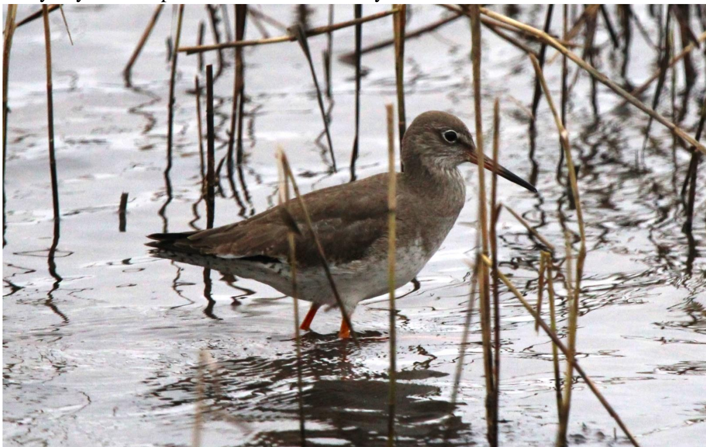
Redshank by the Kingfisher pool on the 30 th January.

Redshank: Before the 24 th January only recorded twice. Since then, present every day. 8 were present on the 31 st January.