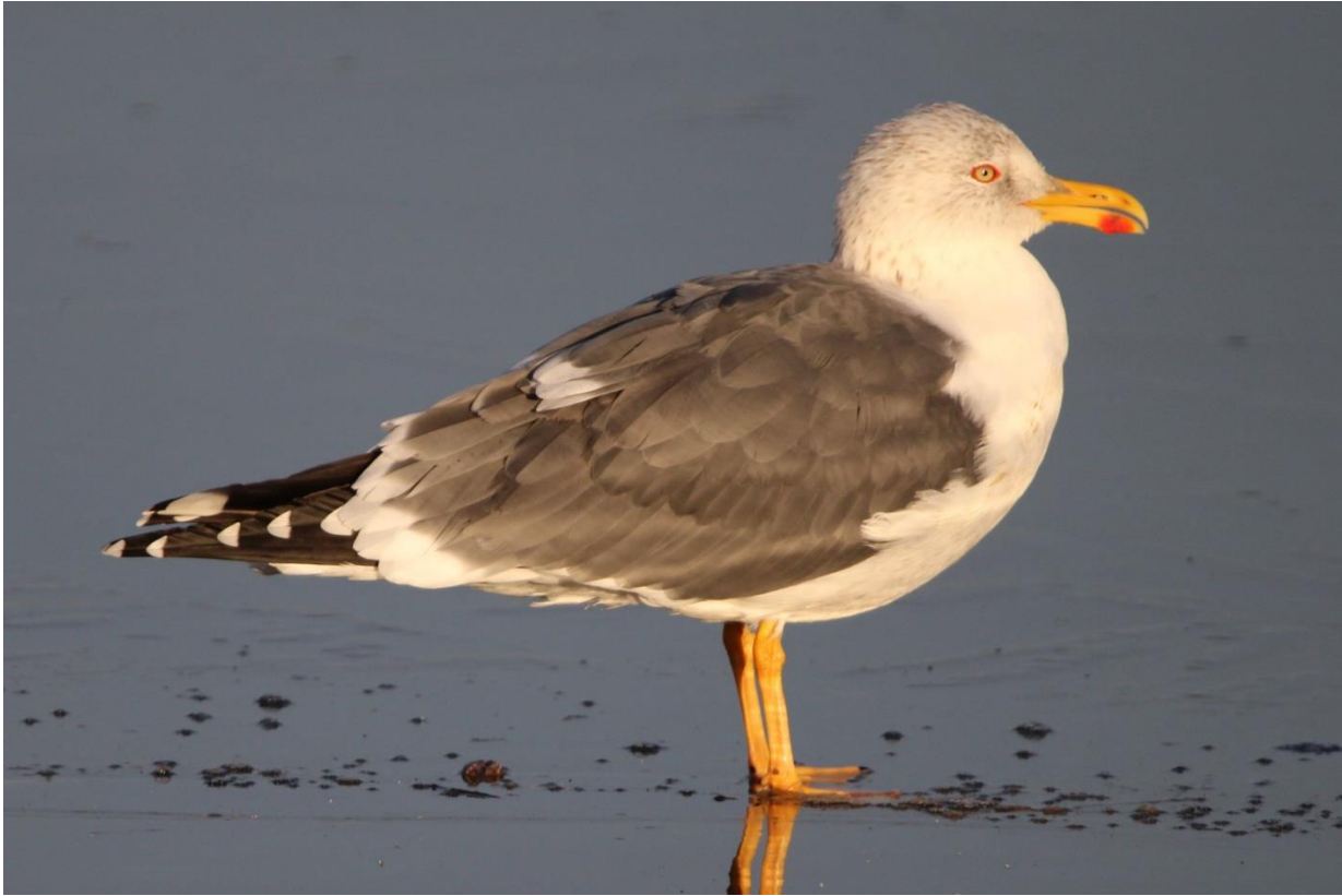
Lesser Black Backed Gull on the ice.

Lesser Black Backed Gull: Before the 17 th January, it was only seen 4 times. Since then, one has been present every day.