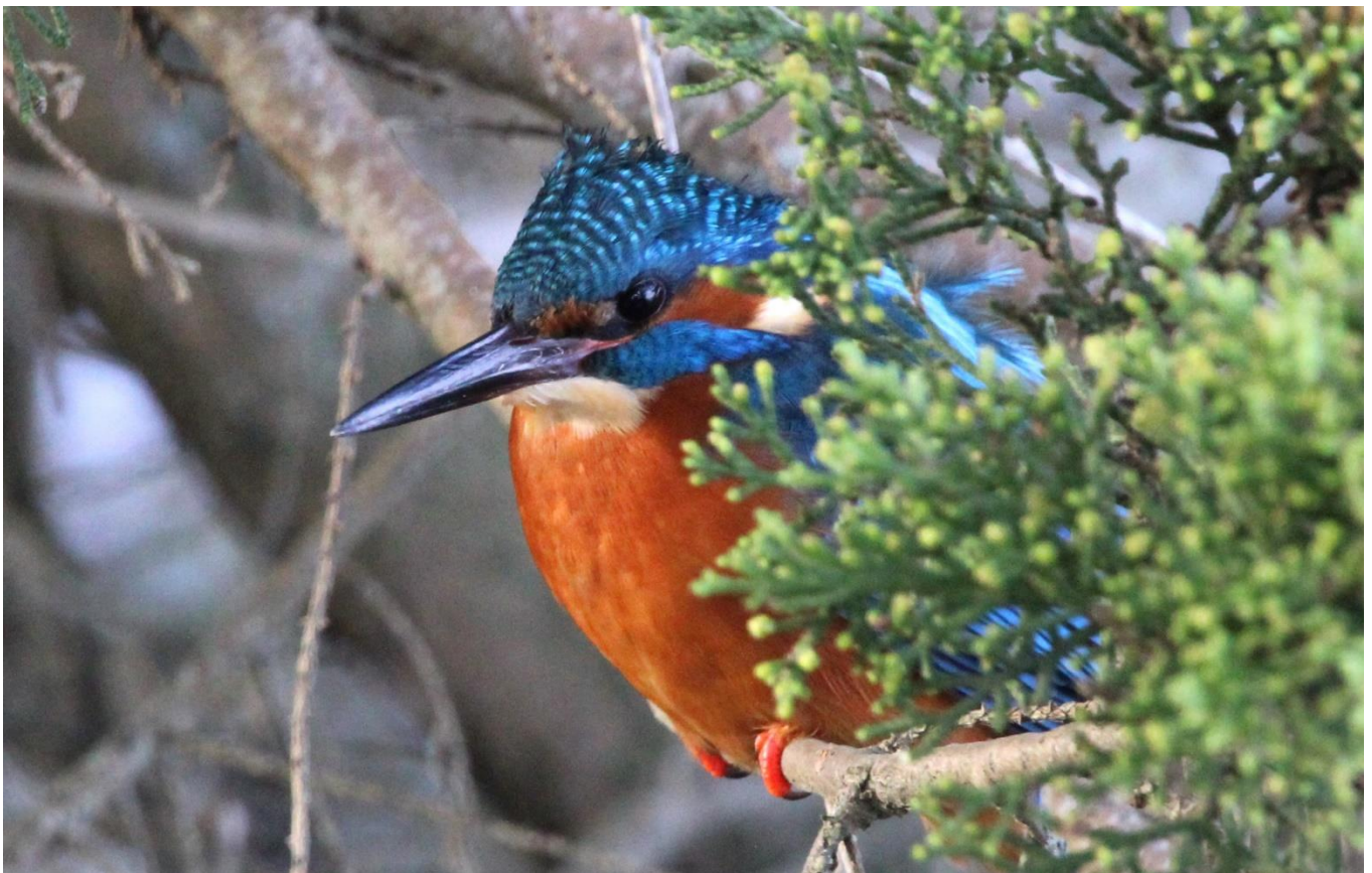
Kingfisher in the Fir tree by the Observatory.

Kingfisher: Only one bird has been seen around the Kingfisher Pool this month and that is an adult male. Seen on 21 occasions.