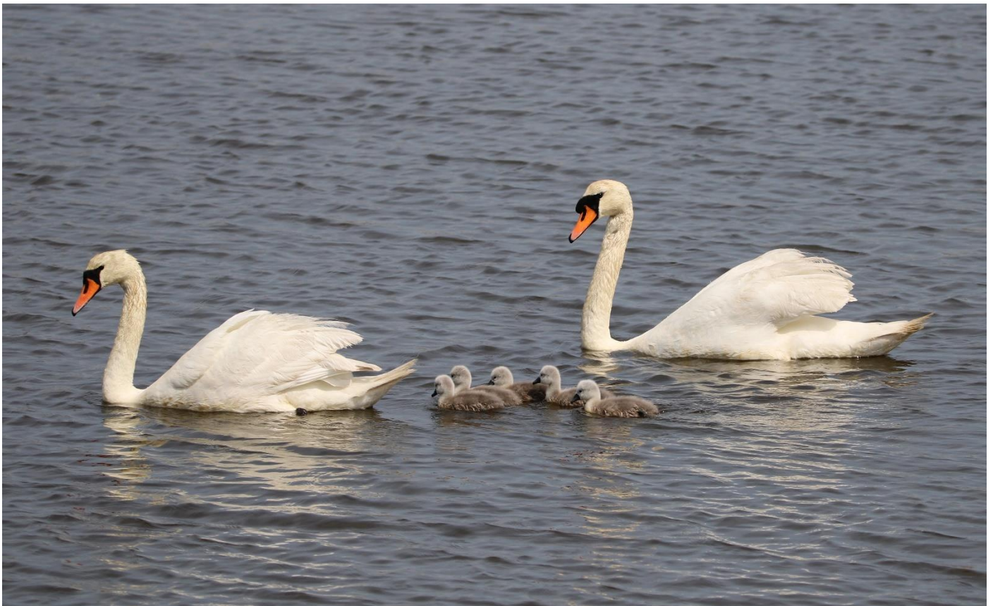
The two adult Mute Swans with the 5 cygnets.

Mute Swan: The Pair of Mute Swans on Avon Water had 5 cygnets, they were first seen on Wednesday 24 th May.