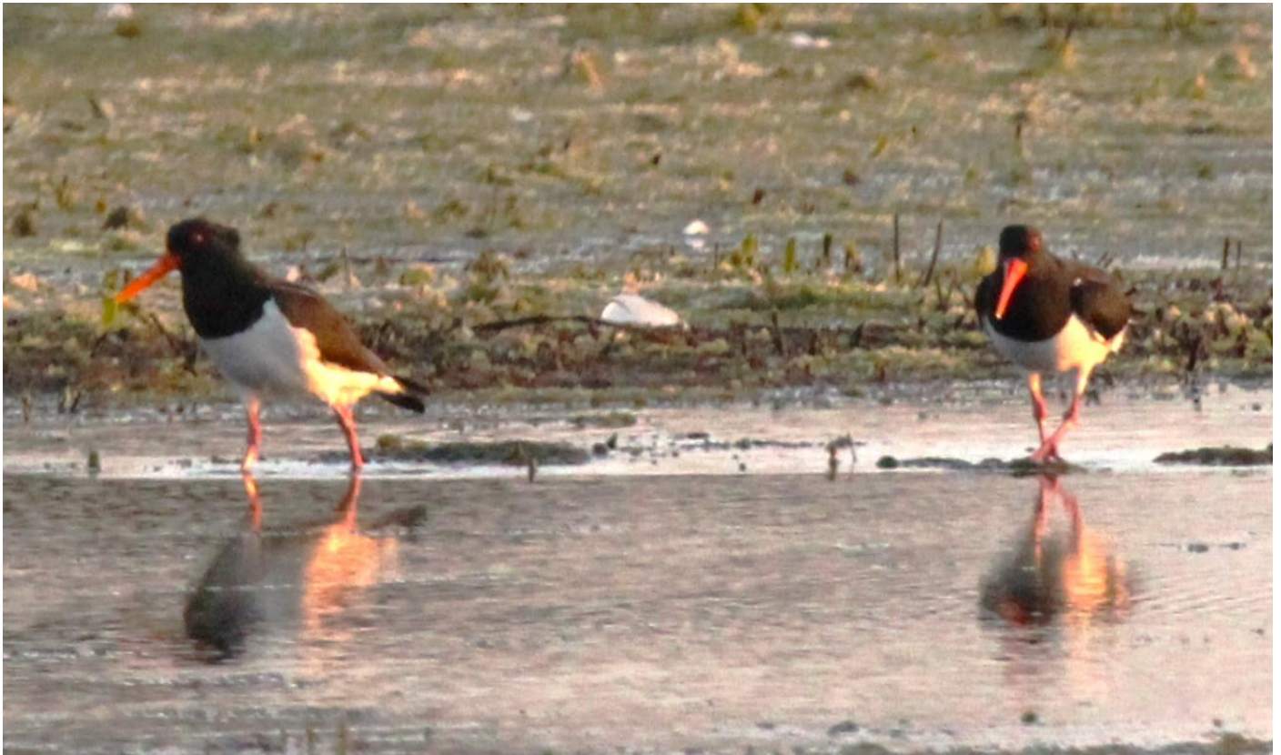
Oystercatcher at the Pans on the 30 th May.

Oystercatcher: Regularly seen with 3 being the highest number recorded.