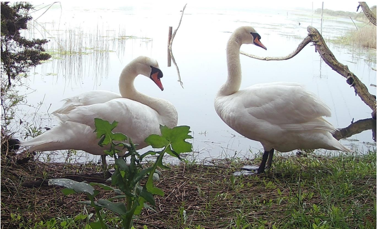
A pair of Mute Swans by the Kingfisher Pool.

Birds recorded: Blackbird, Black Headed Gull, Carrion Crow, Grey Heron, Little Egret, Mallard and Mute Swan.