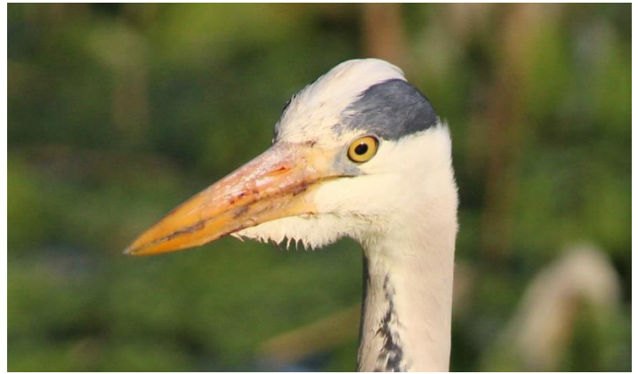
Grey Heron near the Kingfisher Pool.

Herring Gull: Regularly seen flying over the site as well as on the roof of a house in Harewood Green.