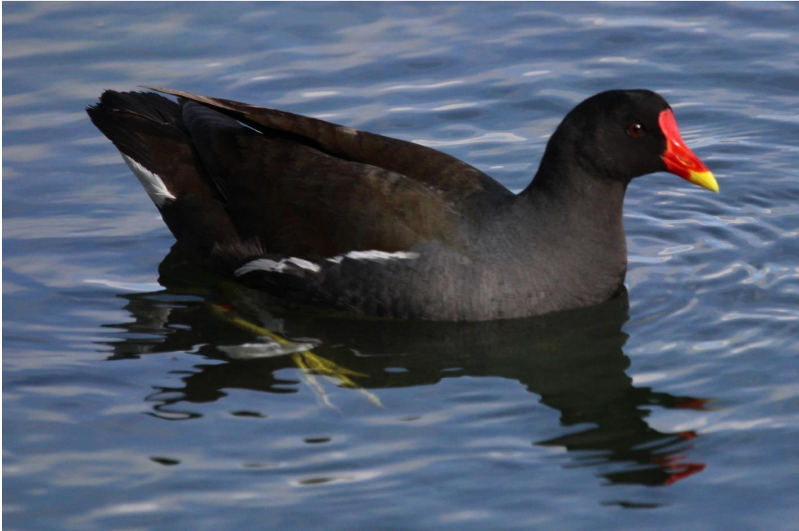
Moorhen crossing the Kingfisher Pool.

Moorhen: Seen every day during May, sometimes two birds but normally just one.