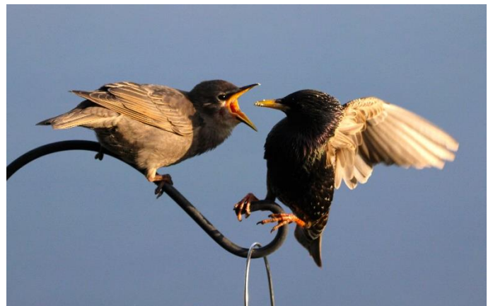
Starling chicks being fed by their adults.