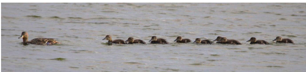
One pair had 10 ducklings but are now down to nine.