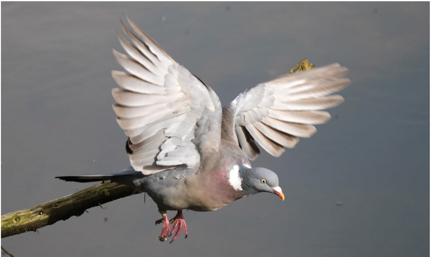
Woodpigeon taking off.

Wood Pigeon: Recorded most days during May.