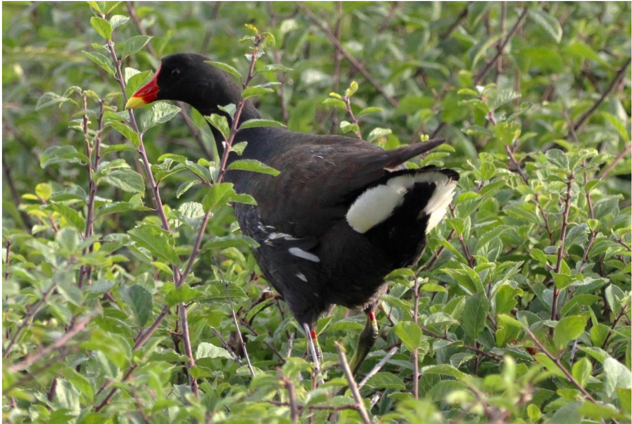
A Moorhen climbing over the central hedge.

Moorhen: One seen most days. Two were seen on the 19 th , 24 th and 25 th July.