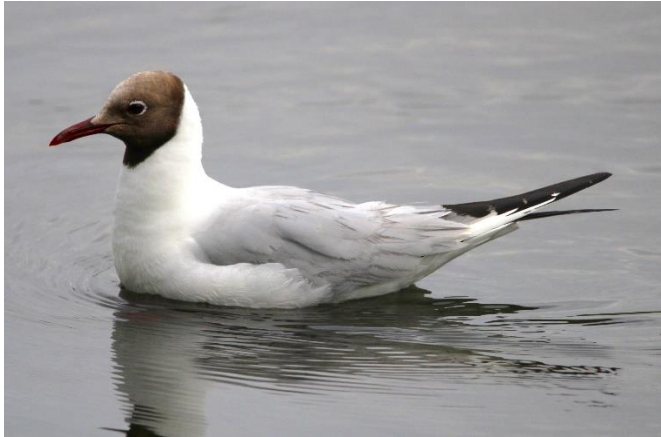
Adult Black Headed Gull.

Black Headed Gull: Present every day. Lots of juveniles present.