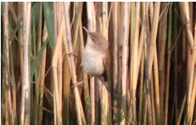
Reed Warbler (on Avon Water).

Reed Warbler: Seen and heard every day of the month.