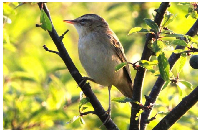
Sedge Warbler (on the central hedge).

Sedge warbler: Seen on 6 days during the month.