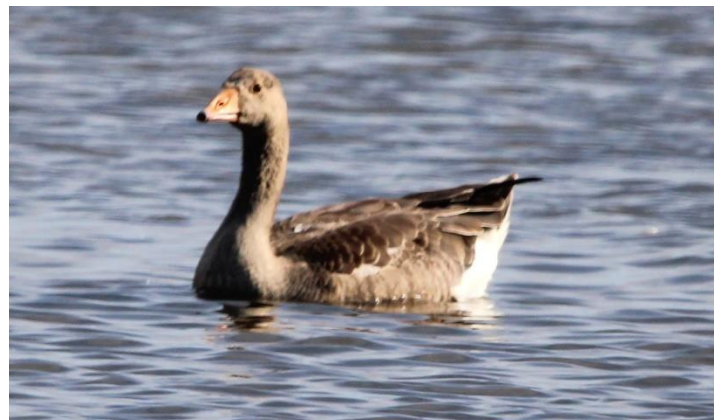
One of the Greylag geese near the Observatory.