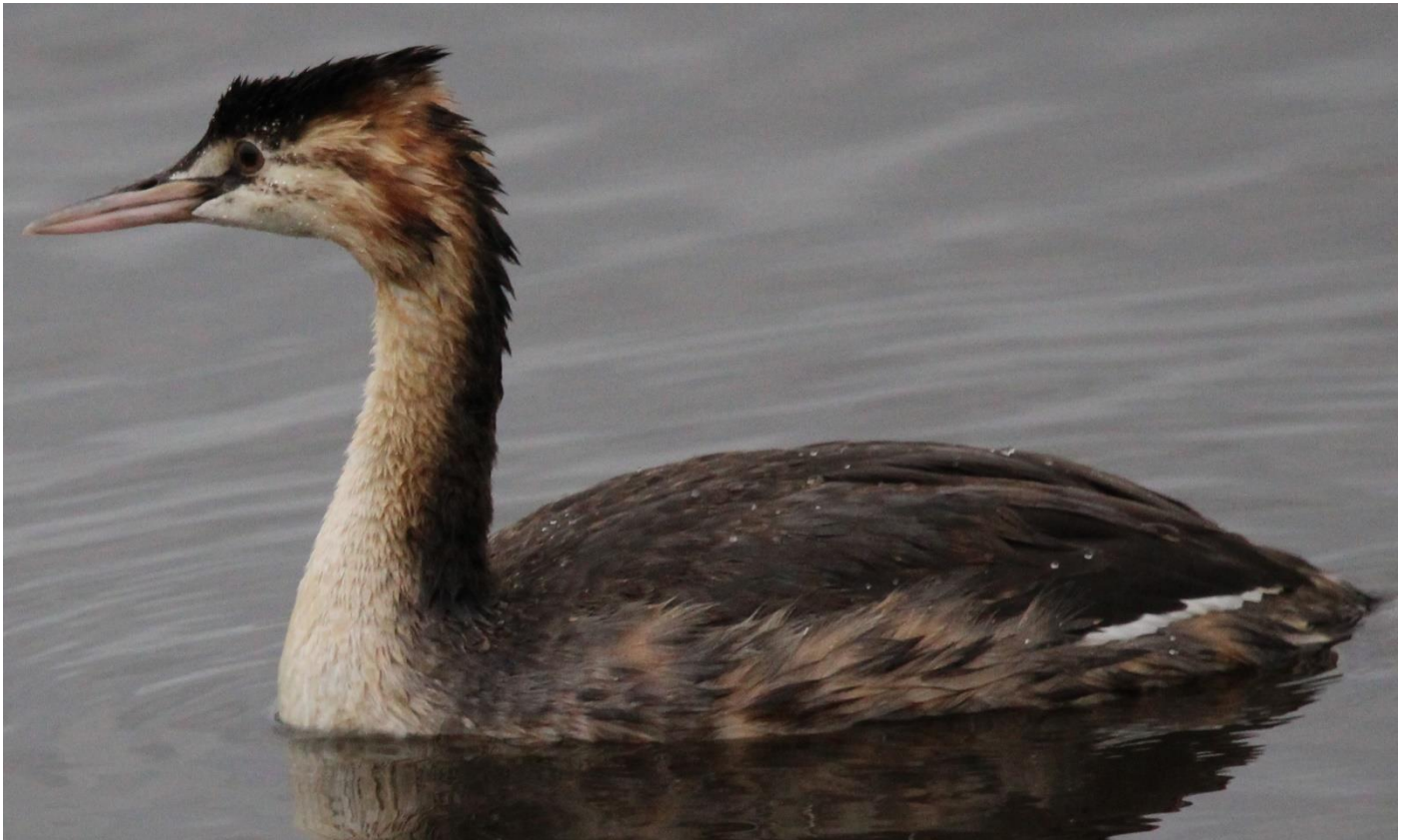
Juvenile Great Crested Grebe.

Great Crested Grebe: A juvenile bird was present on Avon Water until the 5 th July.