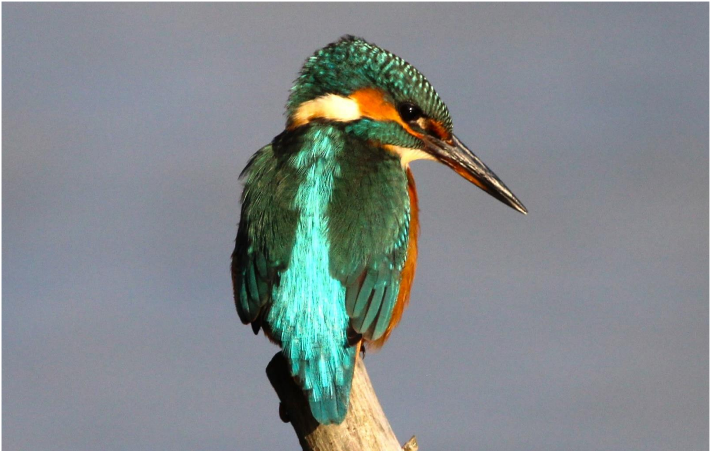
A juvenile female Kingfisher.

Kingfisher: A juvenile female has been recorded on 22 days during July. Two birds have been seen flying over on 3 occasions.