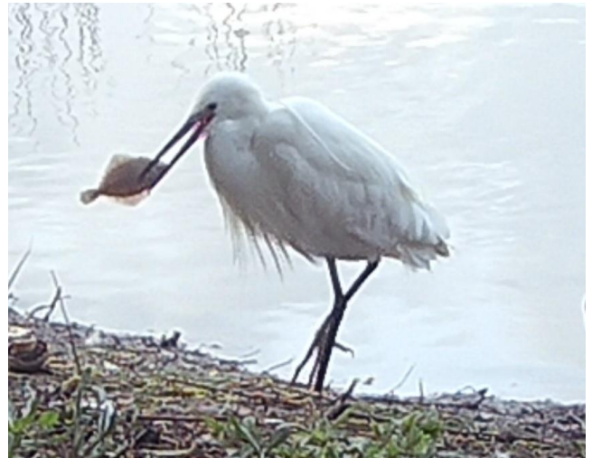
Little Egret with food.