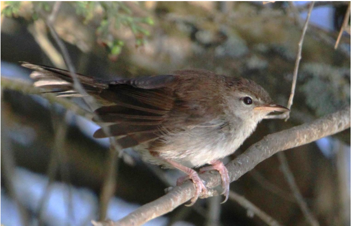
Cetti's Warbler by the Kingfisher Pool on the 7 th July.

Cetti's Warbler: Heard most days but only seen on 5 occasions.