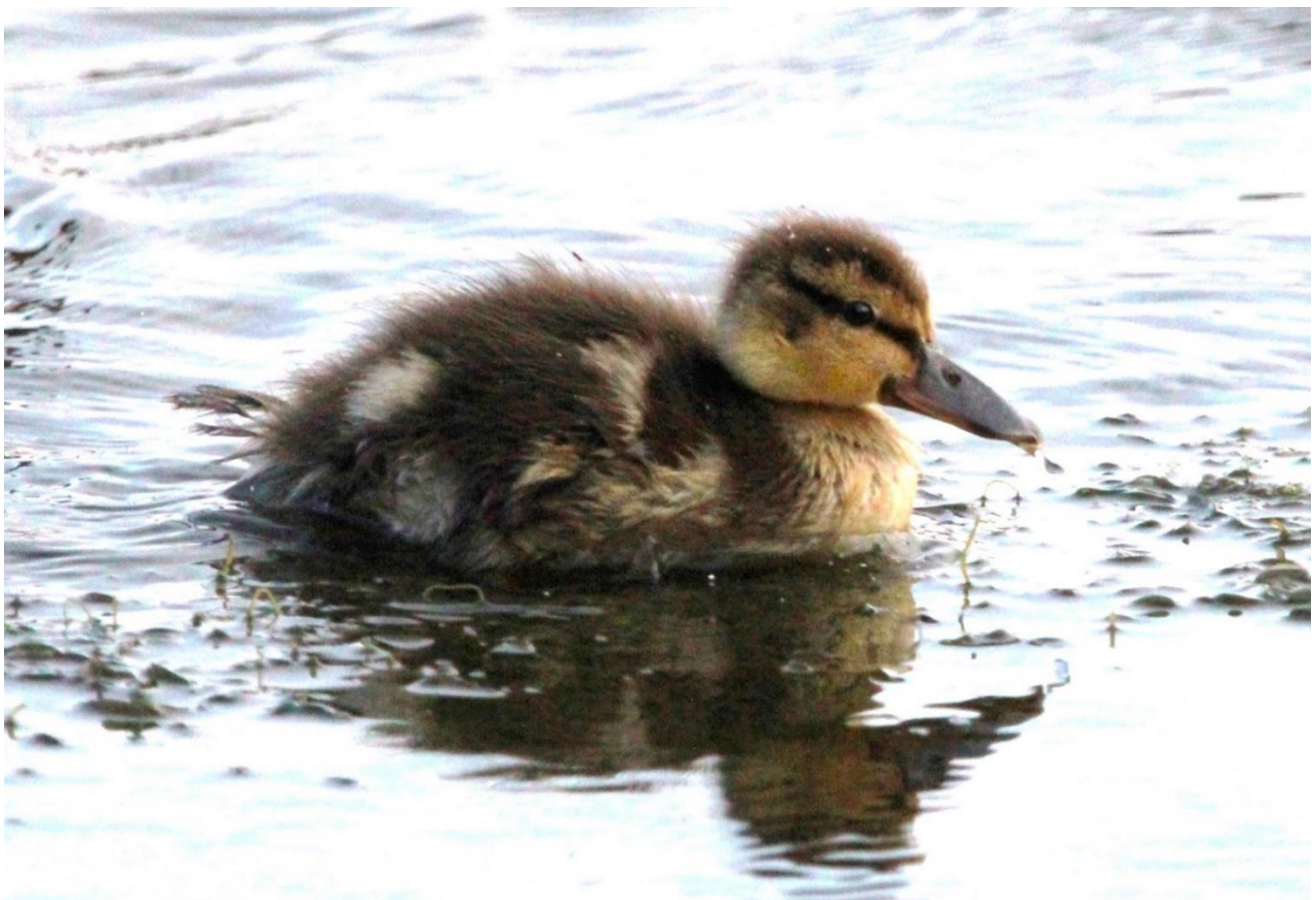
One of the six ducklings.

Mallard: Present every day. 154 has been the highest number recorded (on the Pans and Avon Water combined). One female has 6 ducklings.