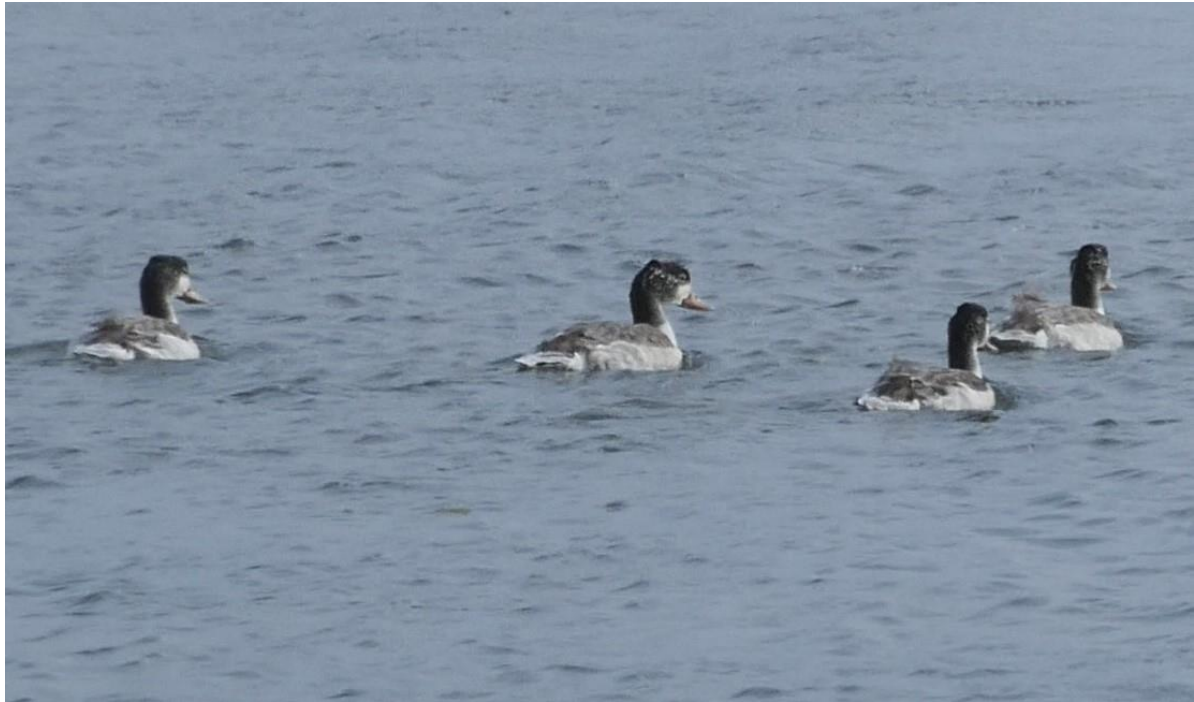
Shelduck ducklings on the 26 th July.

Shelduck: At the beginning of the month one pair had 8 ducklings, the ducklings have been slowly lost during the month so by the 31 st there were only three remaining.