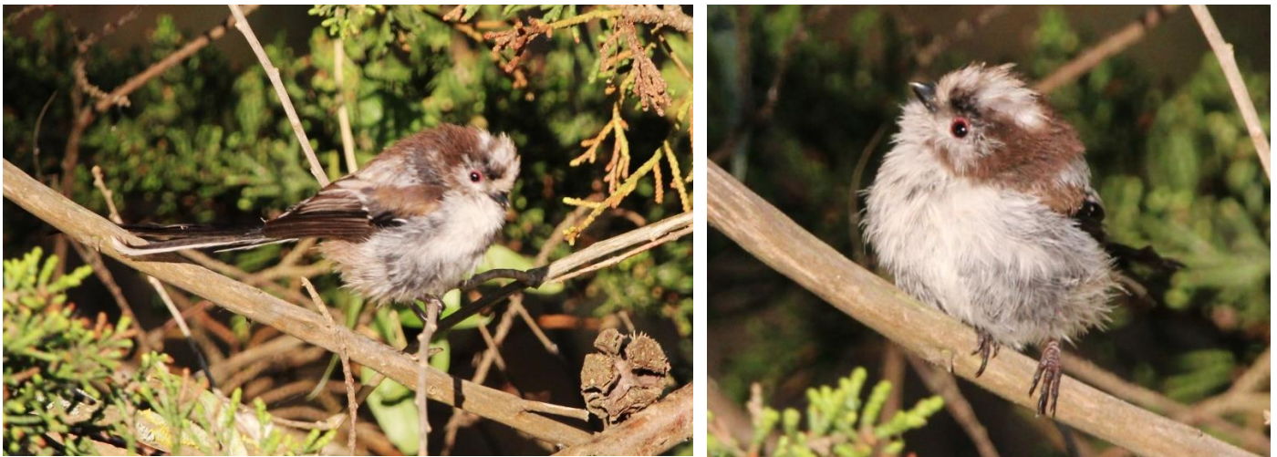
Long Tailed Tit.

Long Tailed Tit: A juvenile was seen in the Fir tree by the Kingfisher Pool on the 20 th July.