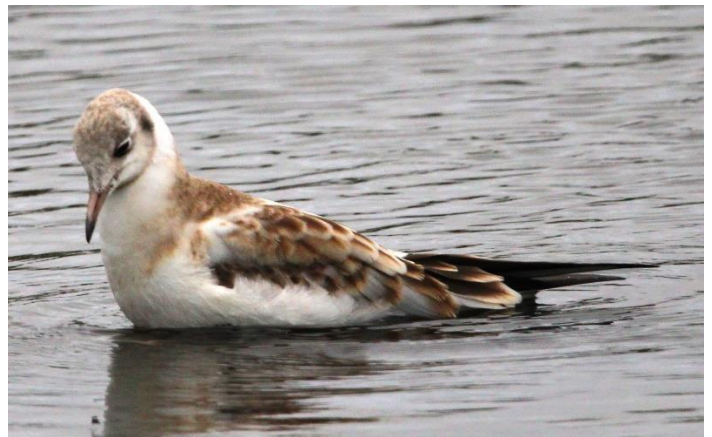
Juvenile Black Headed Gull.

Cetti's Warbler: Heard most days but only seen on 5 occasions.