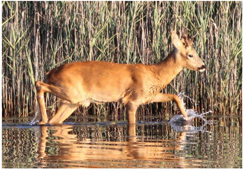
Roe buck on the Pans.