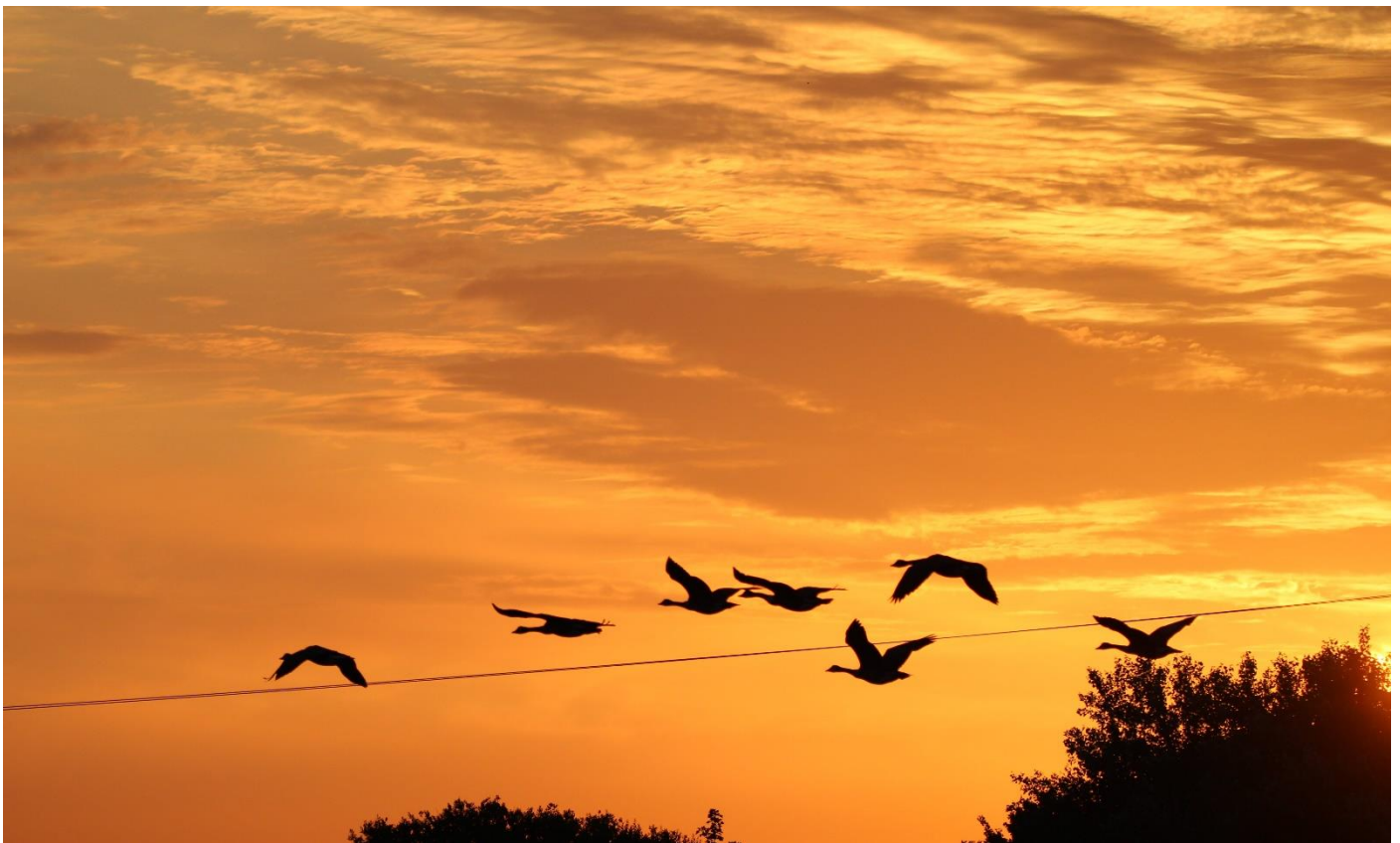
Canada Geese flying over Avon Water.