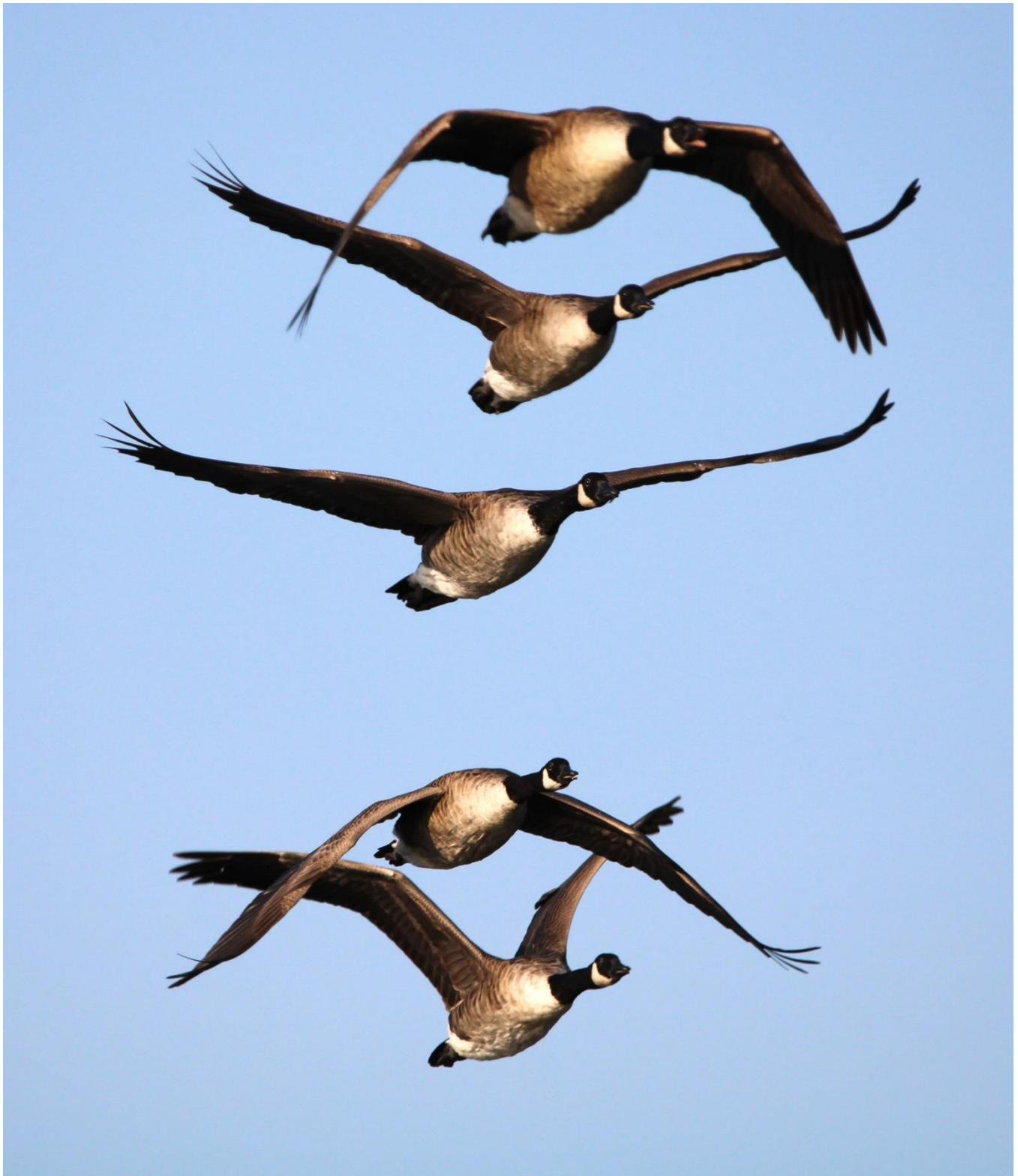
Canada Goose flying over the Observatory.

Canada Goose: Recorded nearly every day of the month. Large numbers were seen on the Pans and Avon Water as well as flying over the site.