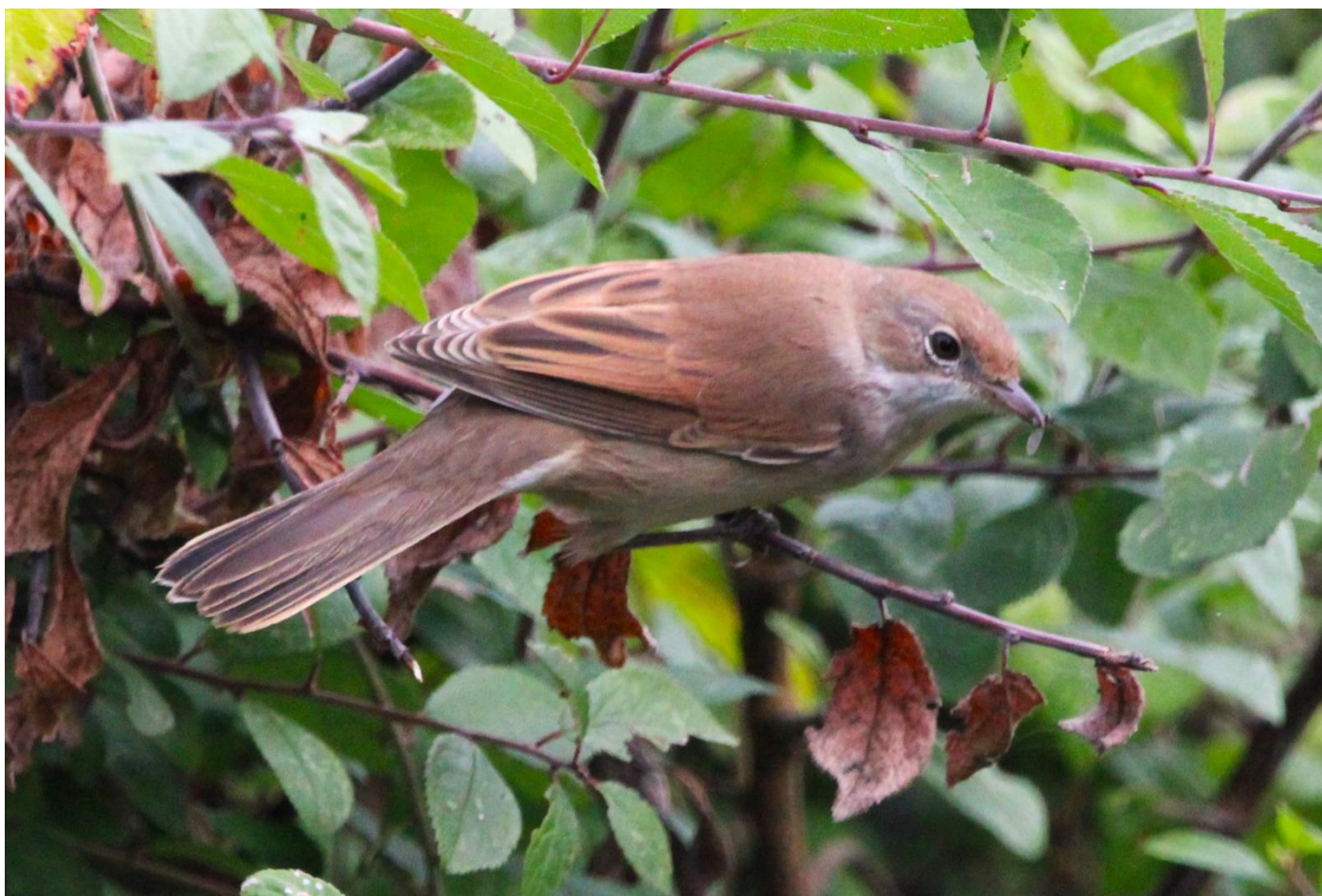
Whitethroat on the central hedge on the 23 rd August.

Whitethroat: Present on two occasions. Two seen on the 30 th .