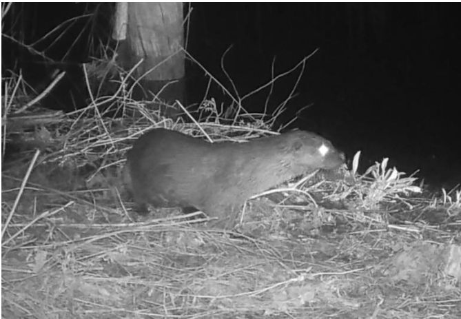
Otter 14 th August.