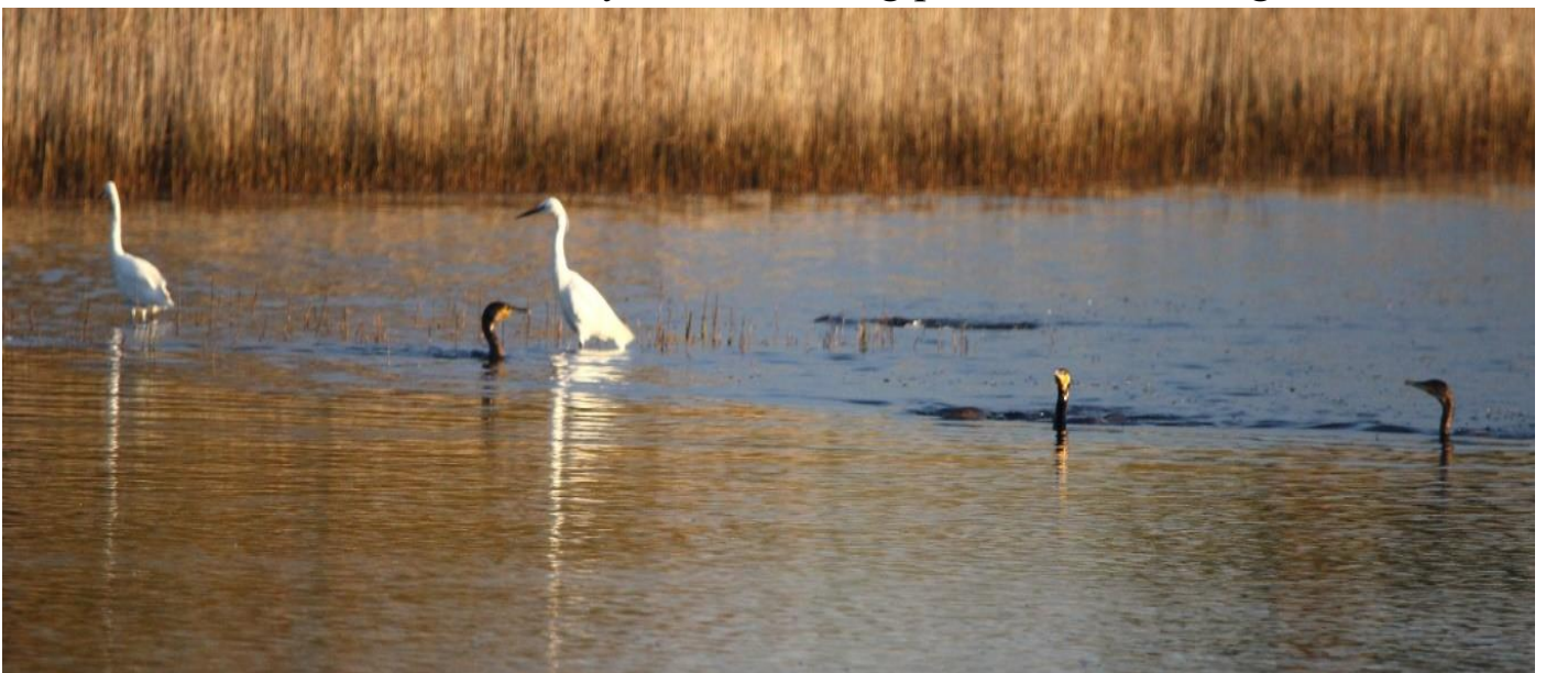
Three Cormorants and two Little Egrets fishing on the Pans.

Cormorant: Seen most days, with 7 being present on 29 th August.