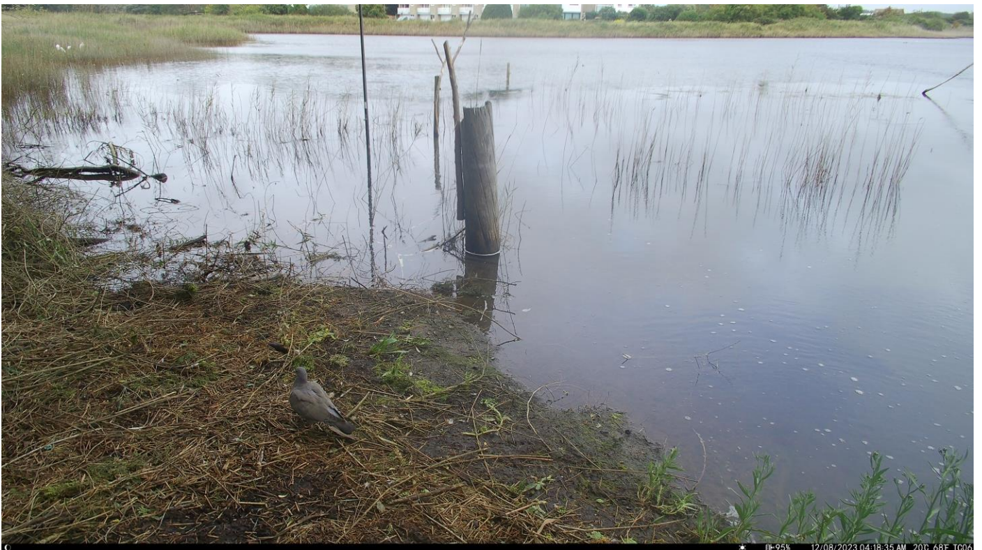
A much better view.