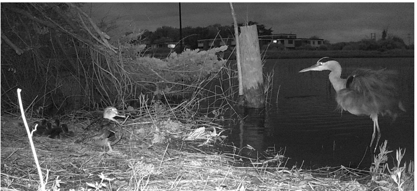
Mallard with her older Ducklings and a Grey Heron.