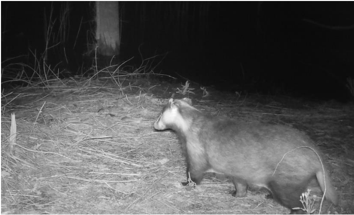
Badger 29 th August.