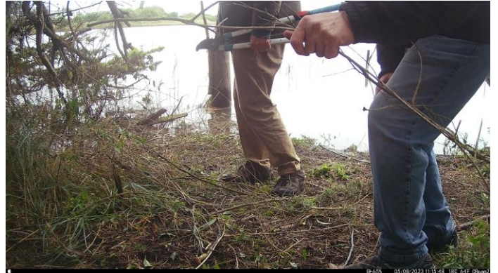
Clearing the brush and branches.