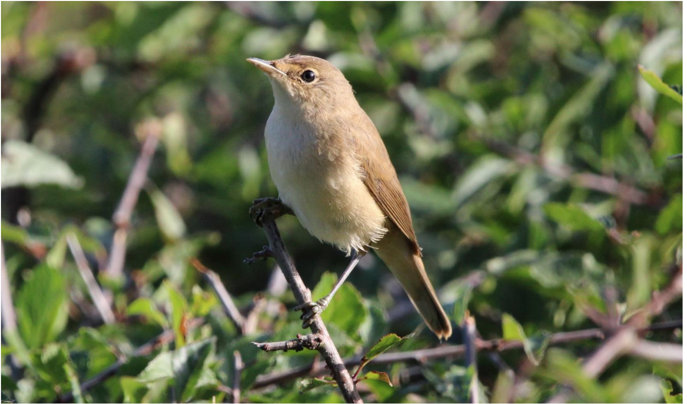
A juvenile Reed Warbler on the central hedge on the 9 th August.

Reed Warbler: They have been regularly recorded during the month.