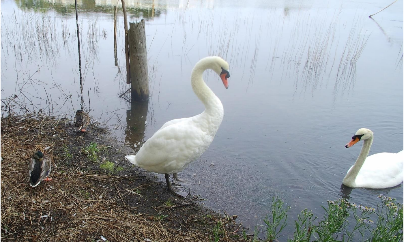
Mute Swan and Mallard.

Birds recorded: Blackbird, Black Headed Gull, Canada Goose, Coot, Grey Heron, Kingfisher, Little Egret, Little Grebe, Mallard, Mute Swan, Stock Dove and Wood Pigeon.