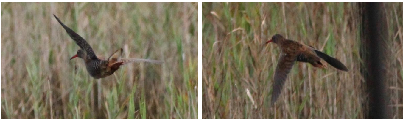
Water Rail flying over the Kingfisher Pool.

Water Rail: Heard on 6 occasions on the Avon Water side. One was seen from the Observatory on the 29 th as it flew over the Kingfisher Pool.