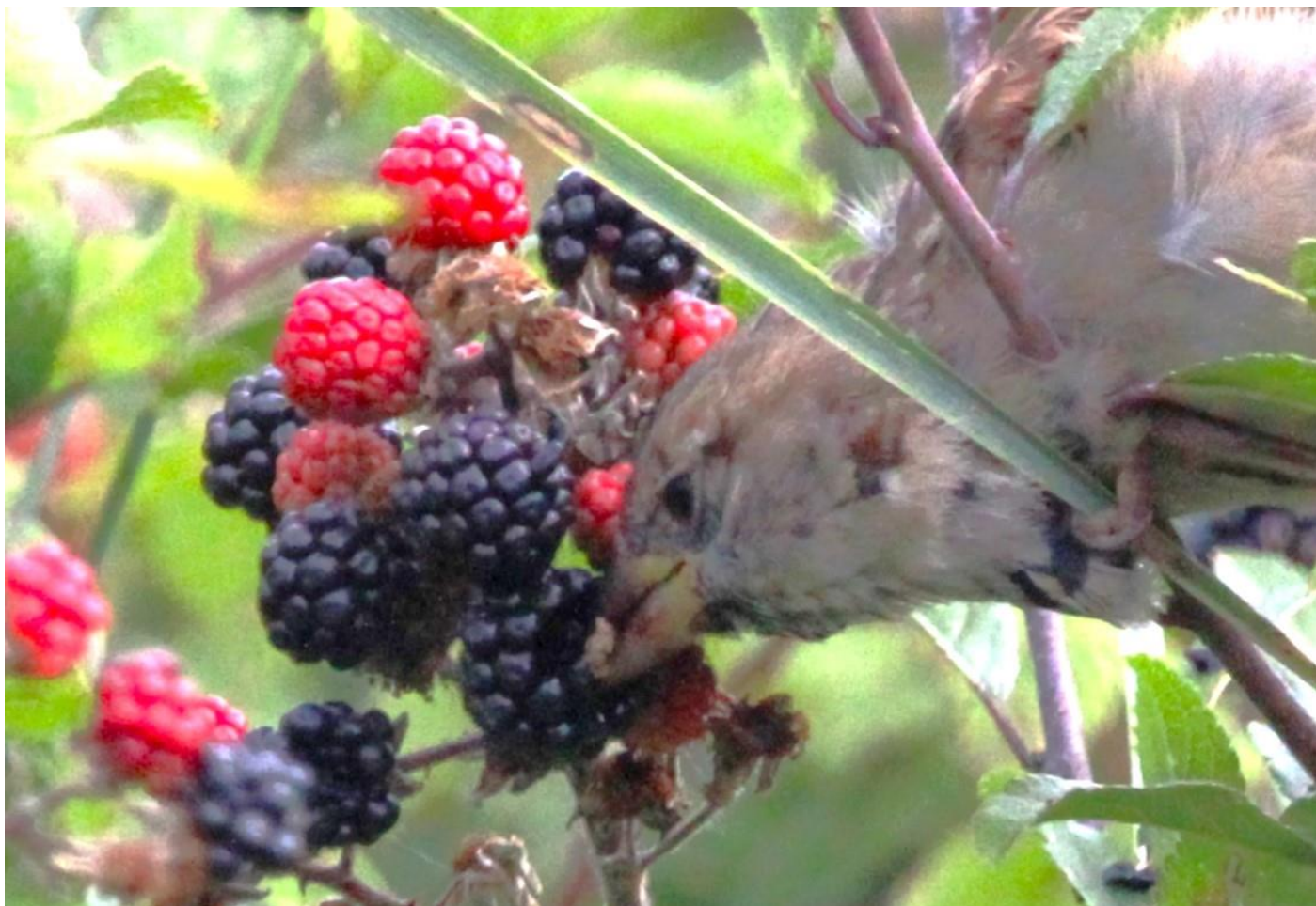
House Sparrow blackberry picking in the central hedge.

Jackdaw: Usually heard rather than being seen.