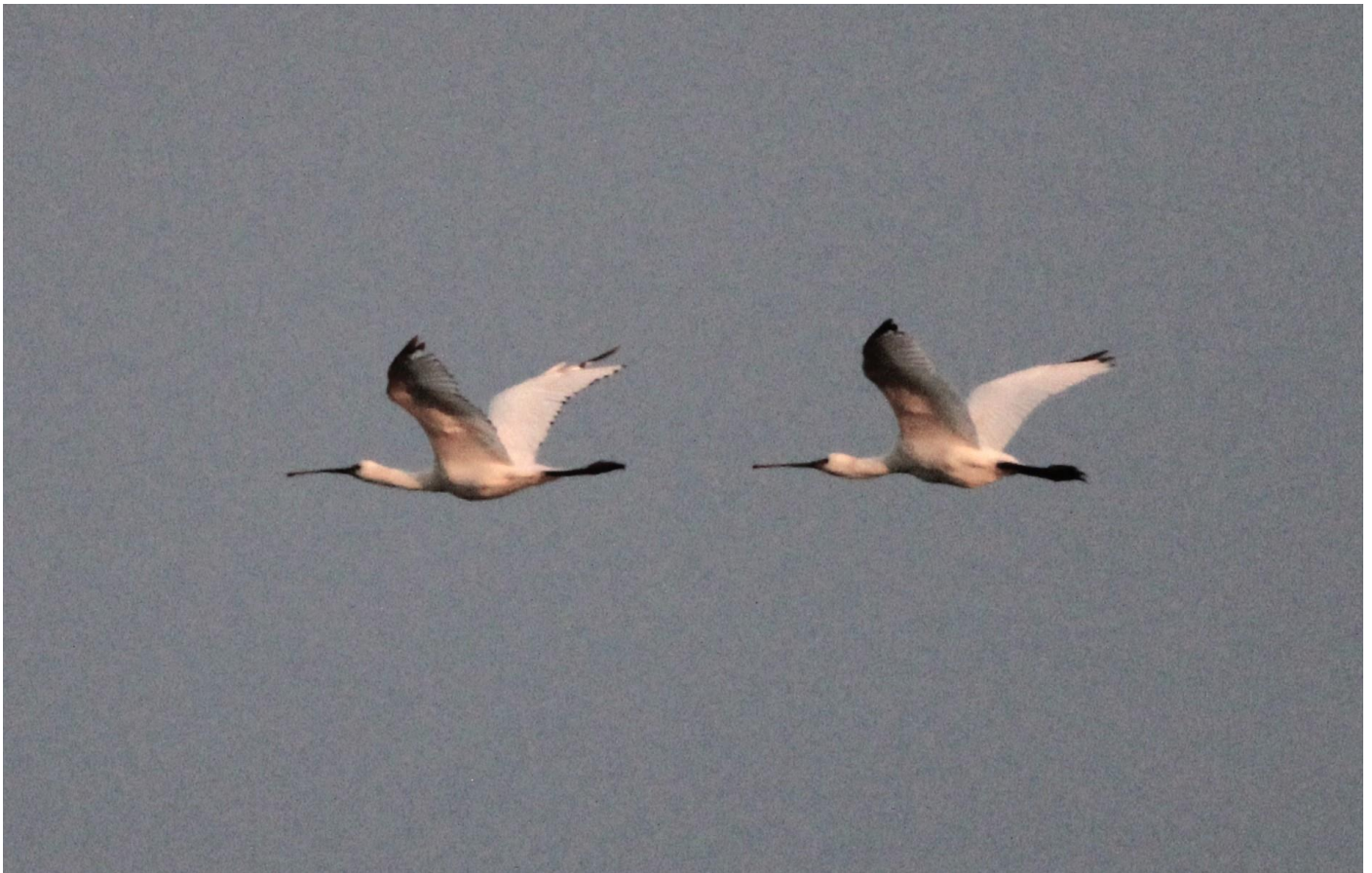
The two birds flying over the Pans on August 26 th , slightly pink due to the sunrise.

Spoonbill: Have been seen flying over the Pans on two occasions during August. Two birds on the 26 th and three on the 31 st .