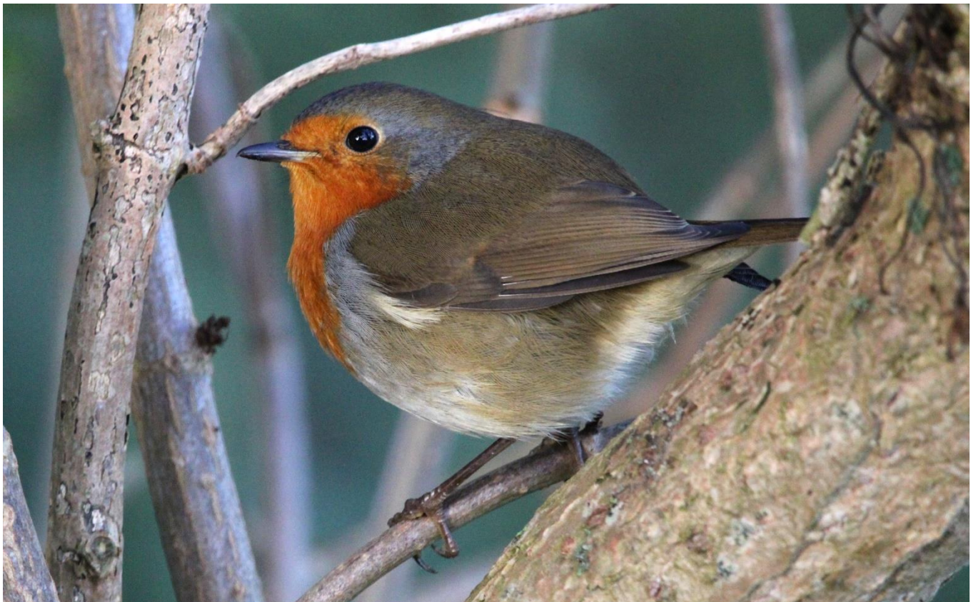
One of the two Robins in the Fir tree behind the Observatory.

Robin: One or sometimes 2 birds have been seen on 18 days during August.