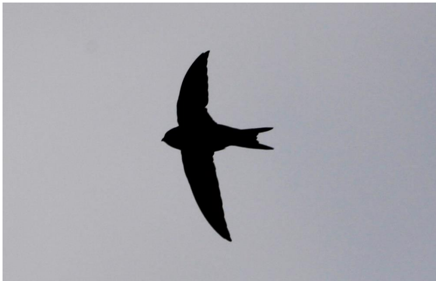
Swift in silhouette as it flew over the Observatory.

Swift: Were recorded on six days during August.