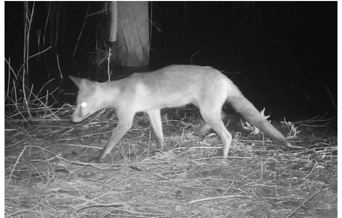
Fox 22 nd August.