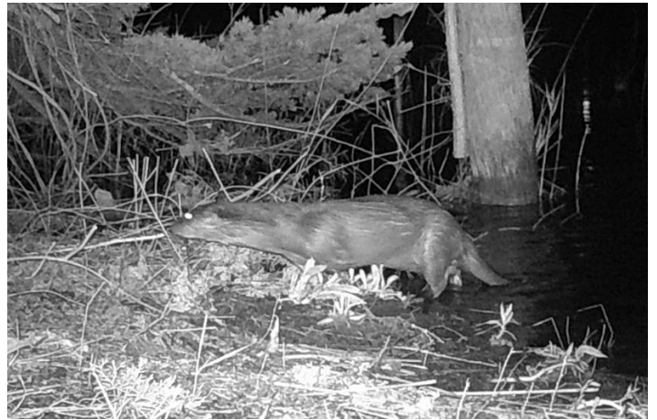
Otter 31 st August.

The 19 th August started as a peaceful morning, but things suddenly changed.