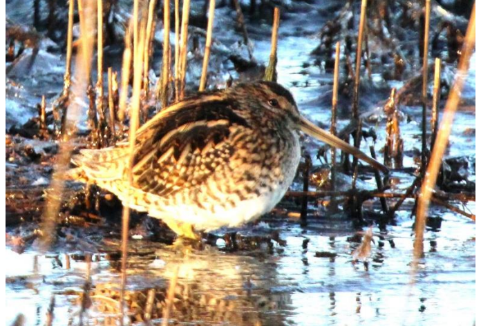
. Snipe near the Kingfisher Pool.