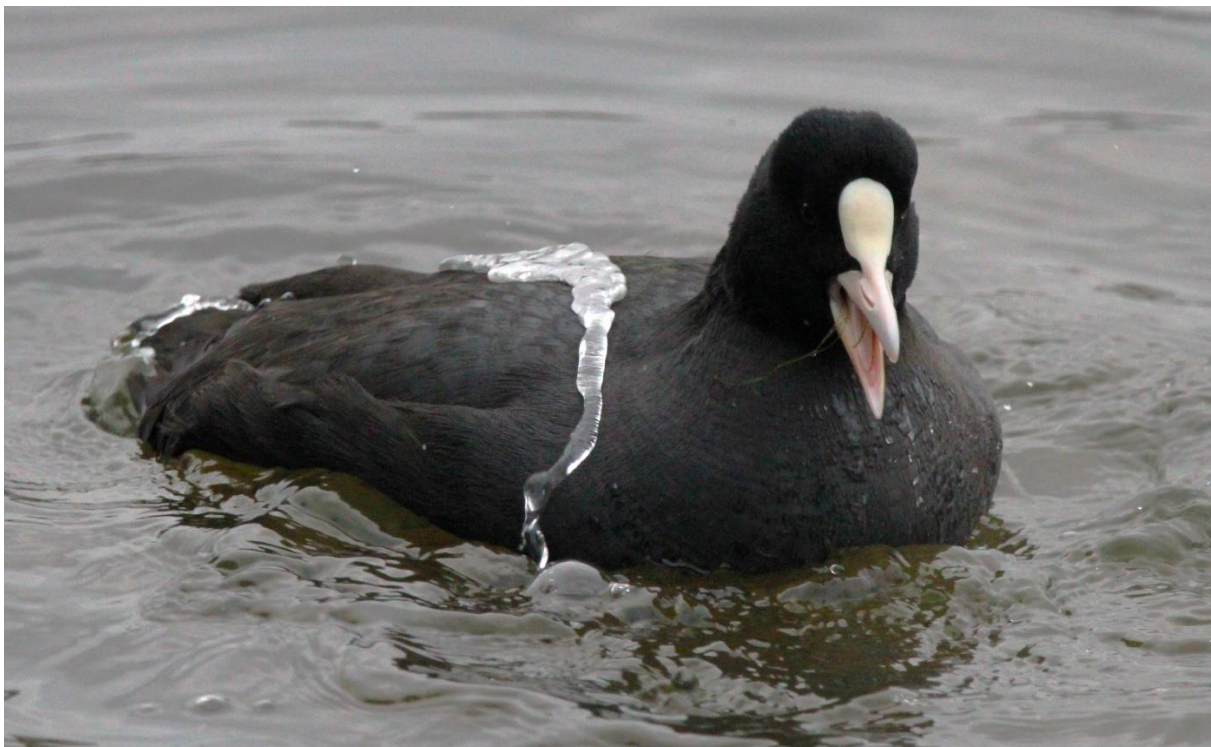
Water off a Coots back.

Coot: Large numbers were seen nearly every day of the month, with 93 recorded on the 30 th .