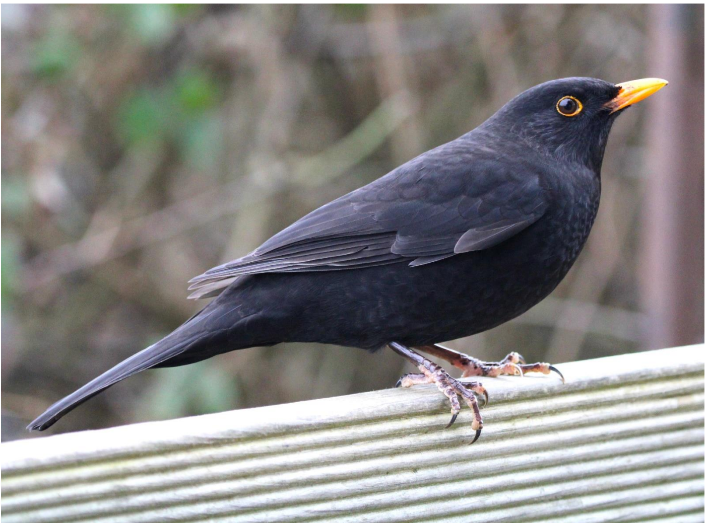
A male Blackbird on the Observatory fence.

Blackbird: Present most days of the month.