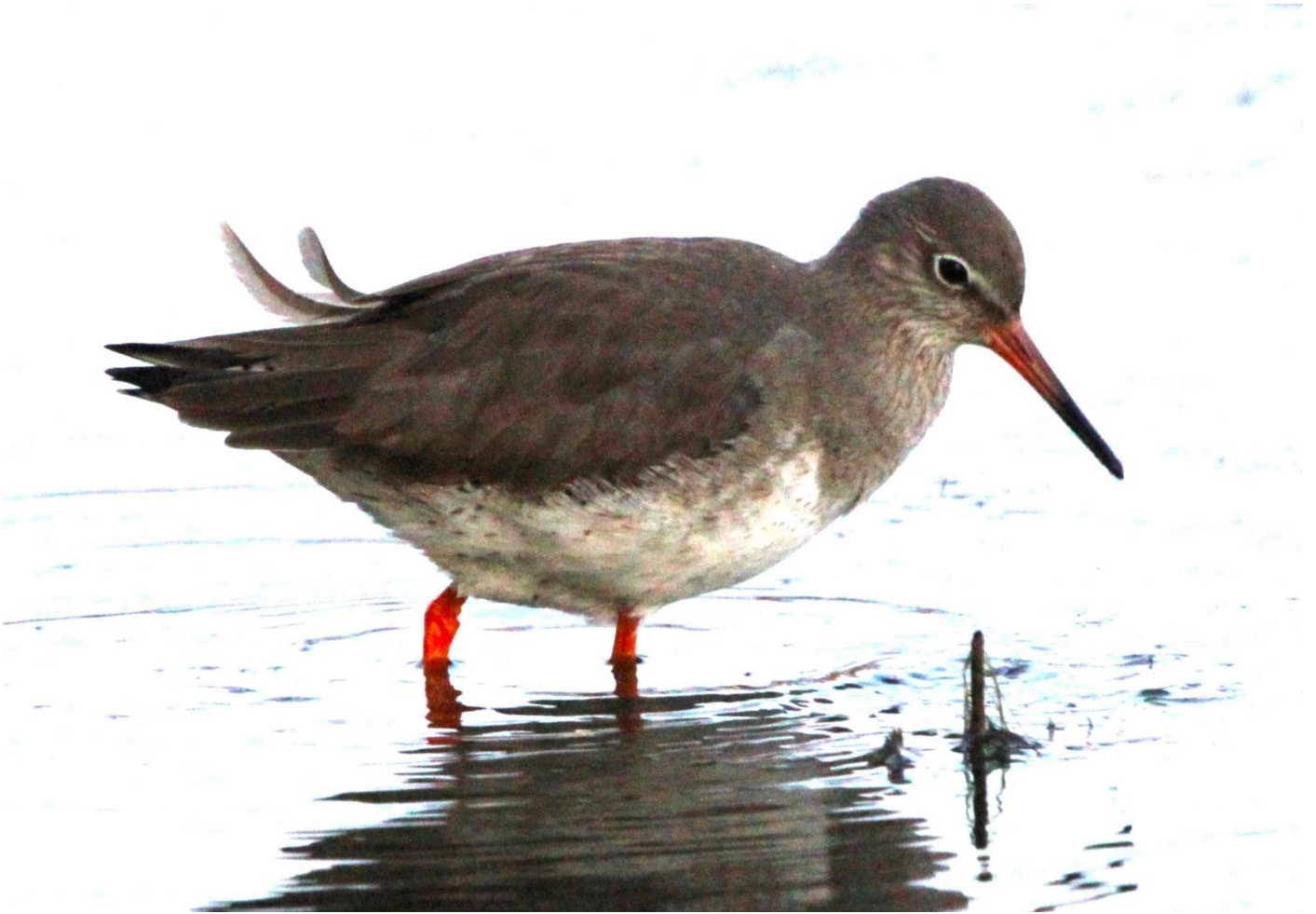
Redshank near the Observatory.

Redshank: Seen most days. 13 were recorded on the 12 th January.