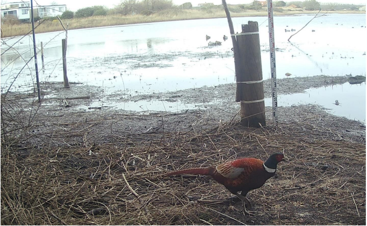
A Pheasant near the Kingfisher Pool.

Birds Recorded: Blackbird, Carrion Crow, Coot, Grey Heron, Herring Gull, Little Egret, Little Grebe, Mallard, Moorhen, Redshank, Robin, Pheasant, Water Rail and Woodpigeon.