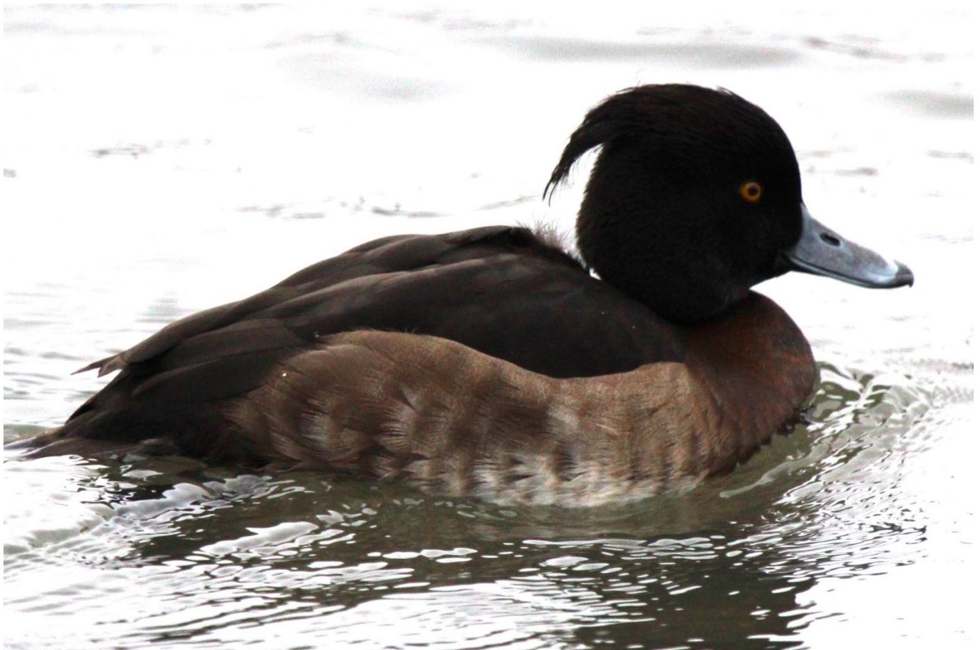
Tufted Duck close to the Observatory on the 21 st January.

Tufted Duck: 10 birds were present on the 6 th and 8 on the 7 th . A single bird was recorded on 14 other days during the month.