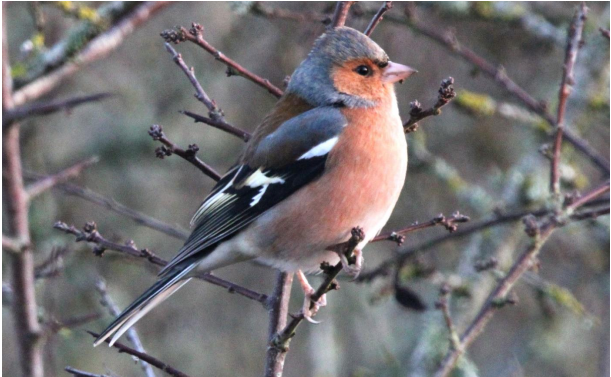
A male Chaffinch on the central hedge.

Chaffinch: Seen on 5 days during the month.