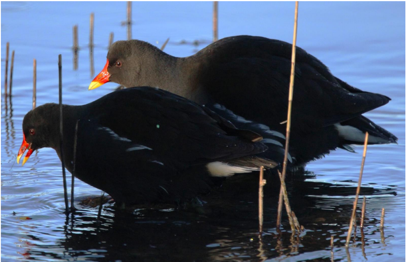
A pair can be seen most days.

Moorhen: These have been seen most days on Avon Water and the Pans. Three have been seen on the 10 th , 11 th , 22 nd and 30 th January.