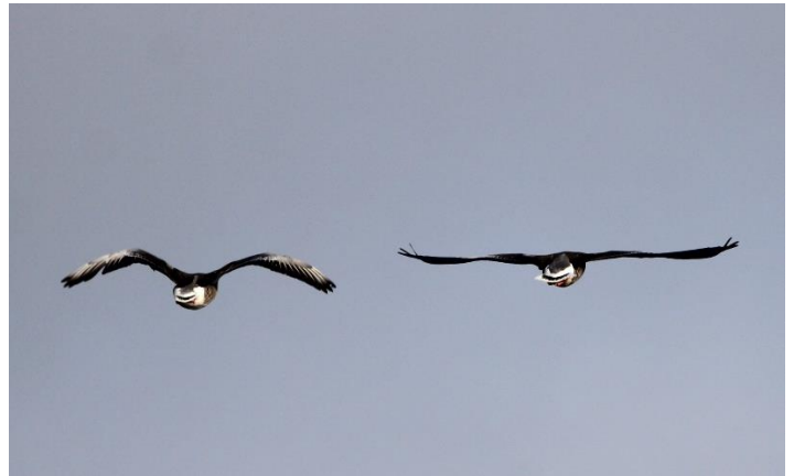
Greylag goose flying over the Pans.

Herring Gull: Recorded most days. As the water level is so high, the gulls have to take the crabs onto one of the house roofs in Harewood Green so that they can break open the crab shell.