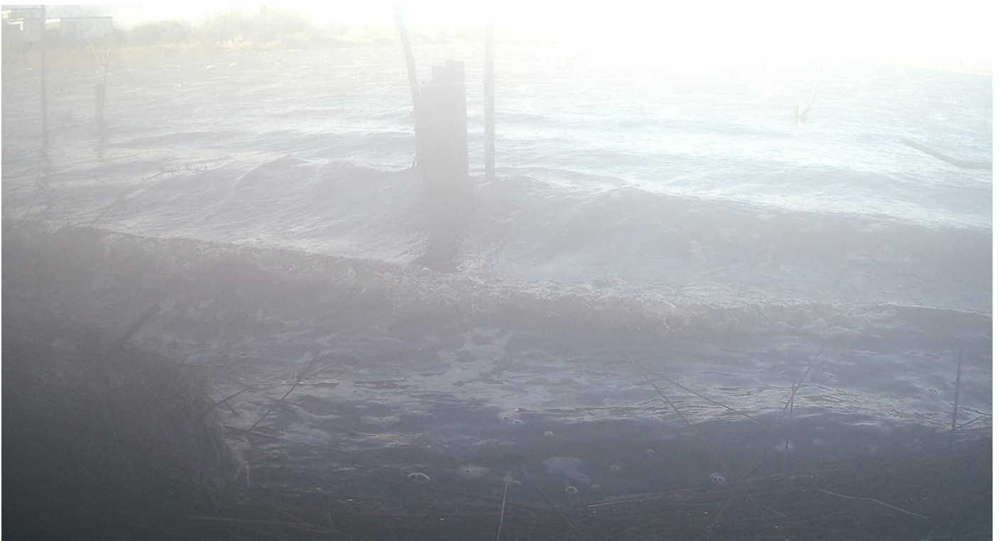
As you can see the waves are quite high.

As a stark comparison the photo below was taken on the 26 th February during a stormy night.