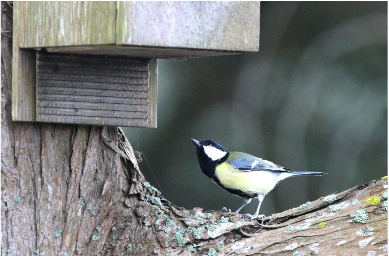
A Great Tit checking out the Bat Box, (probably looking for insects).

Greenshank: 2 birds were present on the 3 occasions, the 2 nd , 4 th , and 5 th . A single bird was recorded on the 3 rd , 6 th and the 20 th .