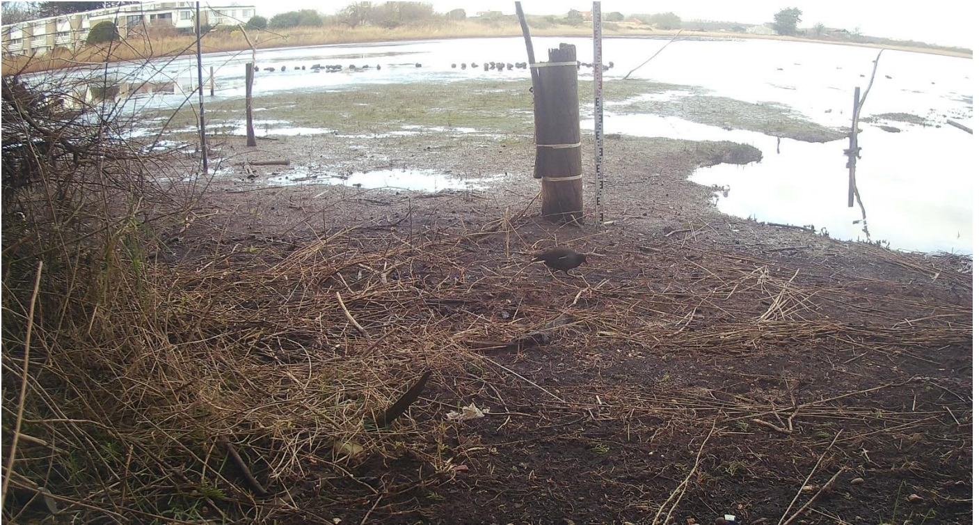
A Moorhen on the Pans on the 1 st February.

Birds recorded: Blackbird, Coot, Little Egret, Little Grebe, Moorhen, Mute Swan, Pheasant, Redshank, Water Rail and Woodpigeon.