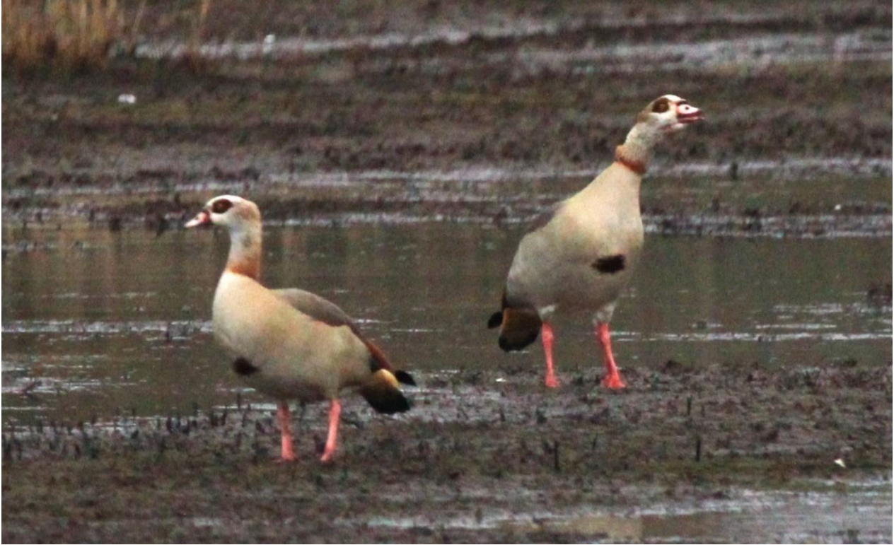
The two Egyptian Geese on the 5 th February.

Egyptian Goose: 2 birds were seen on the Pans on the 5 th . One was seen flying over on the 10 th and 2 flying over on the 11 th .