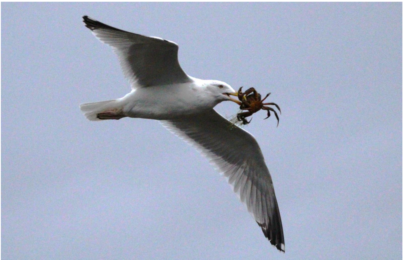
A Herring Gull carrying off a shore Crab.

Herring Gull: Recorded most days. As the water level is so high, the gulls have to take the crabs onto one of the house roofs in Harewood Green so that they can break open the crab shell.