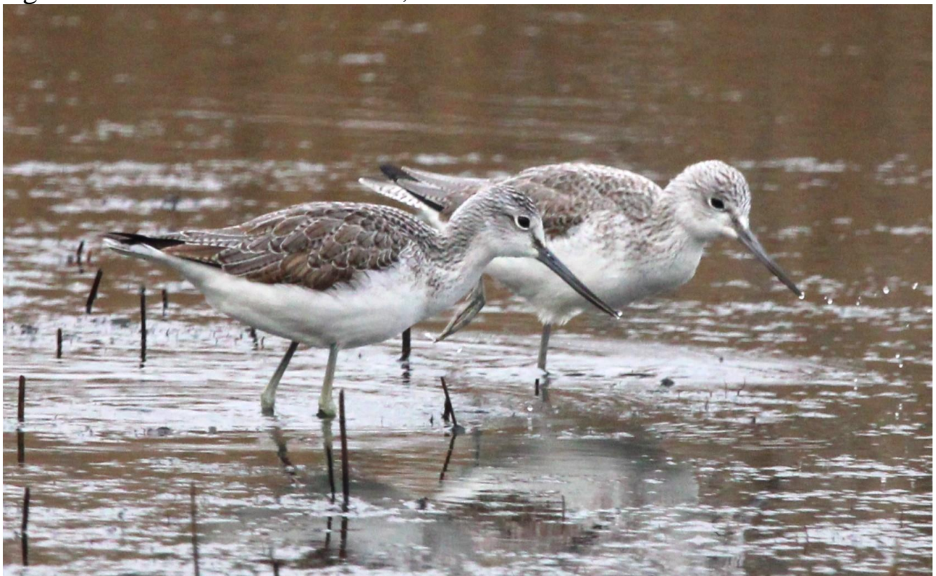
Two Greenshank near the Observatory on the 2 nd February.

Greenshank: 2 birds were present on the 3 occasions, the 2 nd , 4 th , and 5 th . A single bird was recorded on the 3 rd , 6 th and the 20 th .