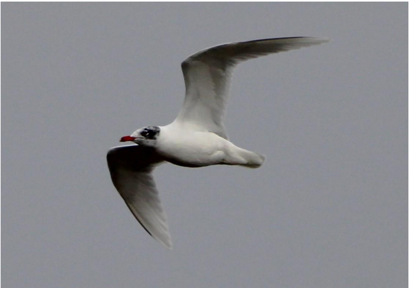
A Mediterranean Gull flying over the Pans.

Mediterranean Gull: A single bird was seen and heard flying over the site on the 19 th February and one bird was seen amongst a flock of Black Headed Gulls on the 21 st .