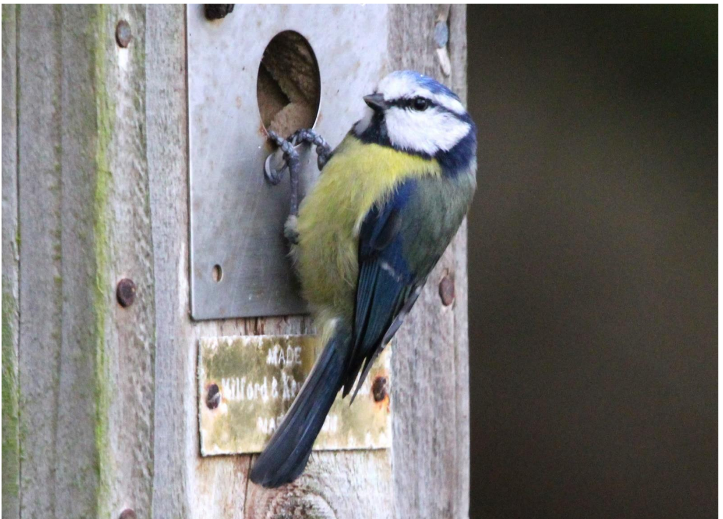
A Blue Tit checking out one of the nest boxes.

Blue Tit: Recorded every day. One has been seen checking out one of the nest boxes. Photo below.