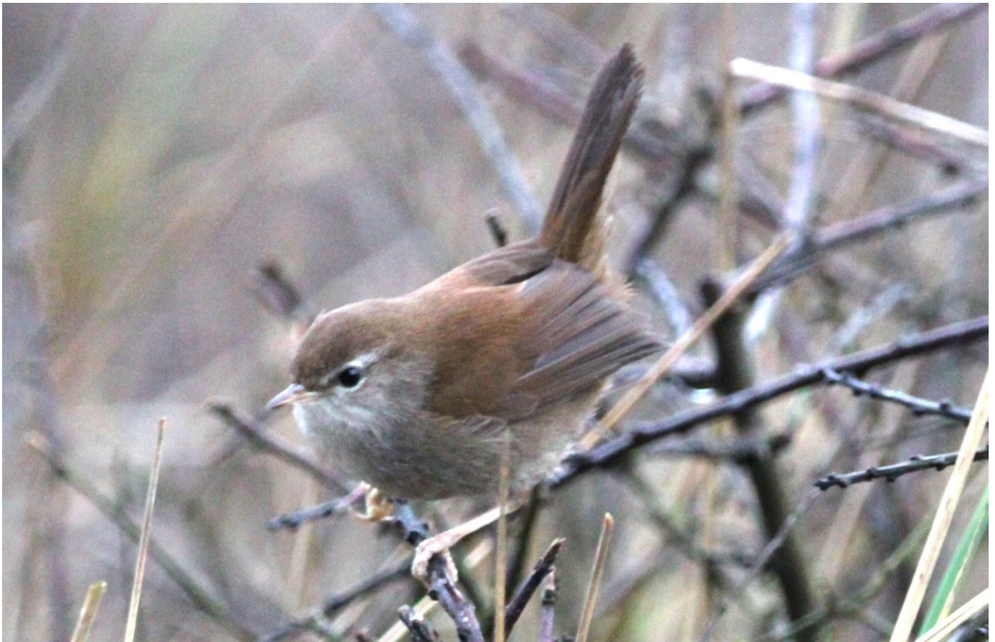
Cetti's Warbler on the left-hand hedge on the 6 th February.

Cetti's Warbler: Recorded on 13 days during the month.