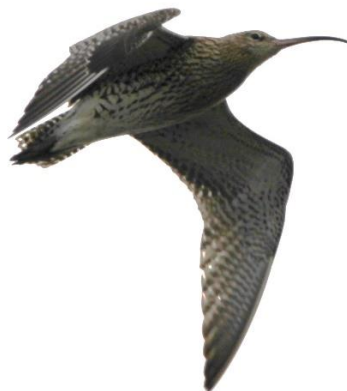
A juvenile Curlew flying over the Pans (they have a shorter bill than an adult).

Curlew: Recorded most days. 10 present on the 3 rd and 4 th .