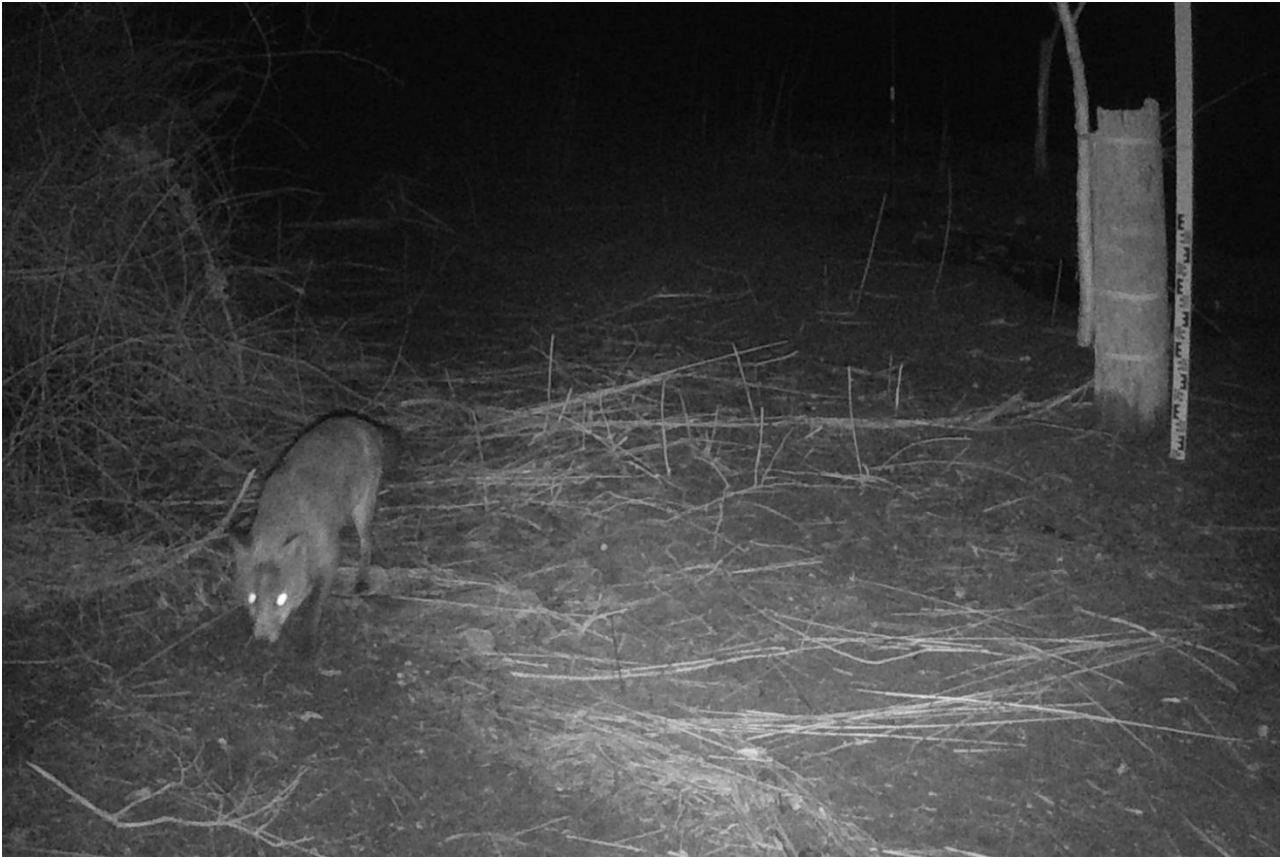
A fox photographed on 6 th February.

The Rats were frequently photographed day or night during the month.