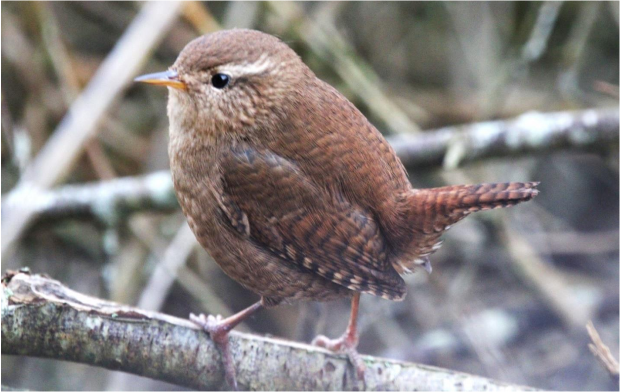
Wren on the left-hand hedge.