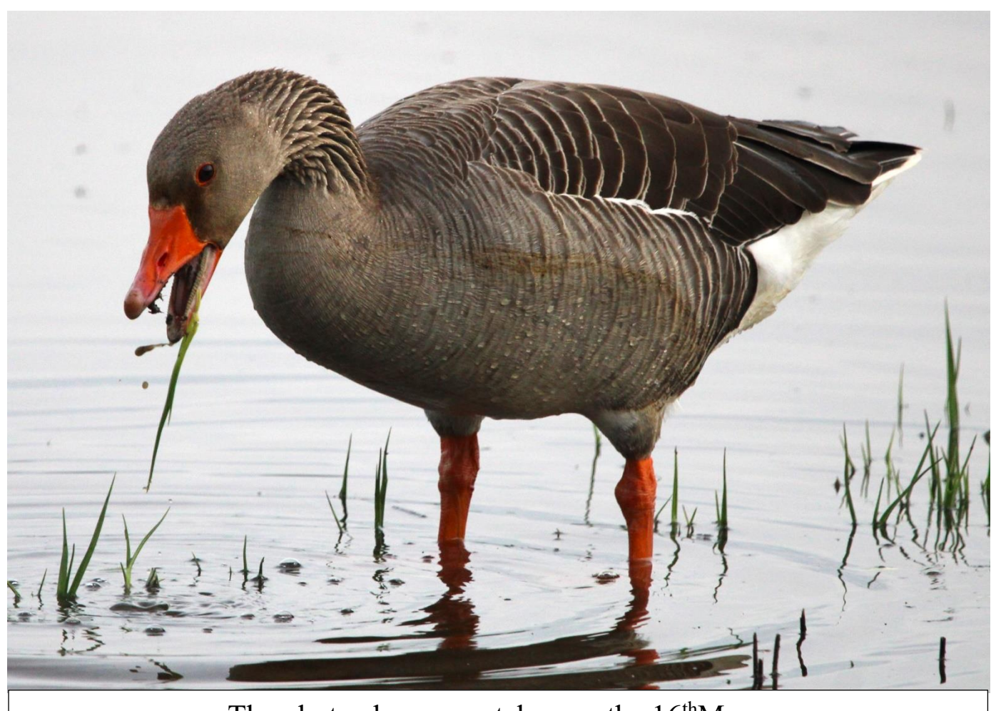
The photo above was taken on the 16<sup>th</sup>May.