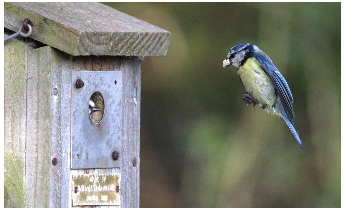
An adult Blue Tit taking food to the chicks waiting in the nest box.

Blue Tit: The adults were very busy feeding the young until the chicks fledged (roughly at 08.37) on the 16<sup>th</sup>May.