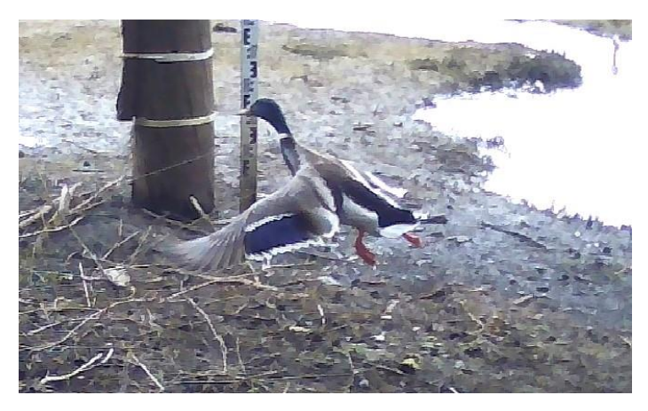
Mallard taking off.

Birds recorded: Blackbird, Black Headed Gull, Carrion Crow, Little Egret, Collared dove, Mallard, adults and ducklings, Moorhen plus 2 chicks, Pheasant, Shelduck and Woodpigeon.