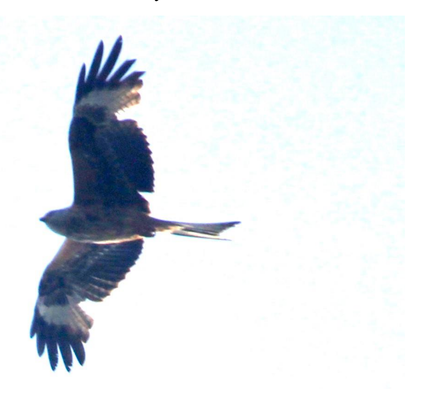
A record shot of a Red Kite flying over the Observatory.

Red Kite: One flew over the Observatory on the 7<sup>th</sup>.