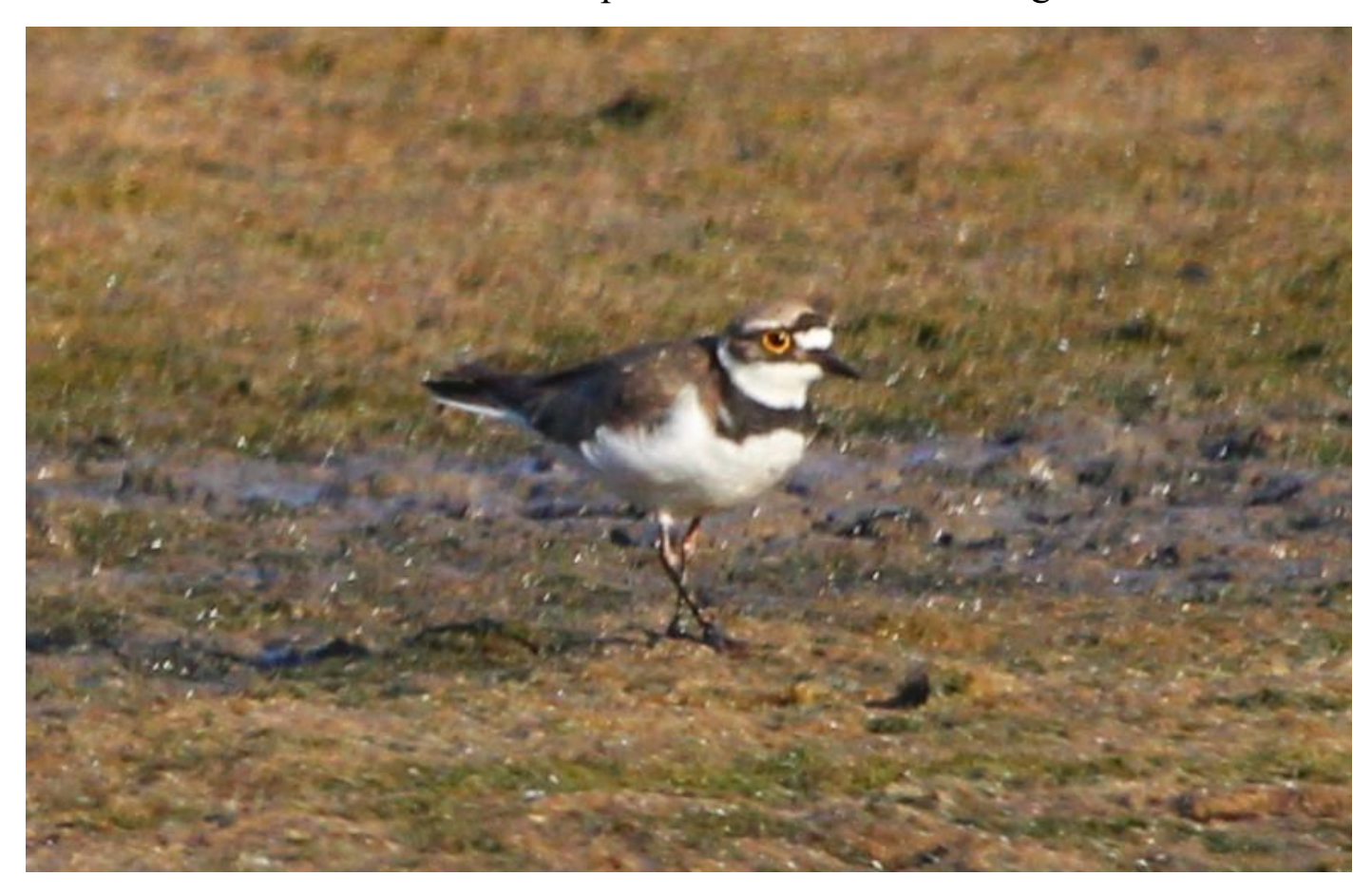
Mallard: There have been four families of Mallards on the Pans.

Little Ringed Plover: Recorded on 2 days during May. 1 bird on the 25<sup>th</sup> and 2 birds on the 27<sup>th</sup>. The photo below shows the single bird on the 25<sup>th</sup>.