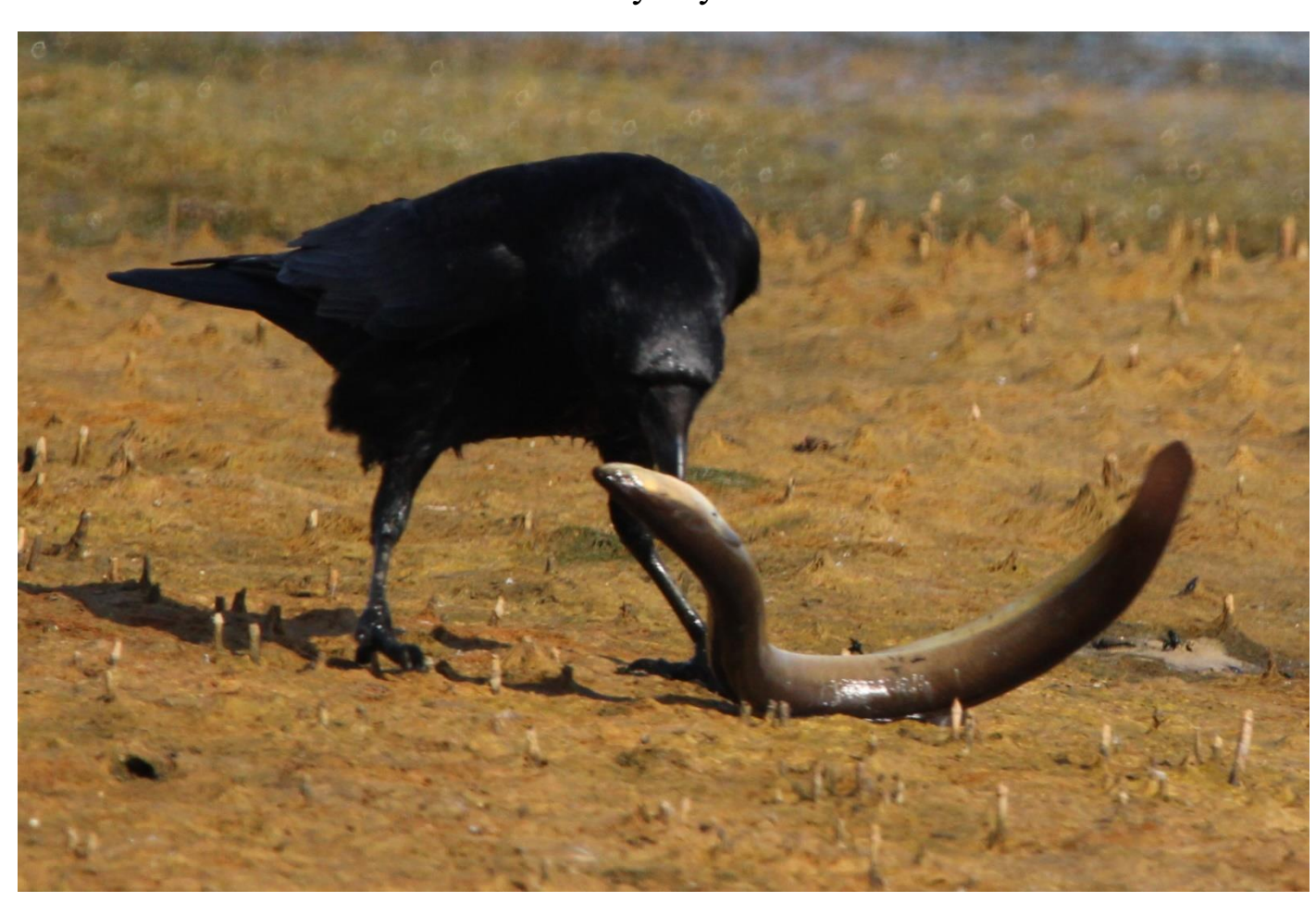
A Carrion Crow with an Eel.

Cetti's: Seen or heard every day of the month.