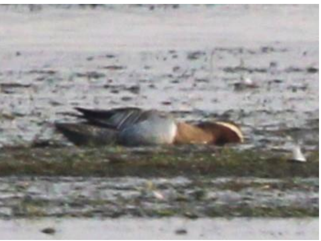
Distant photos of the Garganey.