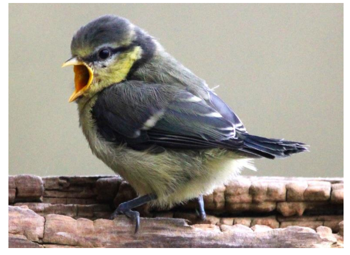
. One of the Blue Tit chicks about to fledge.