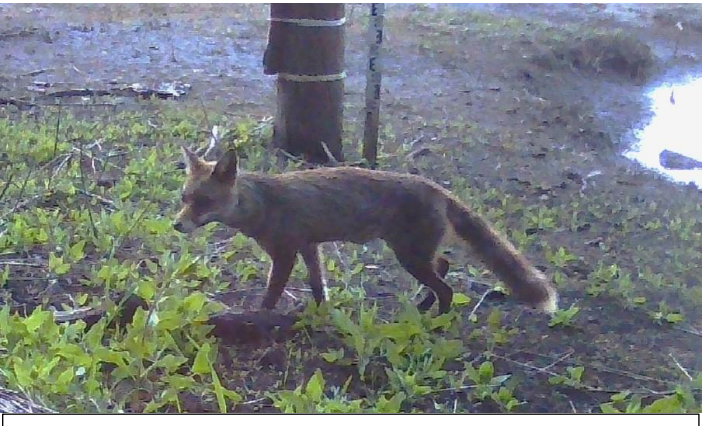
A Fox was photographed on 10 occasions during the month.