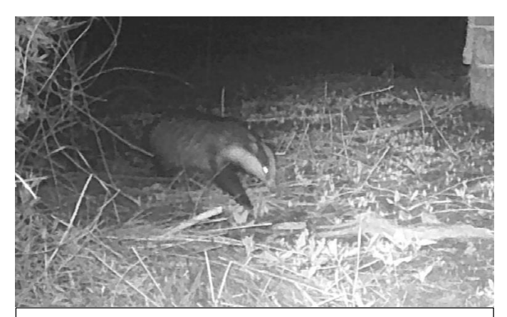
A Badger was photographed on the 18<sup>th</sup>and 27<sup>th</sup>.