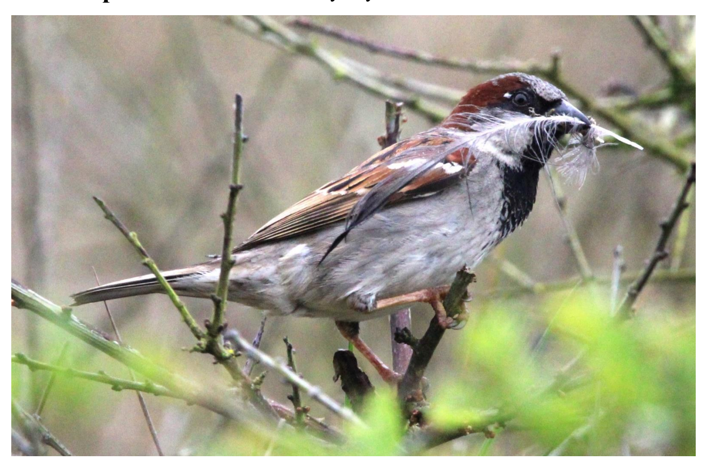
House Sparrow with a feather.

Little Egret: Seen every day, the highest number recorded was 22 on the 25<sup>th</sup>.