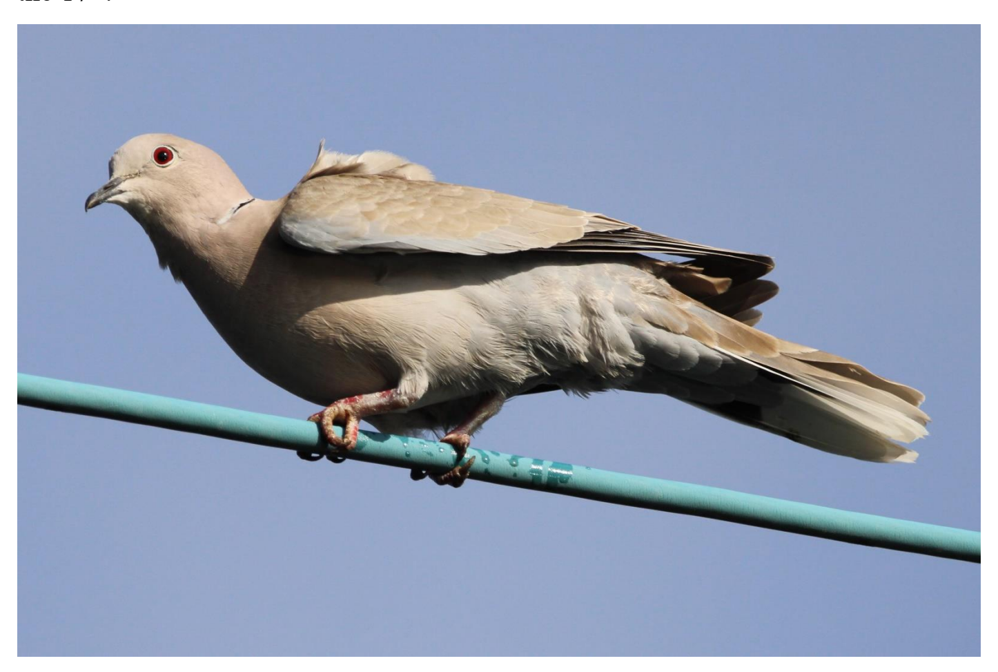
A Collared Dove on one of the wires.

Collared Dove: Seen on 19 days during the month with 7 recorded on the 17<sup>th</sup>.