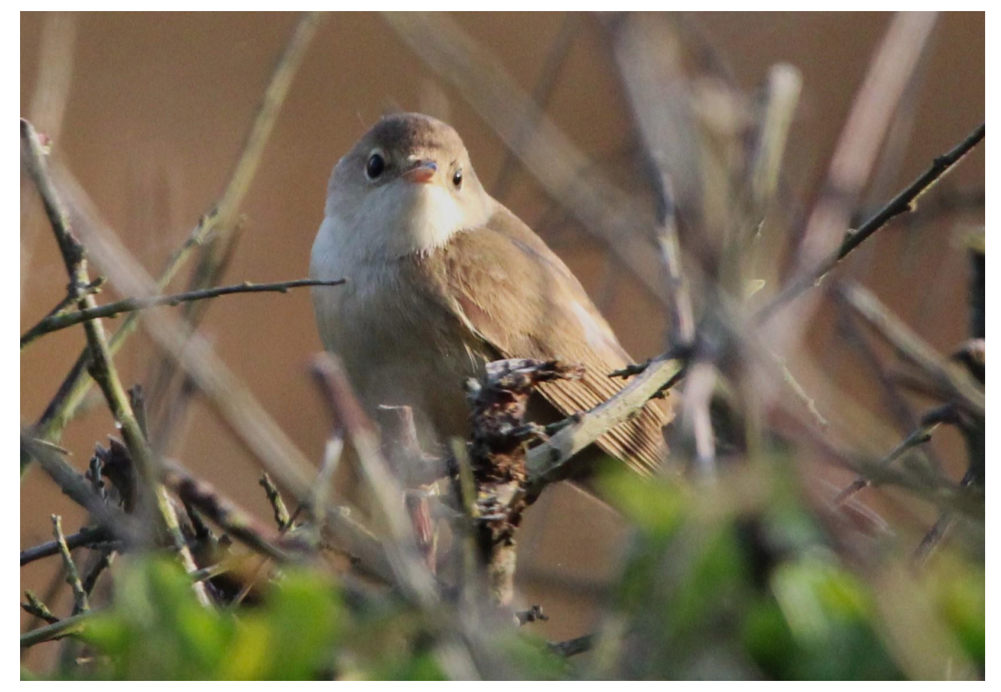
A Whitethroat on the left-hand hedge.

Whitethroat: One was seen on the 11<sup>th</sup>May.