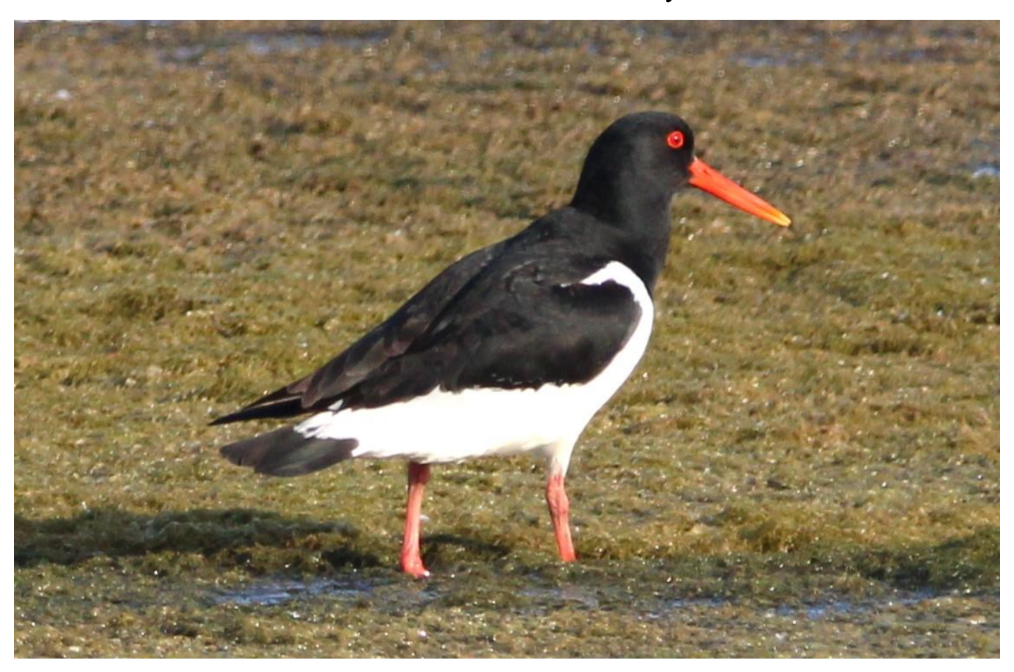
Oystercatcher near the Observatory on the 10<sup>th</sup>May.

Oystercatcher: Seen nearly every day of the month. The highest number recorded was 3 on the first and seventh of May.