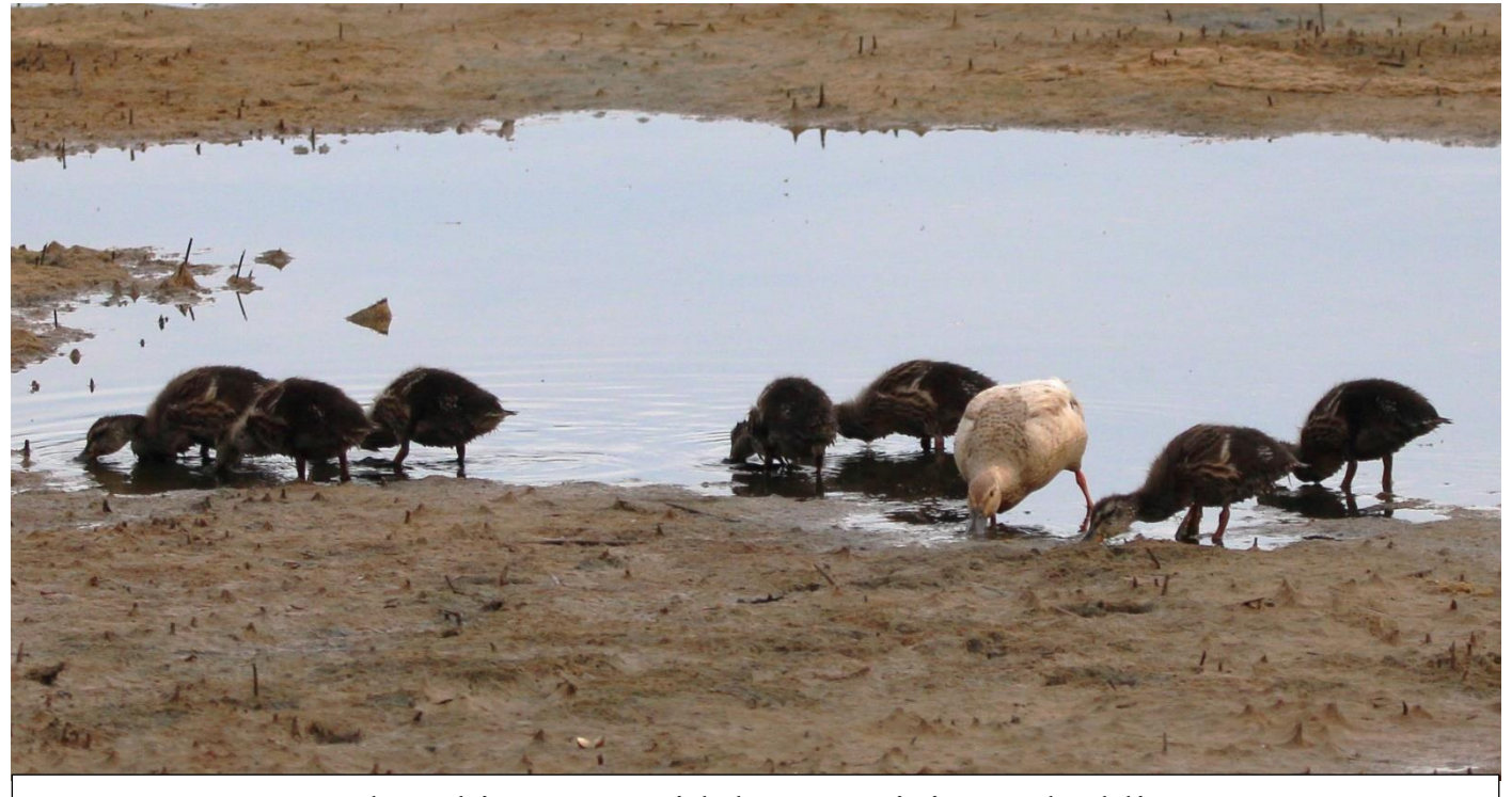
The white mum with her remaining 7 ducklings.

1 pair with 10 ducklings, a 2<sup>nd</sup> pair (white mum) with 10 ducklings, (now down to 7 ducklings) 1 pair with 3 ducklings and the fourth pair had 7 ducklings.