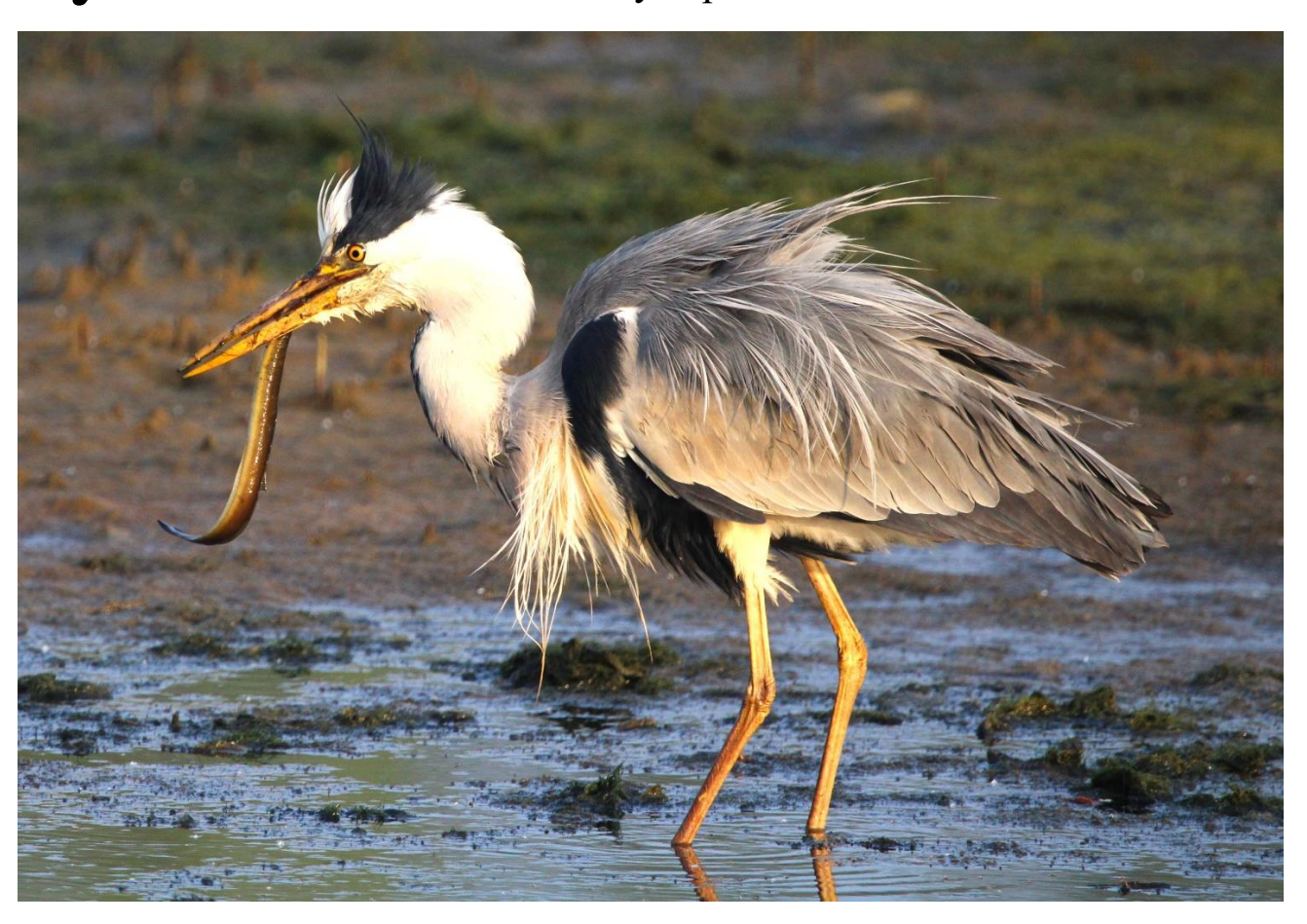
Greylag Goose: Recorded on 23 days.