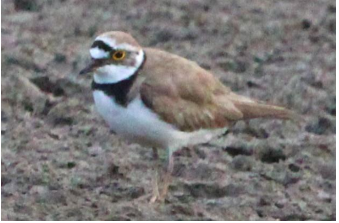
Two of the three Little Ringed Plovers seen at the Pans this month.

Marsh Harrier: Recorded on 21 days during the month.