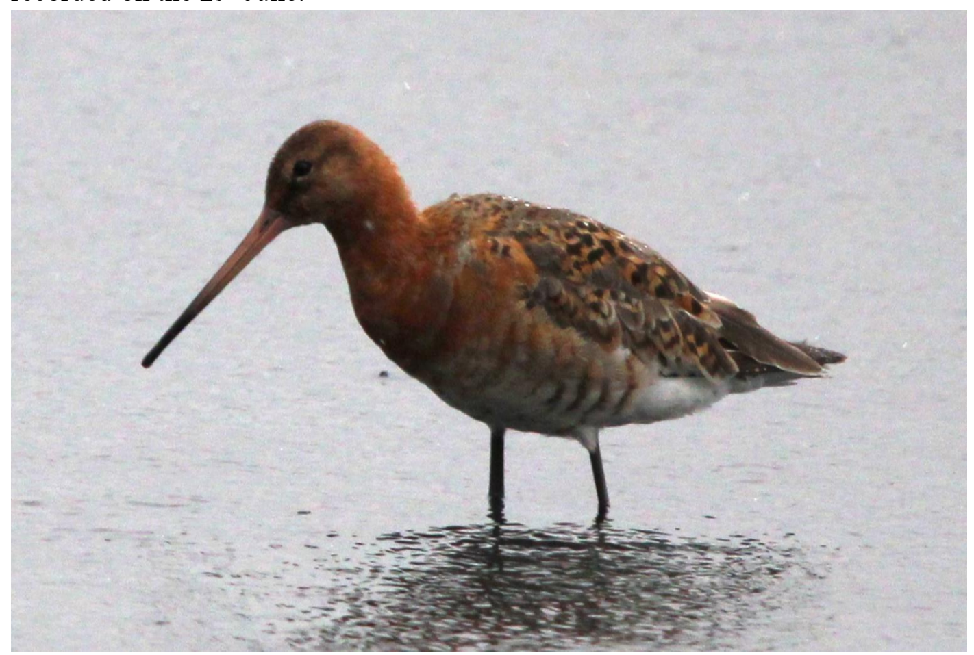
Black Tailed Godwit near the Observatory on the 15<sup>th</sup>June.

Black Tailed Godwit: Present every day of the month. 118 were recorded on the 29<sup>th</sup>June.