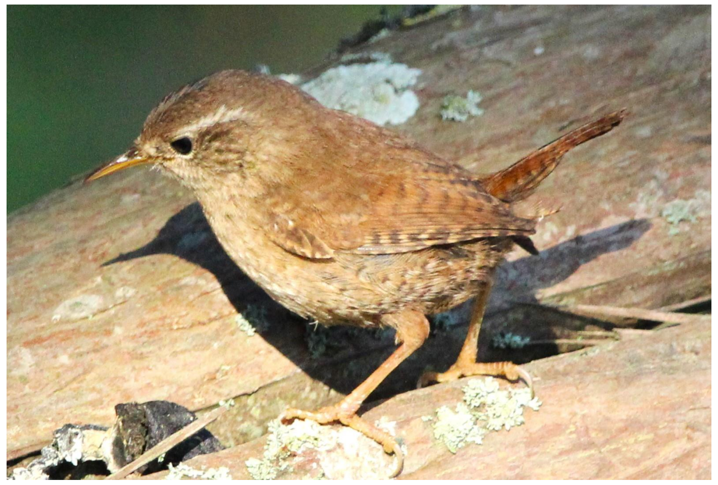
An adult wren searching for insects.

Wren: A pair bred on the Pans and were very busy collecting insects for their young during the month.