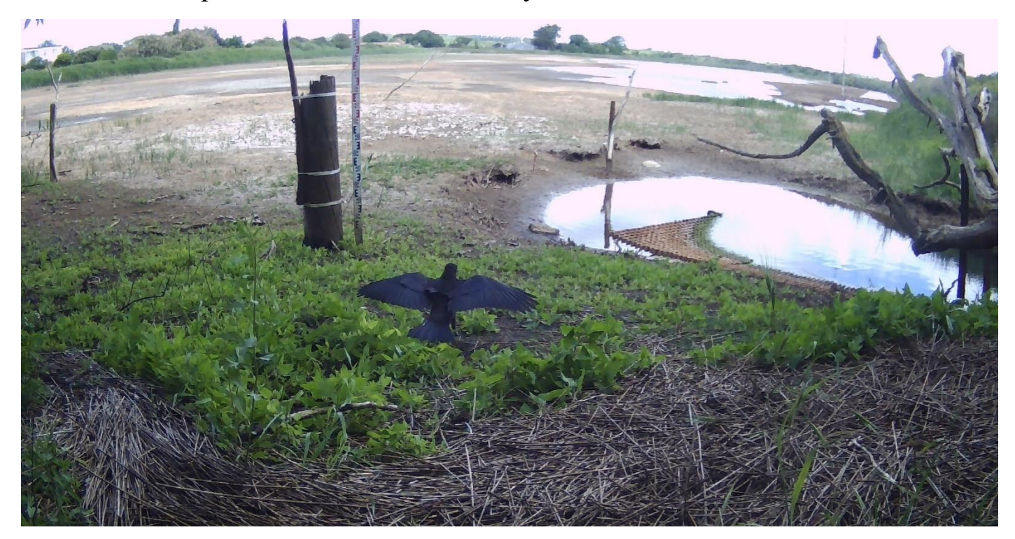
A Carrion Crow photo – bombing the Pans trail camera photo. A misty sunrise at the Pans.