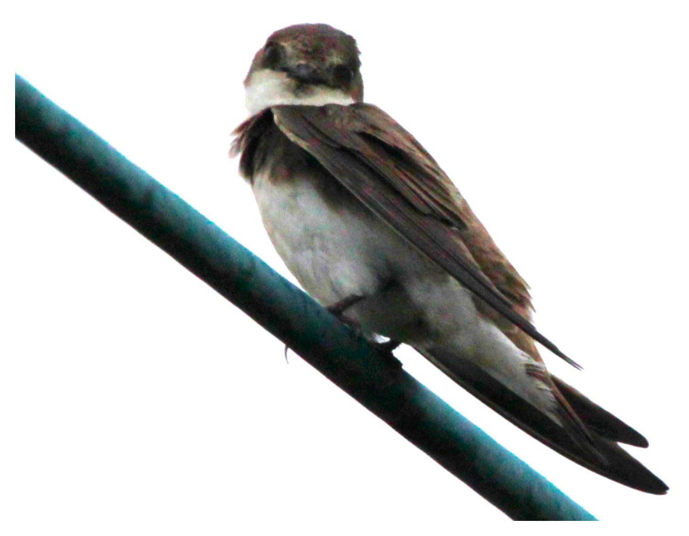
Sand Martin on the wire near the Observatory.

Sand Martin: Seen flying around the Pans on 8 days during the month. Luckily one landed on the wire close to the Observatory.