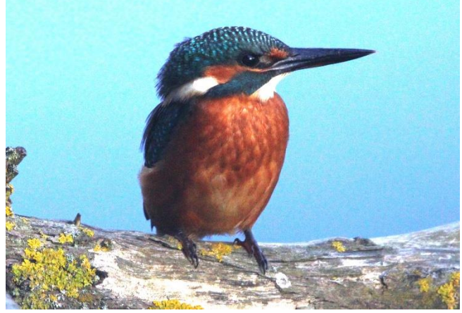
The photo above shows a Juvenile female.