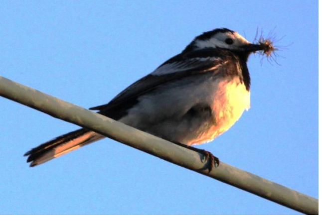
A young Pied Wagtail.