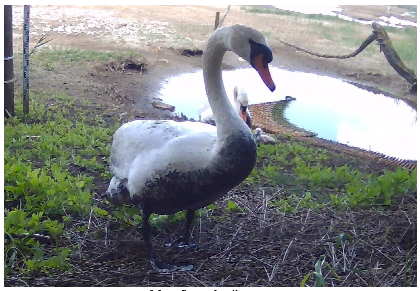
Mute Swan family.

Birds recorded: Blackbird, Black Headed Gull, Carrion Crow, Chaffinch, Little Egret, Magpie, Mallard, Pheasant and Woodpigeon.