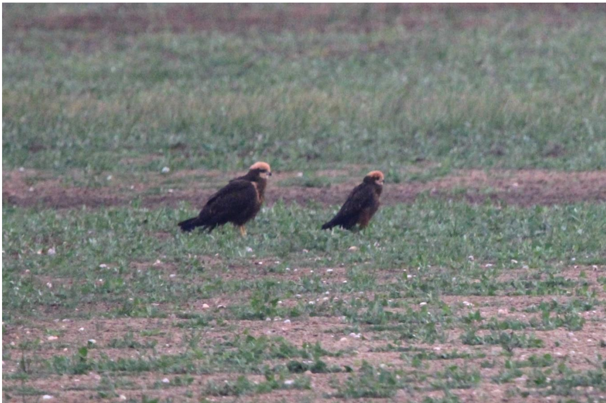
The 2 juvenile Marsh Harriers.

Marsh Harrier: 2 Juvenile Marsh Harriers have been seen on 5 occasions since the 15 th July. Photo below.