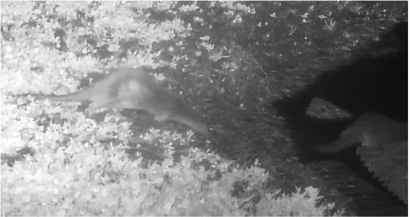
Two Otters, one going under the grid.