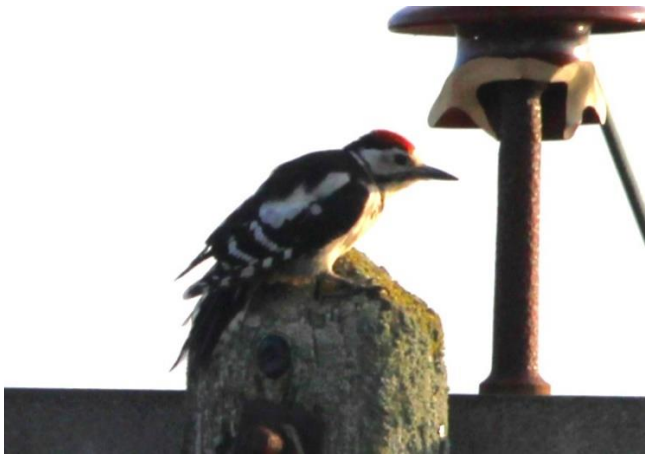
Great Spotted Woodpecker.

Great Spotted Woodpecker: Recorded on 4 days during July.