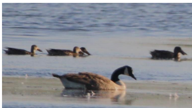
Distant photos of the Shovelers.

Spoonbill: One has been seen on 4 occasions. Photo below.