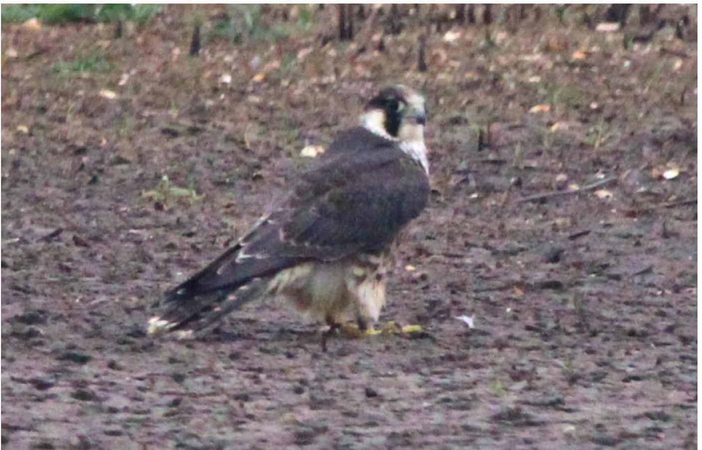
The juvenile Peregrine Falcon.

Peregrine Falcon: A juvenile Peregrine falcon has been seen at the Pans on three occasions, the 15 th , 16 th and the 20 th .