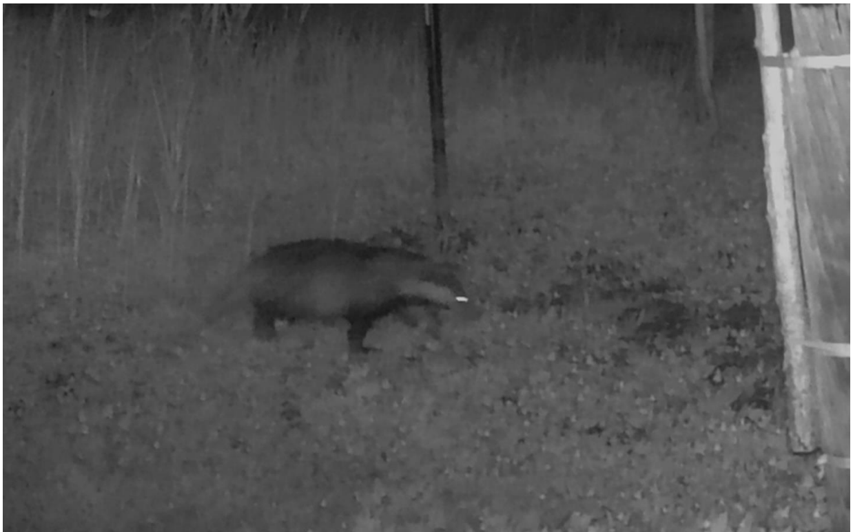
A Badger near the Observatory on the 8 th July.

A Badger was Recorded Twice. 8 th and 18 th July.