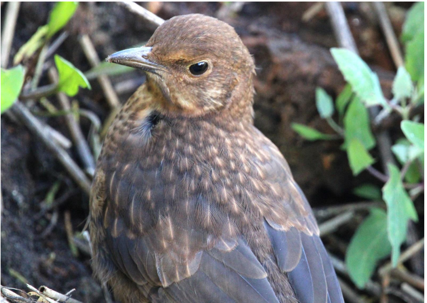
A juvenile Blackbird.

Blackbird: Was seen on 16 days during the month.