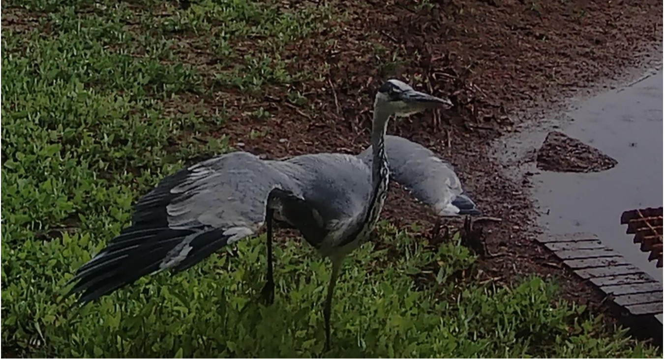
Grey Heron by the Kingfisher Pool.

Birds Recorded: Black Headed Gull, Carrion Crow, Grey Heron, Little Egret, Mallard and Woodpigeon.