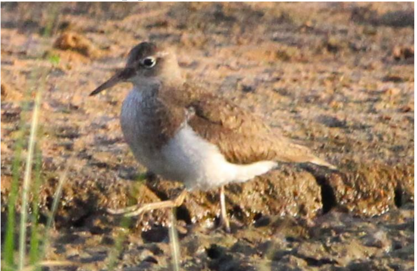
A Common Sandpiper near the Observatory.

Common Sandpiper: Recorded on 7 days during the month.