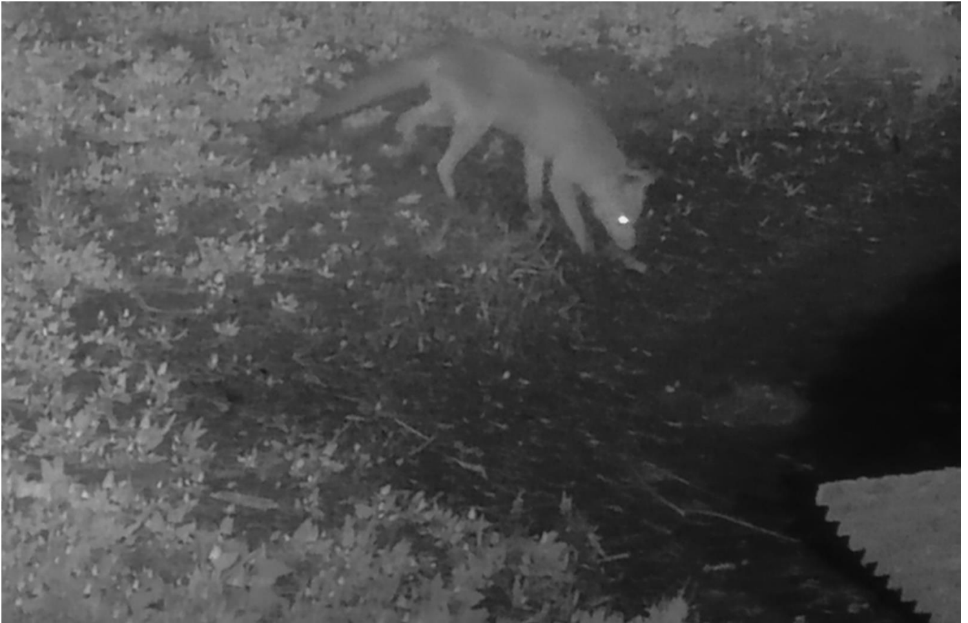
A Fox checking out the grid.

Fox were recorded on 13 separate days. The photo below was taken on the 2 nd .