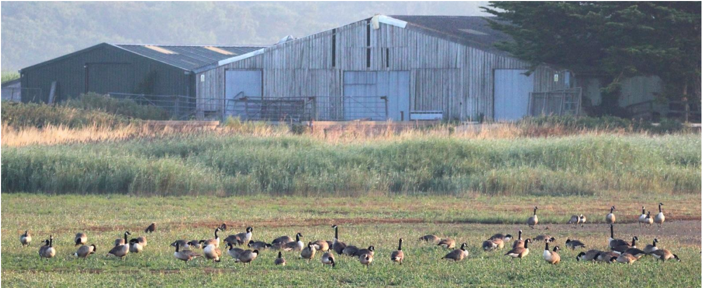
Canada Geese at the Pans (Can you spot the 2 juvenile Marsh Harriers).

Canada Geese: After the 17 th July the numbers started to increase. 268 were recorded on the 28 th July.