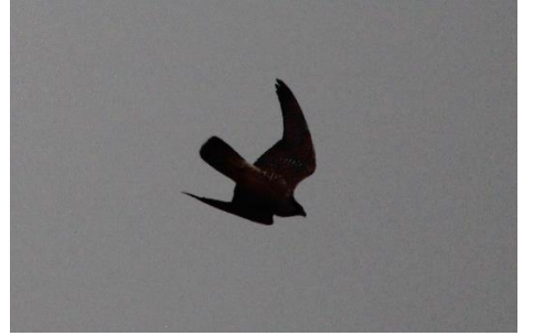
Ruff: A Ruff was seen at the Pans on the 10 th July.