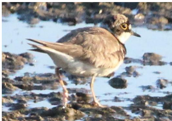
Little ringed Plover near the Observatory.

2 Little Ringed Plover were seen to be mating during June and later sitting on a scrape. Unfortunately, nothing became of it, possibly because of the various predators on the site.