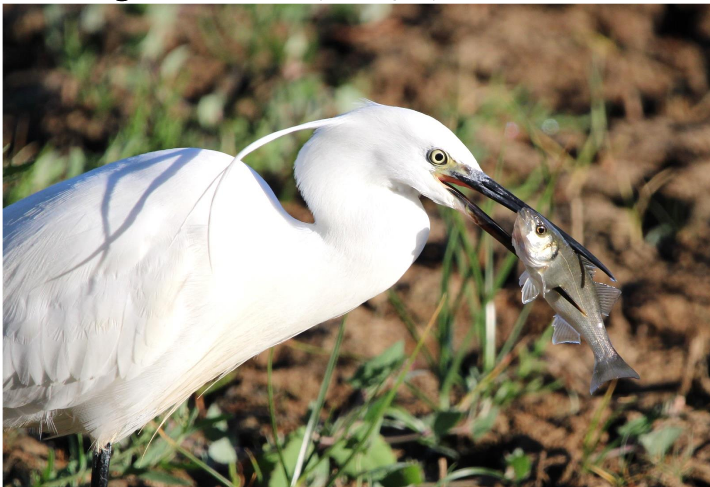
A Little Egret with breakfast.

Little Egret: Seen on 16 days during July. 26 were recorded on the 16 th .