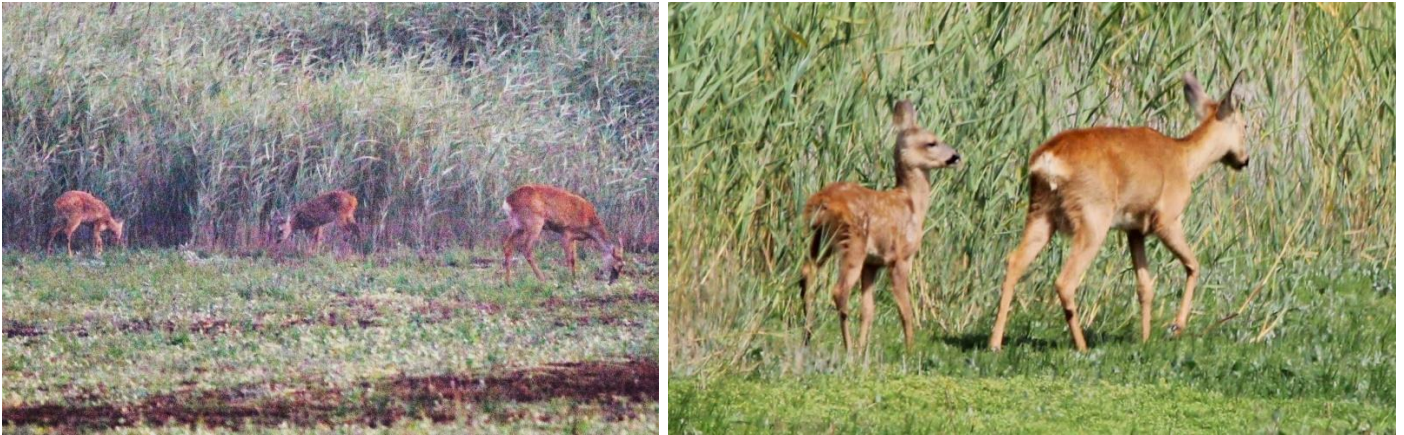
The photos above show female Roe deer with their fawns

Roe Deer: One female Roe deer with two fawns, one female with one fawn and a Roebuck has also been around the Pans.