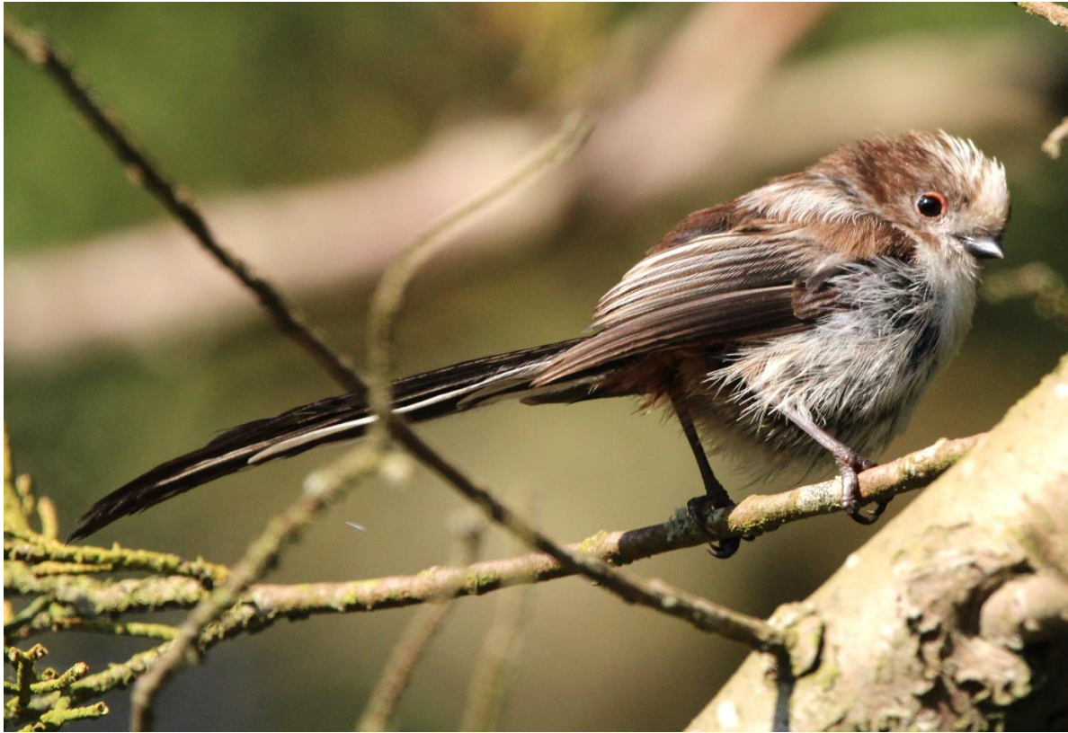
Long Tailed Tit in the Pine tree behind the Observatory.

Long Tailed Tit: Seen on three occasions during the month. 26 were recorded on the 17 th July.