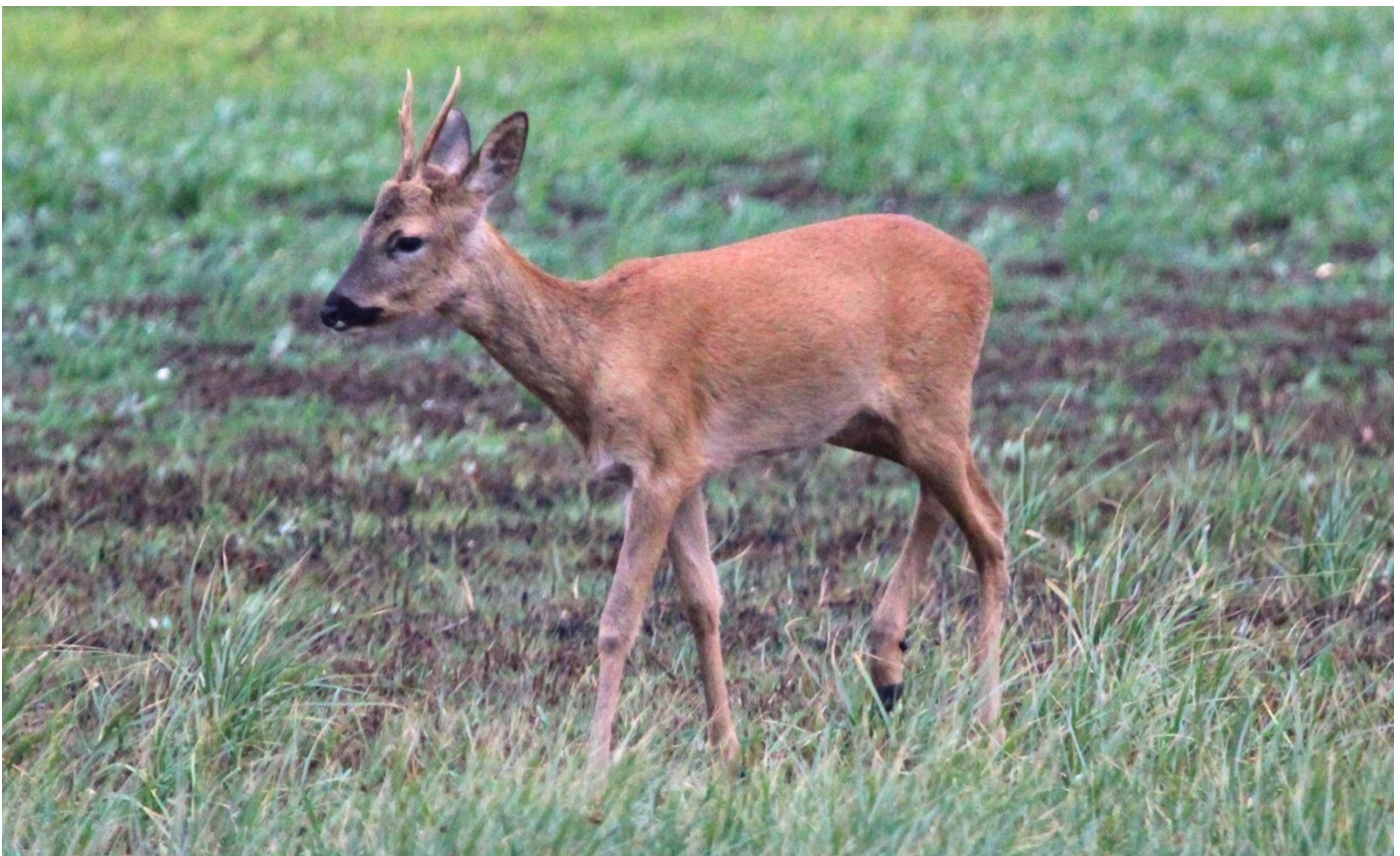
A Roebuck at the Pans.