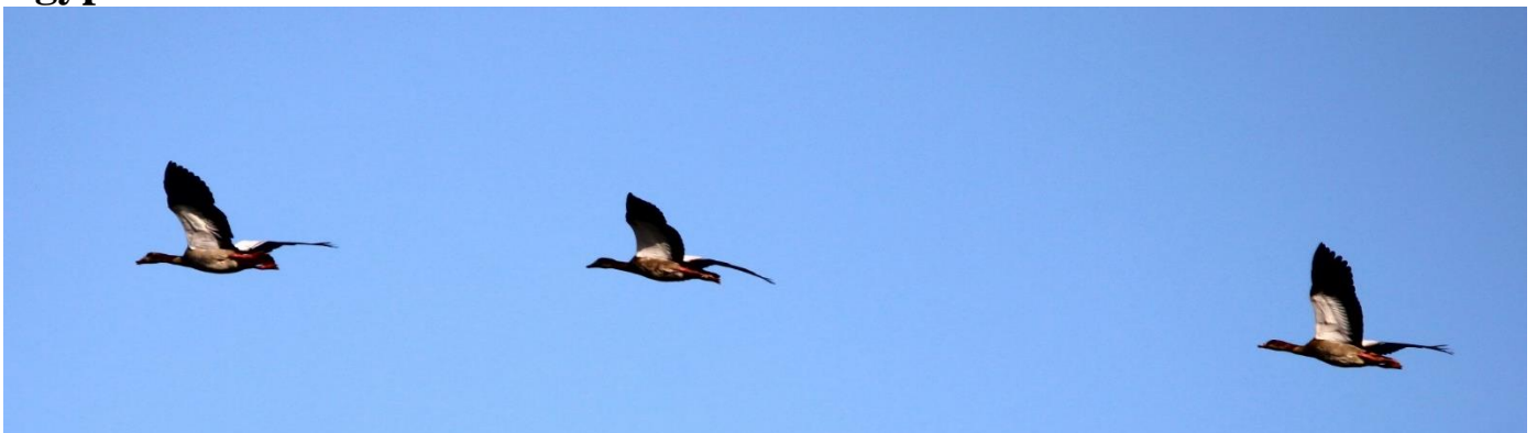
The photo above shows the Egyptian Geese flying over the Pans.

Egyptian Goose: Three flew over the Pans on the 25 th .