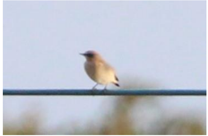
Distant photo of the Wheatear on the wire.