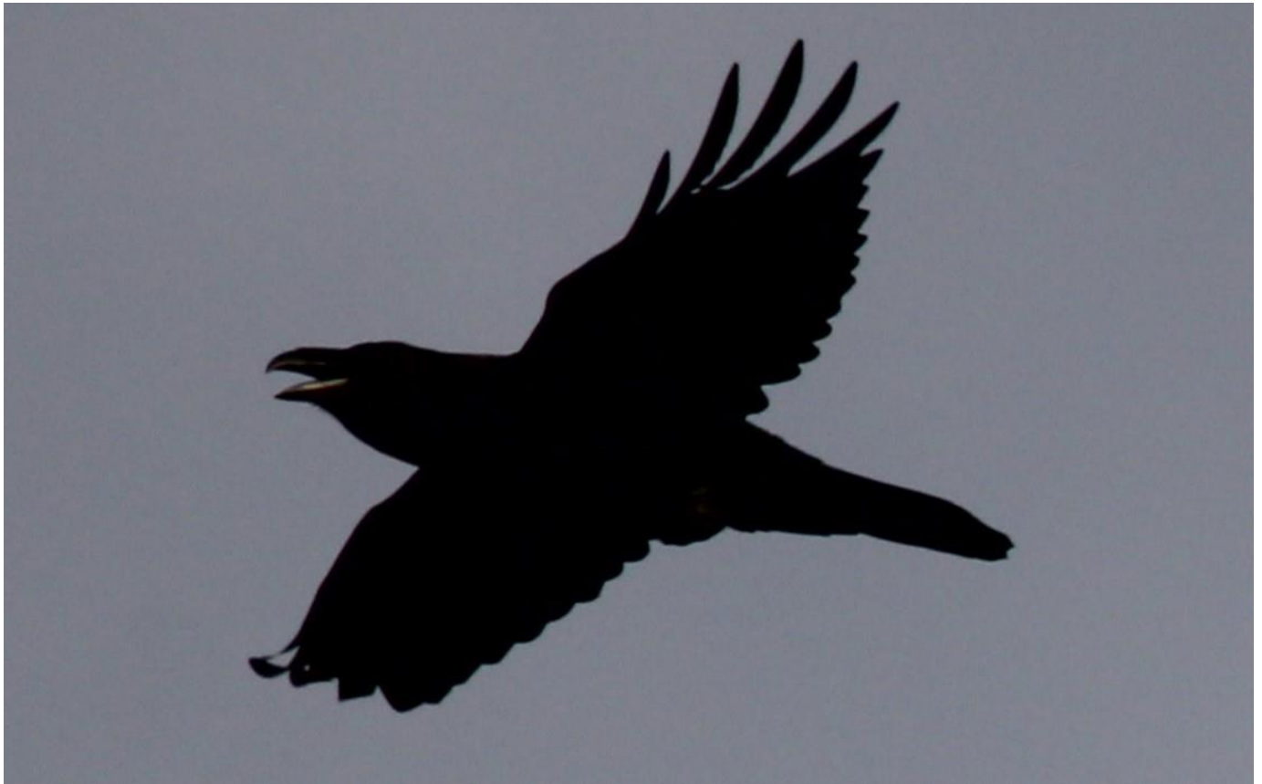
A Raven flying over the Pans.

Raven: Recorded 9 times during the month.