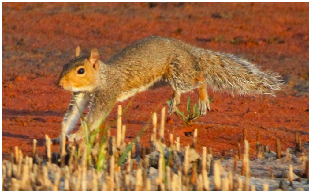
A Grey Squirrel running across the Pans