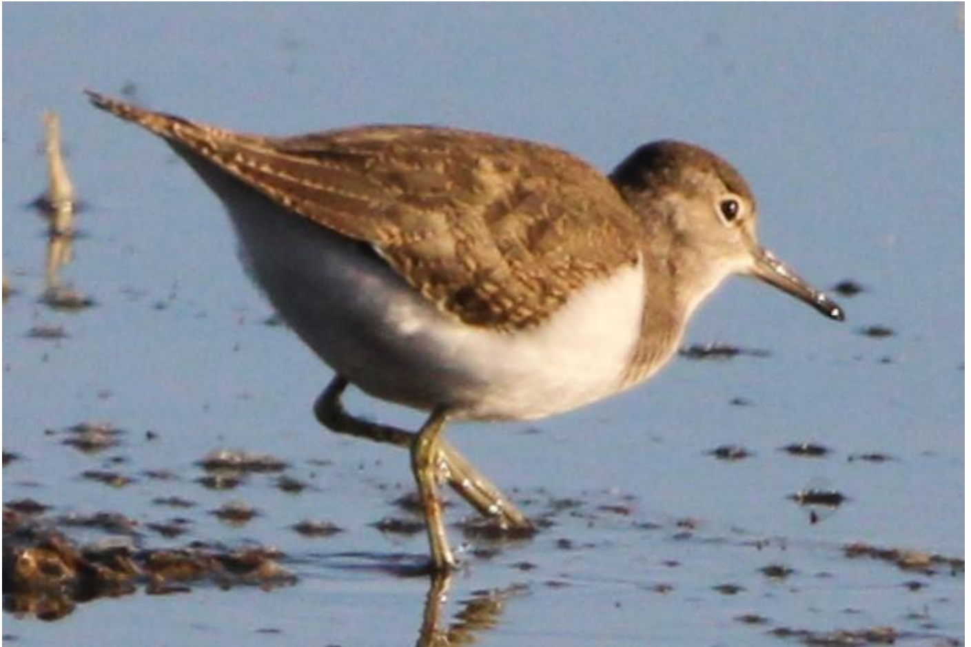
The photo above shows a Common Sandpiper.

Common Sandpiper: Recorded on 14 days during the month.