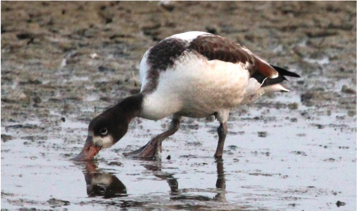
A juvenile Shelduck close to the Observatory.

Shelduck: Have been seen every day of the month. The highest number recorded was 14 on the 8 th August. There have been up to 10 juveniles with 4 adult birds.