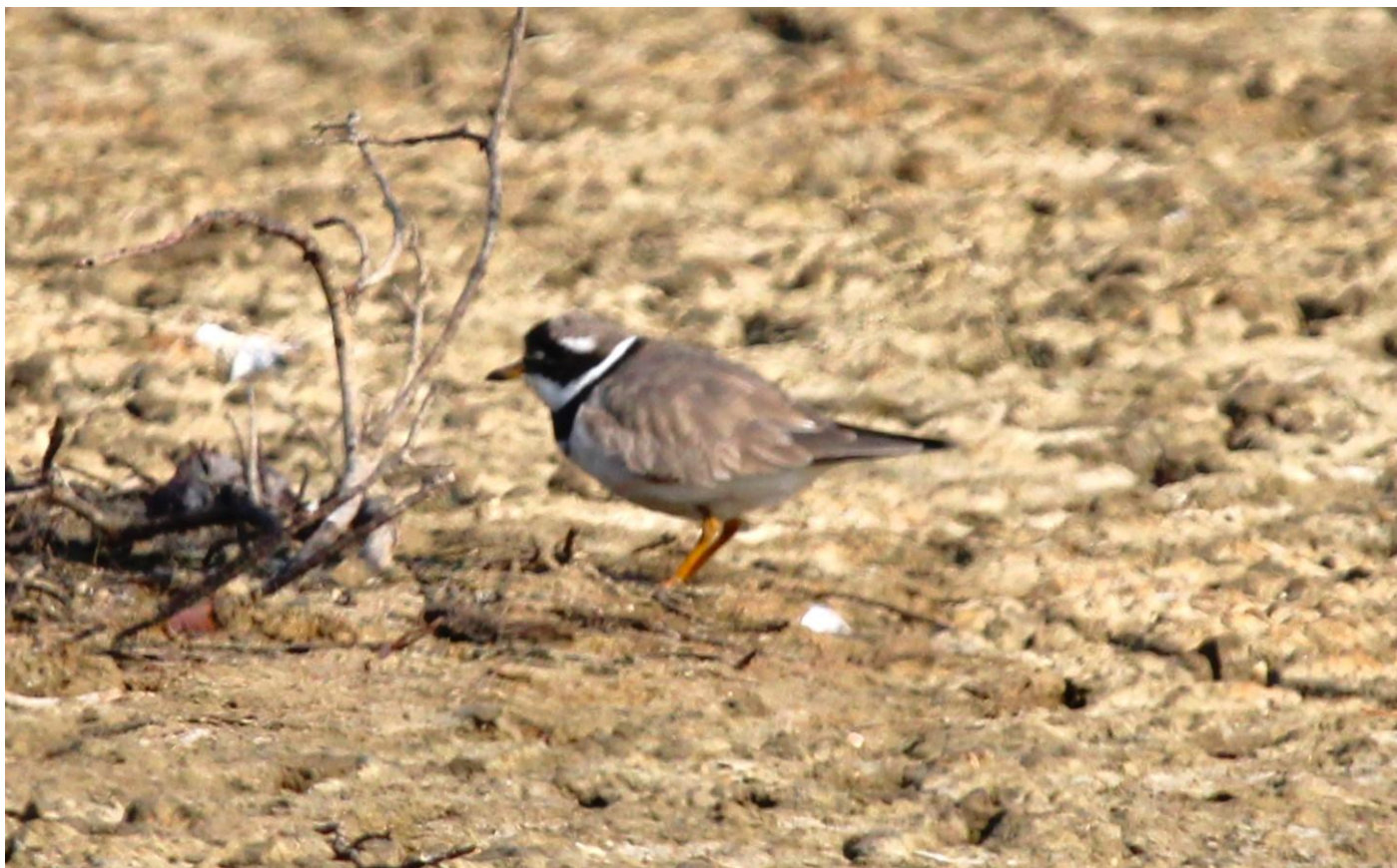
A Ringed Plover near the Observatory.

Ringed Plover: These were recorded on four days during the month.