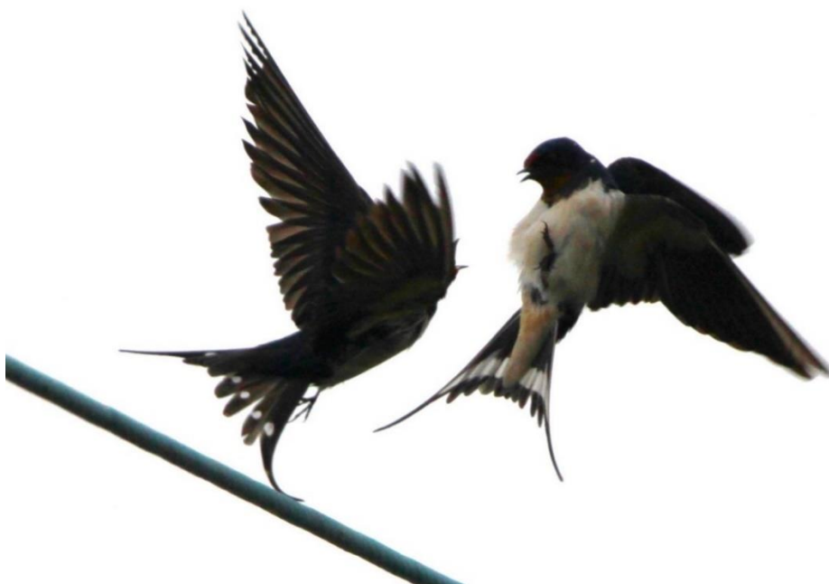
Two Swallows by the telephone wire near the Observatory.

Swallow: Seen flying over the Pans on 18 occasions.