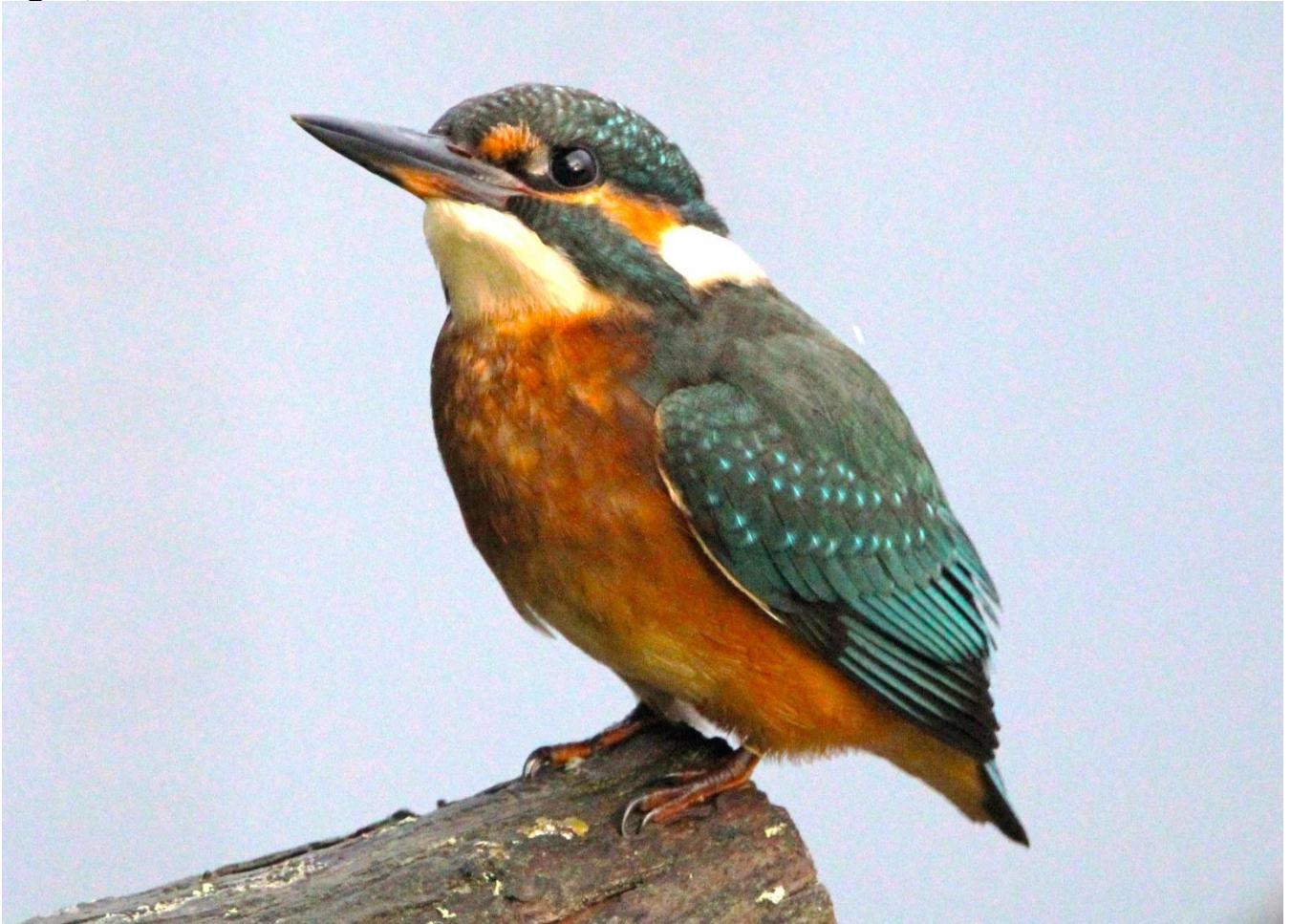
A Juvenile female Kingfisher (grey legs and an orange lower bill).

Kingfisher: Three different birds have been seen during the month, an adult male (not ringed) a juvenile female (not ringed) and a juvenile male (not ringed).