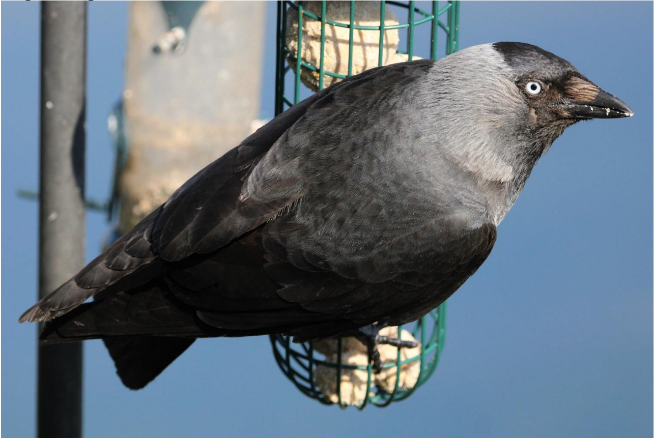
A Jackdaw making the most of the feeder at the Observatory.

Jackdaw: Heard or seen on 9 occasions during the month with three being the highest number.