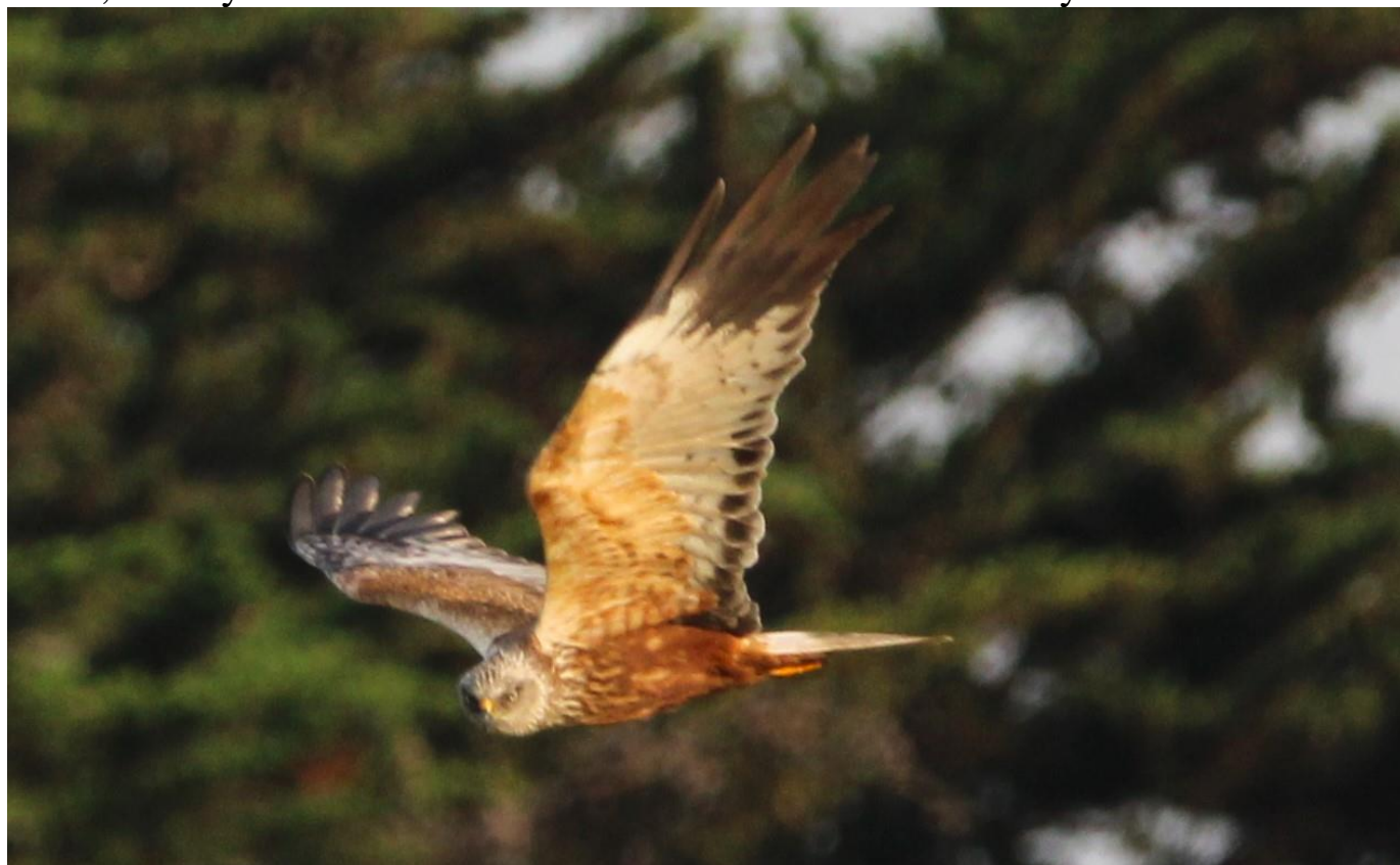
Marsh Harrier flying over the Pans on 16 th June.

Marsh Harrier: Has only been recorded on 5 occasions during the month, luckily on one of those it flew close to the Observatory.