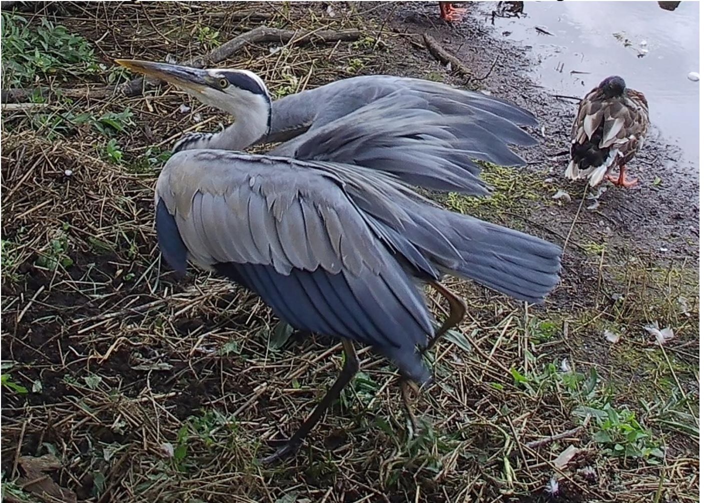
A Grey Heron posing for the camera.

Birds Recorded: Blackbird, Black Headed Gull, Carrion Crow, Grey Heron, Little Egret, Mallard, Moorhen, Mute Swan and Wood Pigeon.