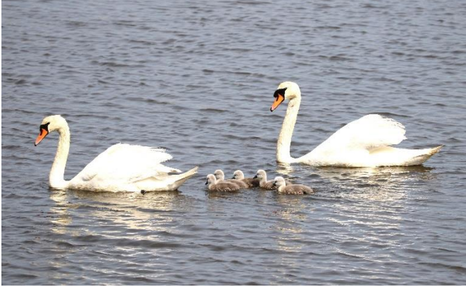
The cygnets on the 23 rd May.

Mute Swan: At the start of the month the Avon Water pair of Mute Swans had 5 cygnets but sadly by the 20 th one of the cygnets had been lost.