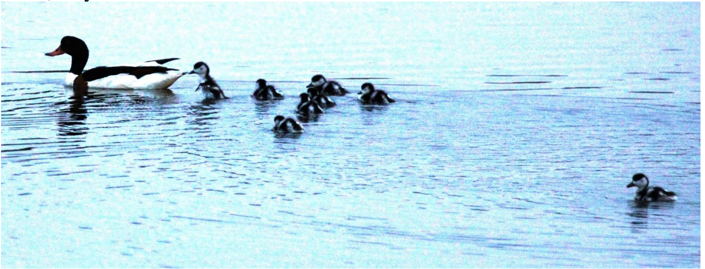
8 Shelduck chicks with their mum on the 27 th June.

Shelduck: Seen most days during the month with 6 being the highest number recorded. On the 27 th a pair were seen with 8 ducklings, as they are so small, they must have bred at the Pans.