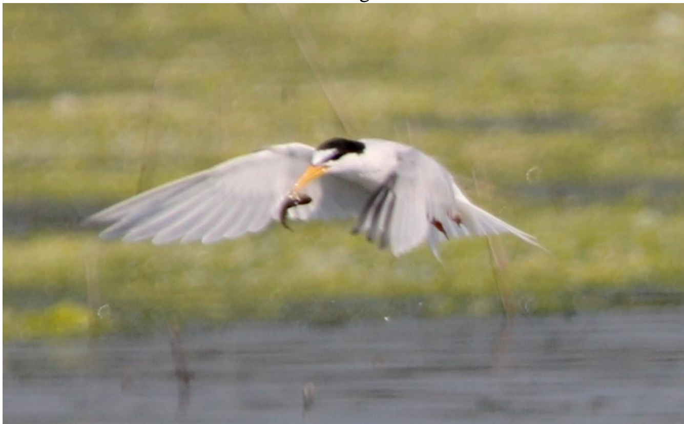
Little Tern with a small fish.

Little Tern: Have been seen fishing on the Pans from the 8 th until 26 th .