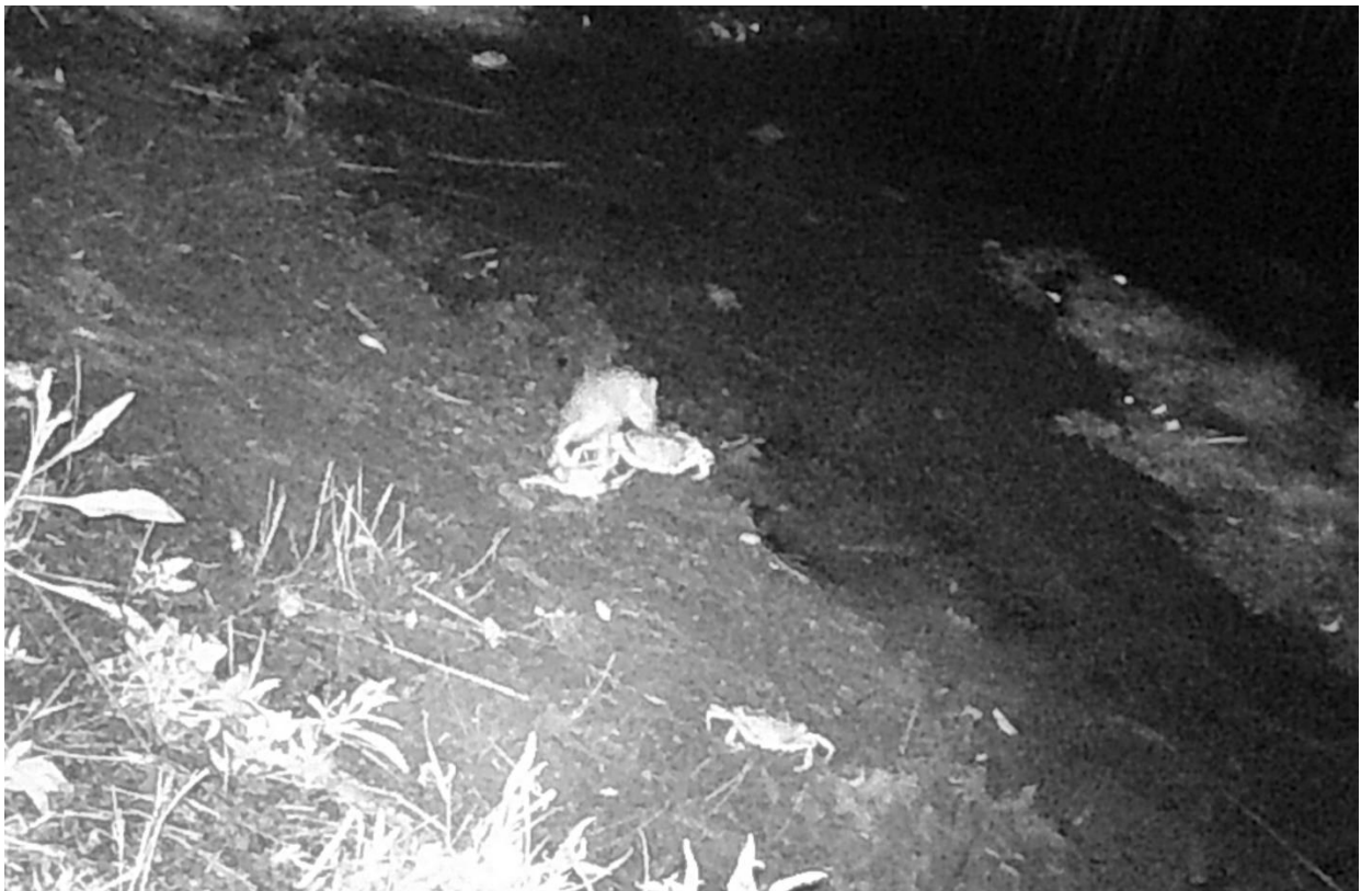
A Brown Rat checking out a Shore Crab.