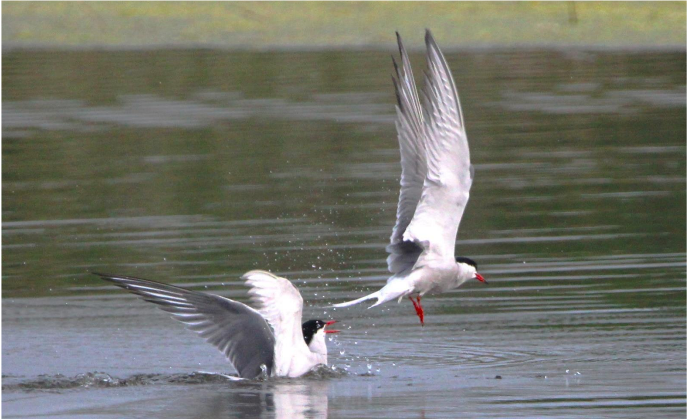
Two of the 8 Common Tern on the 22 nd June.

Common Tern: Regularly seen fishing over the Pans and Avon Water. 8 were recorded on the 22 nd June.