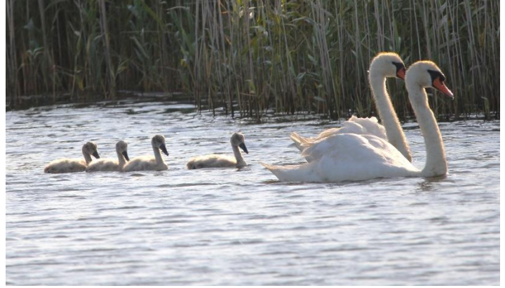
The cygnets on the 26 th June.

As you can see, they have grown quite a bit over the last month. The adults have also taken the cygnets out into the harbour.