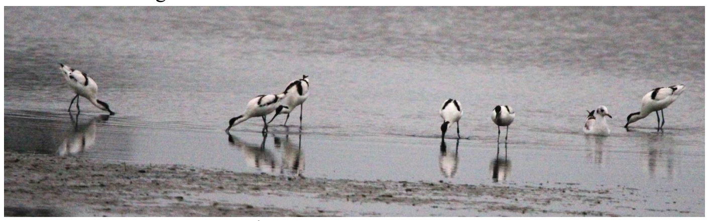
Photo taken on the 2<sup>nd</sup>September showing six of the seven Avocets.

Avocet: A good start to the month with 7 seen on the Pans.