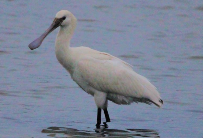
Luckily it came to the Observatory end of the site.

Starling: Seen on 21 days. Over 100 birds were recorded on the 1<sup>st</sup> of the month.