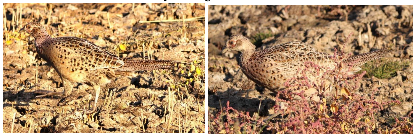
Tricky to spot on the dried Pans.

Pheasant: Seen on 10 days during the month.