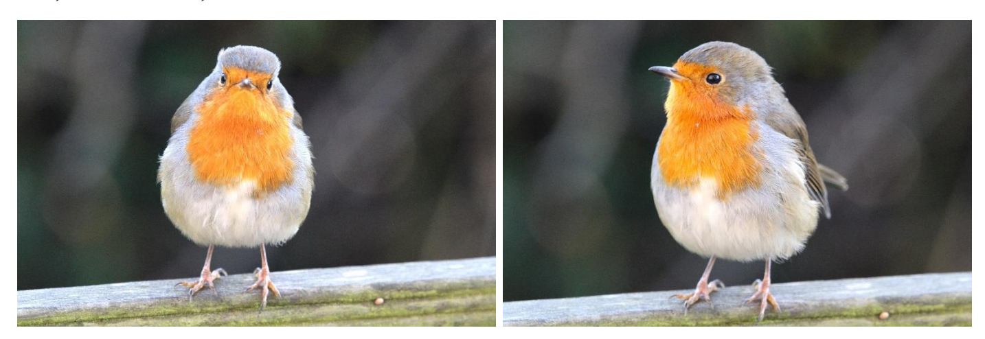
A Robin often sits on the rail opposite the Observatory door.

Robin: Recorded every day during the month. Usually, a single bird is seen but, on the 11th, 12<sup>th</sup> and 13<sup>th</sup> 2 birds were seen.