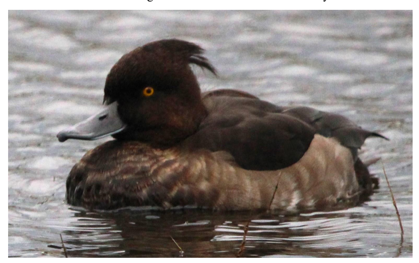
Due to the high-water levels, it was able to swim close to the Observatory.

Tufted Duck: A single bird was seen on the last two days of the month.