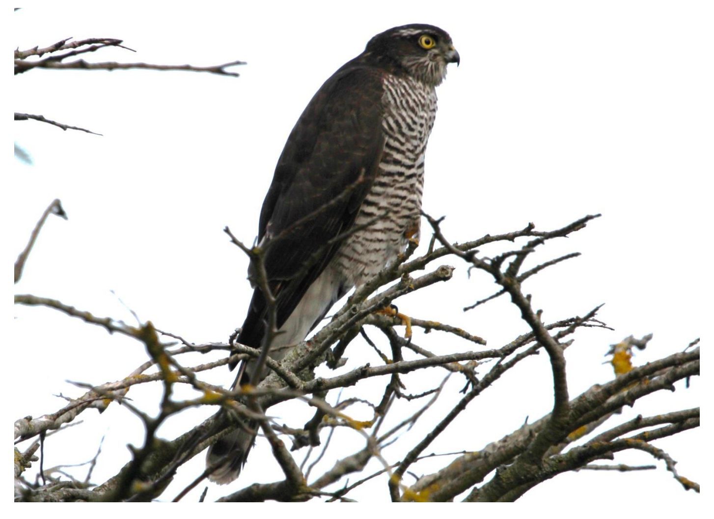
The female Sparrowhawk posing nicely.

Sparrowhawk: Recorded on 7 occasions during the month.