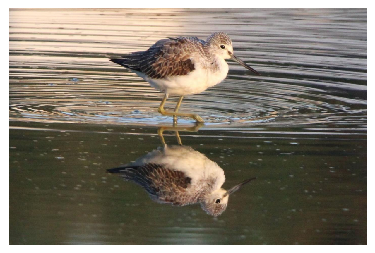
A Greenshank in a reflective mood.

Greenshank: Seen on 20 days during the month.