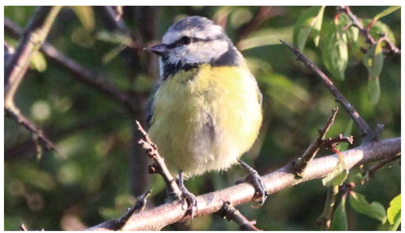
Blue Tit on the central hedge.