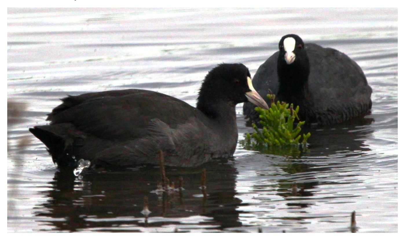
Coot near the Observatory

Coot: Now that the water levels are very high again the Coot are seen near the Observatory. 30 were recorded on the 17<sup>th</sup>.