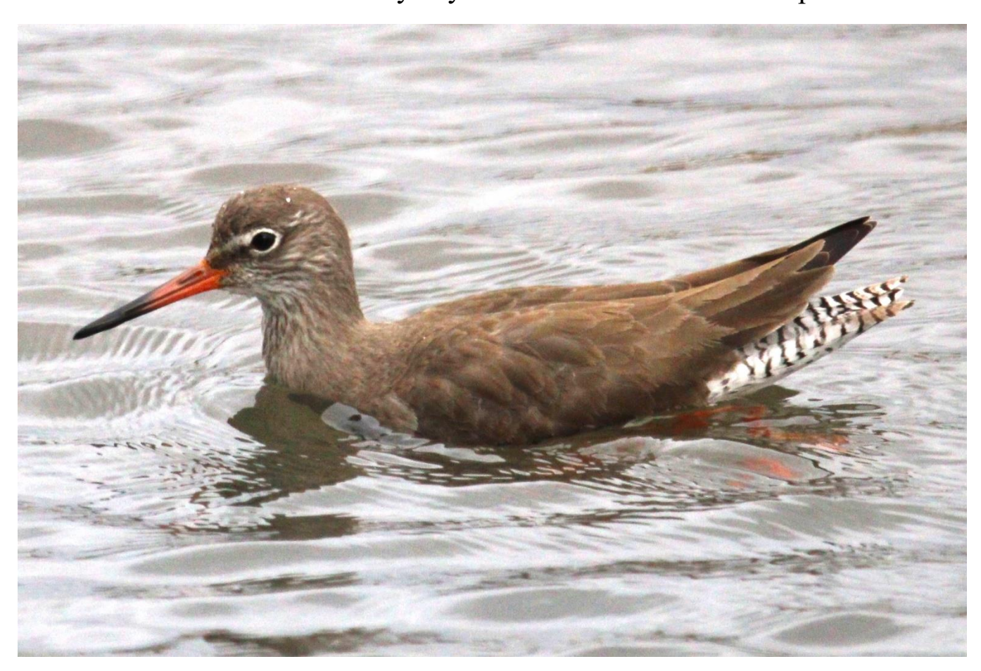
A Redshank swimming in the Pans.

Redshank: Recorded every day. 135 were seen on the 3<sup>rd</sup>September.