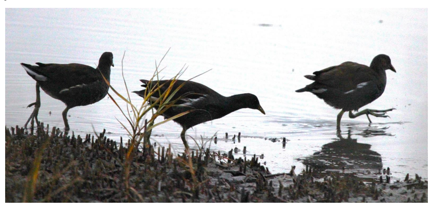
The photo above shows 3 of the 5 Moorhens.

Moorhen: Recorded on 25 days during the month. They cross over to and from Avon Water and the Pans. 5 were recorded on the 18<sup>th</sup>. There can be up to 3 juveniles.