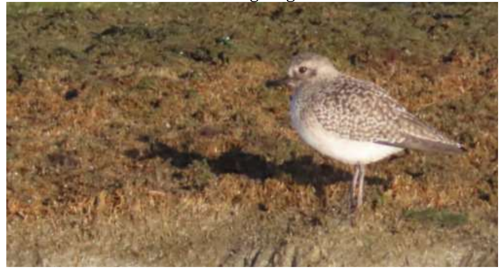
Above: Grey Plover in winter plumage

Small batches of Swallow were frequently seen flying eastwards before their leap over to the continent to head back to Africa for our winter. Single Great Crested Grebe were seen several times but would dive before you could get a good view of them in their winter plumage. Grey Plover , Redshank , Dunlin , Curlew and Black-tailed Godwit were seen dotted around the muddy fringes of the saltmarsh and one group of 6 Shelduck were seen out towards the northern end of Garden Point as we headed towards the Camber and the Castle landing stage.