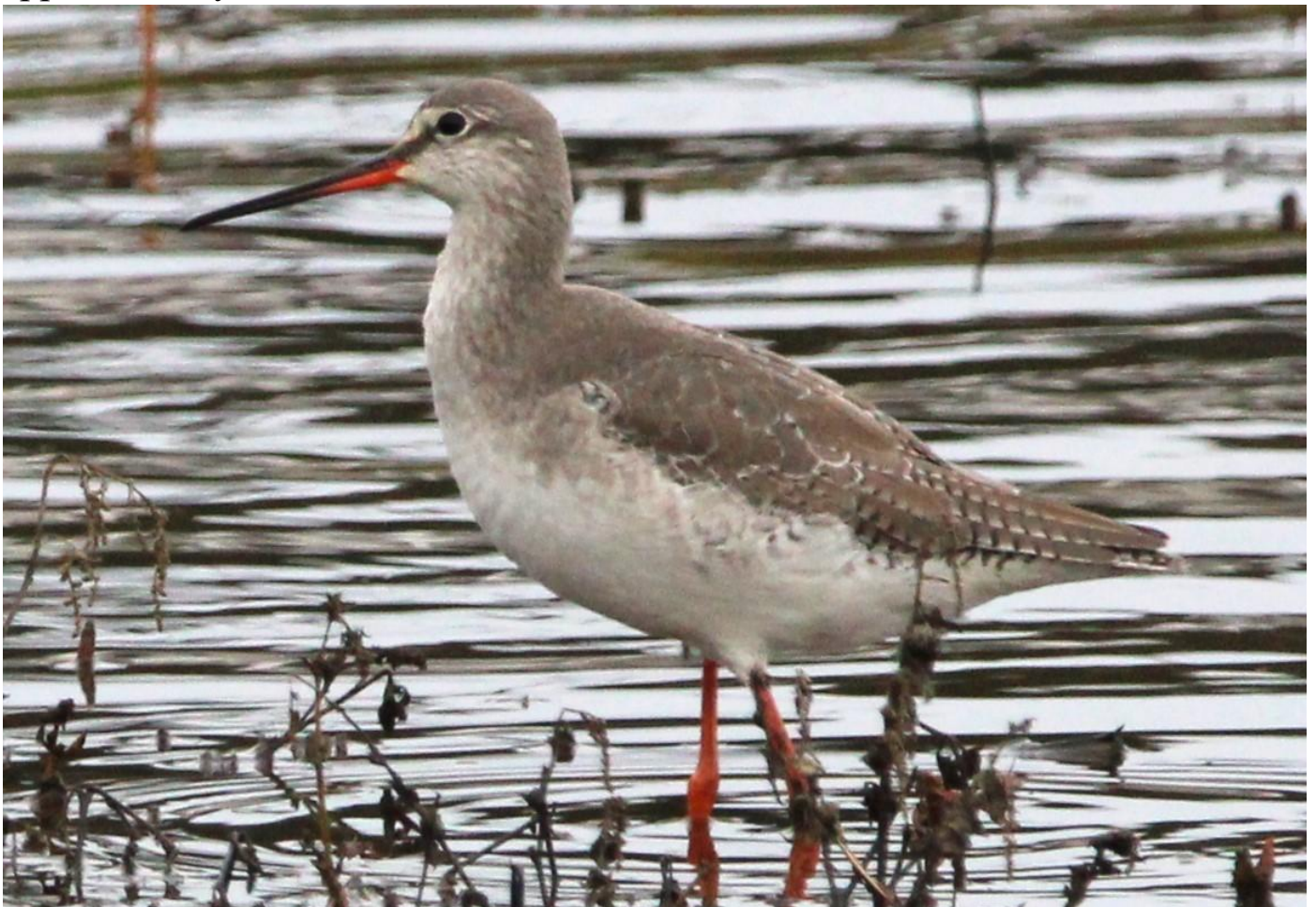
A Spotted Redshank near the Observatory.

Spotted Redshank: Seen on 20 days during the month with approximately 22 seen on the 15 th .