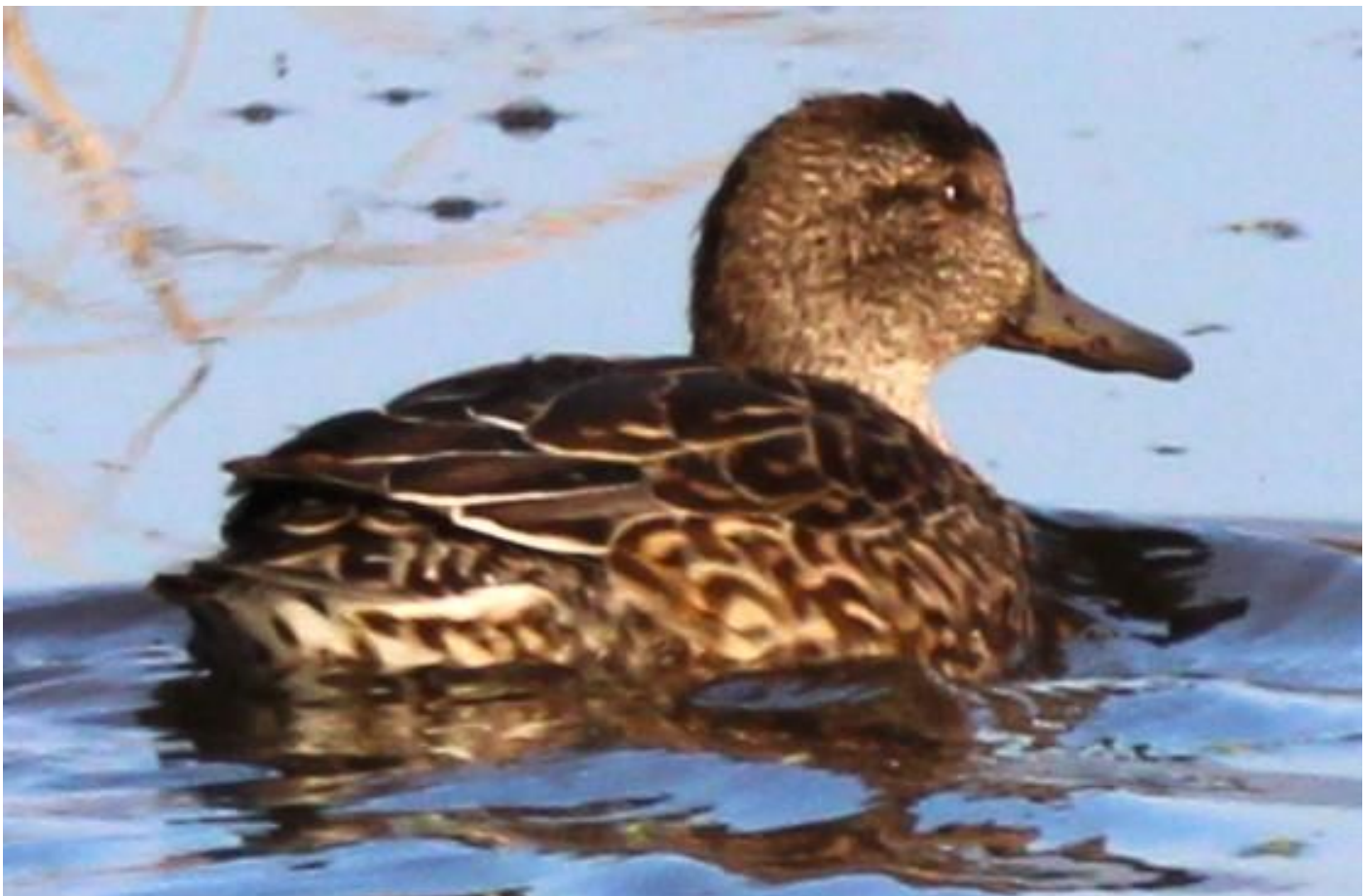
A female Teal near the Observatory.

Teal: Seen every day of the month in very high numbers. On the 28 th October over 600 were seen at the far end of the Pans.