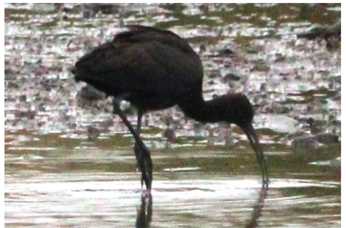
The Glossy Ibis on Avon Water.

There was a group of new members to Hampshire Ornithologist Society visiting the Observatory at the time and they were lucky enough to see the Ibis flying onto Avon Water then flying off.