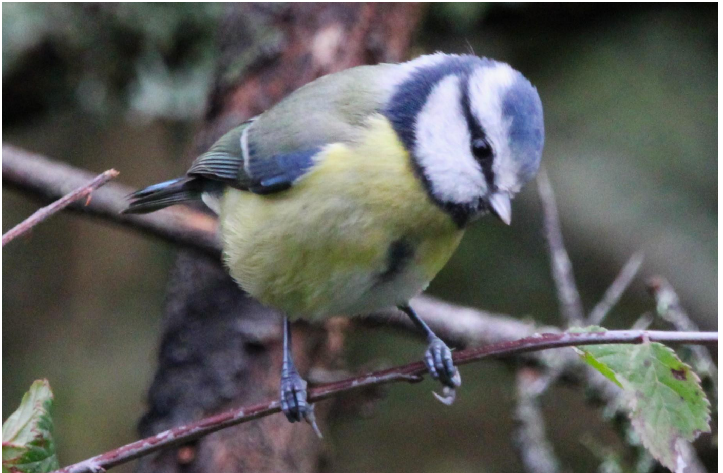
A Blue Tit near the feeders.

Blue Tit: Recorded every day during the month with 6 being the highest number recorded.