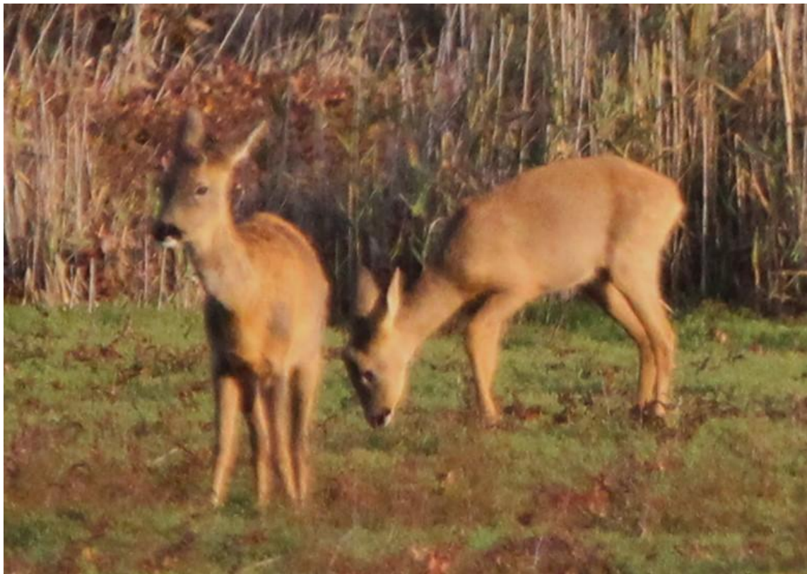
Two Roe deer at the far end of the Pans.

Other Wildlife at the Pans: Brown Rat, Fox, Roe Deer and Pipistrelle Bat.