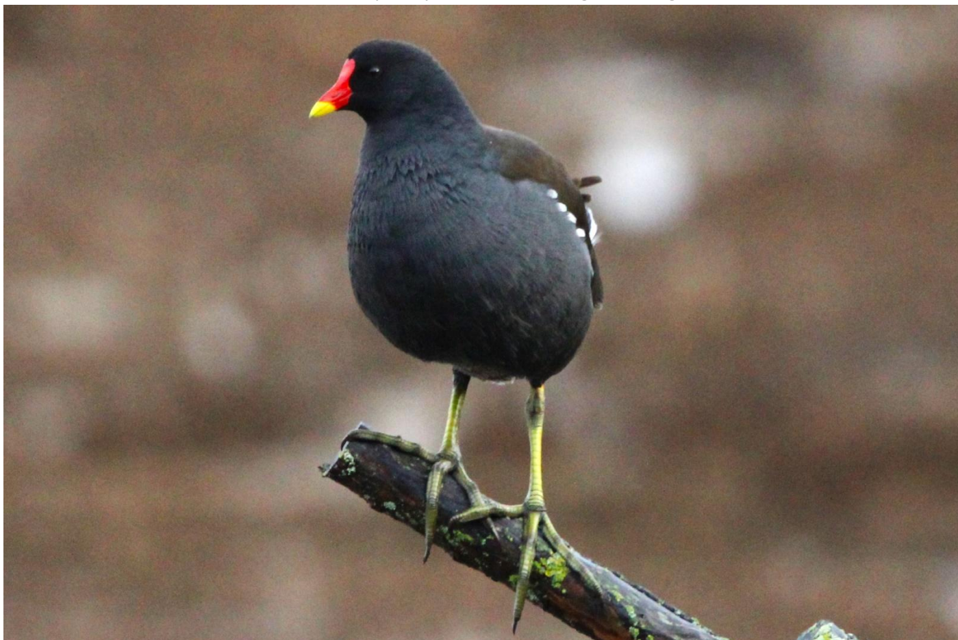
A Moorhen on the branch over the Kingfisher Pool.

Moorhen: Recorded every day with 4 being the highest number seen.