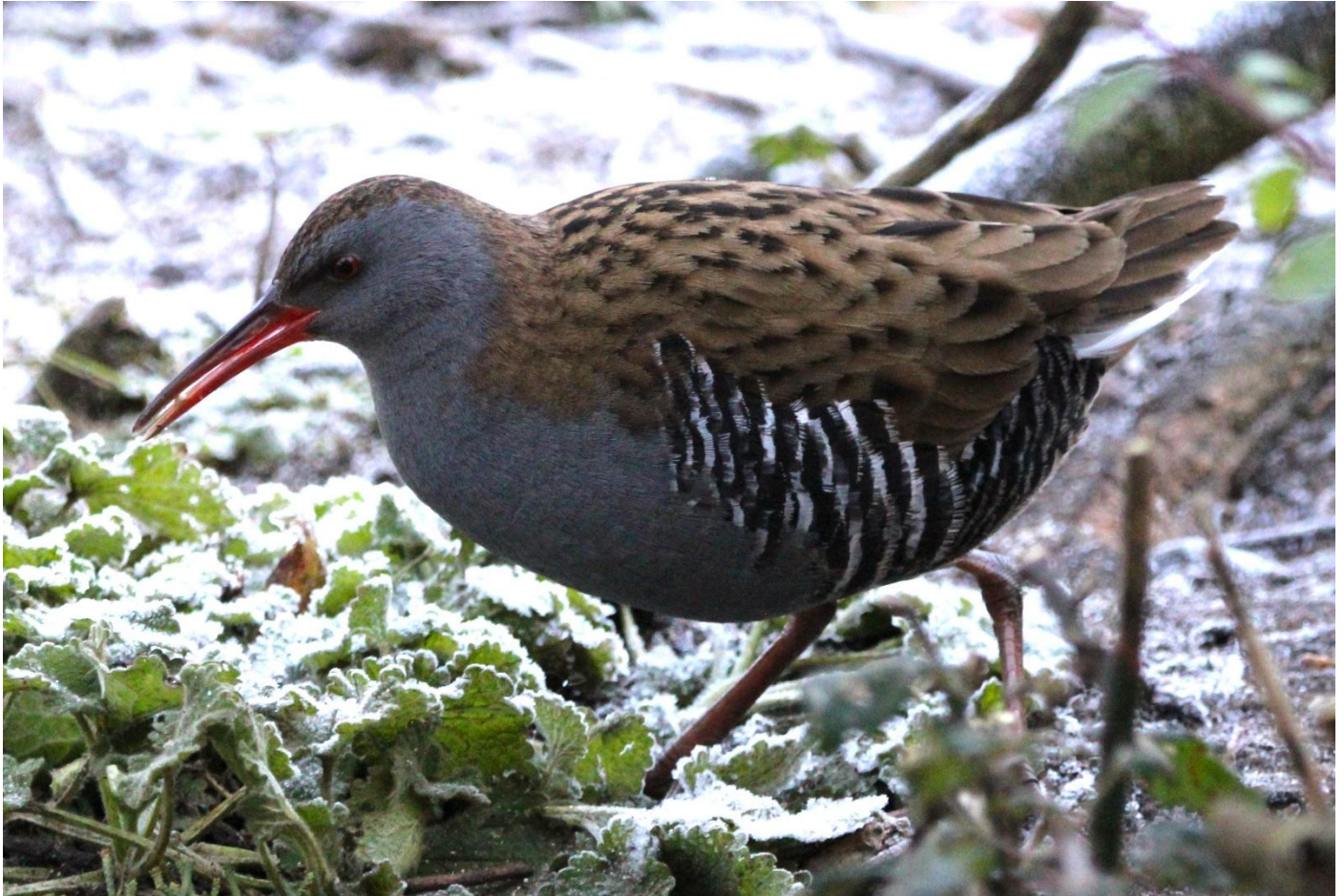
A Water Rail below the feeder.

Water rail: Recorded on 20 days, usually a single bird seen but others heard.