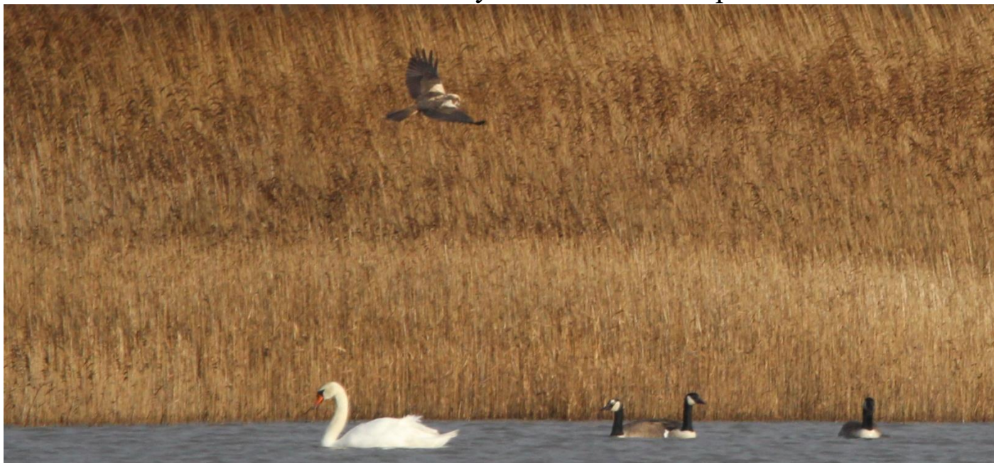
A Marsh Harrier flying over the far end of the Pans.

Marsh Harrier: Seen most days with 3 to 4 birds present.