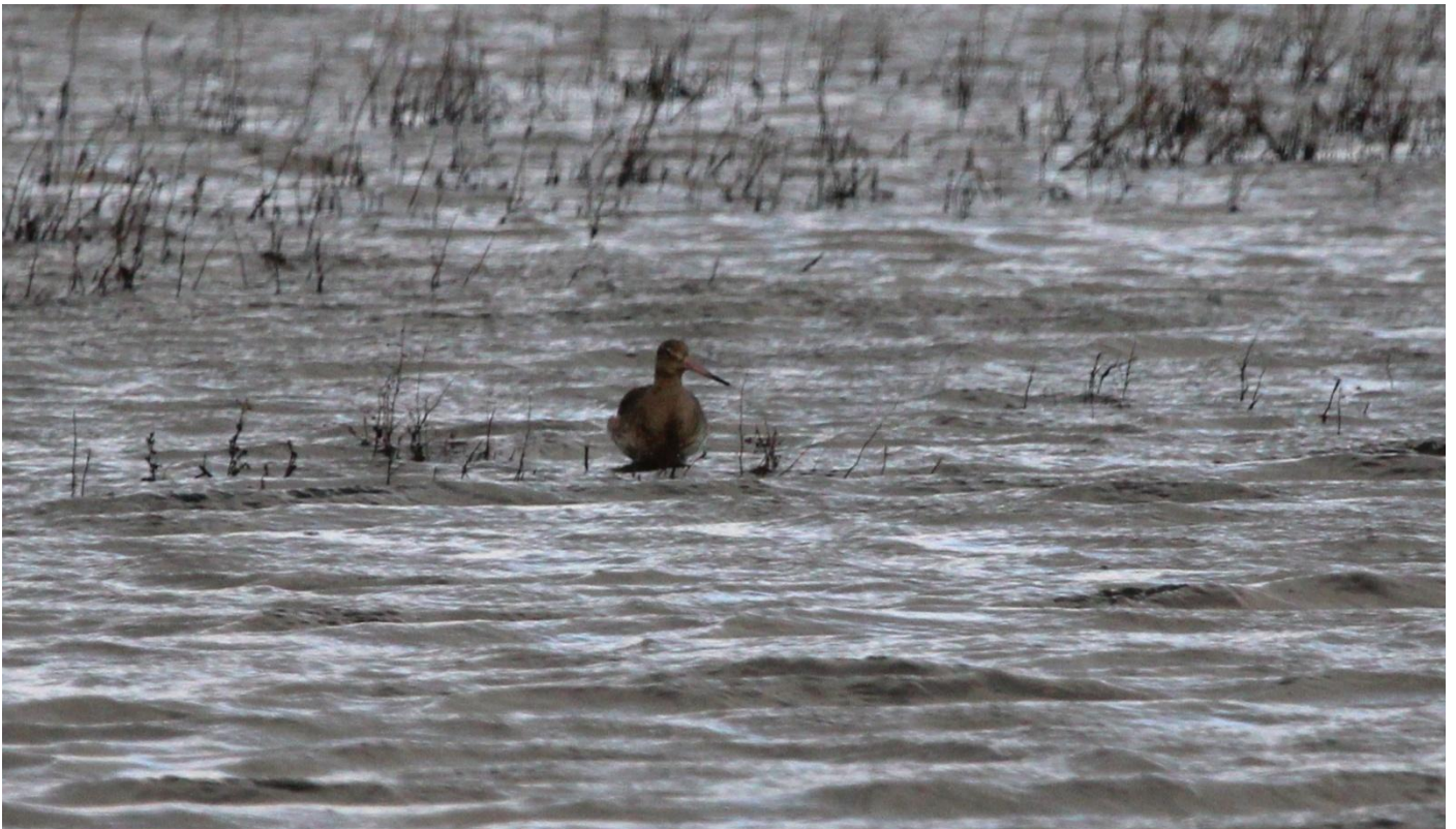
A Black Tailed Godwit near the Observatory on the 21 st January.

Black Tailed Godwit: Seen on 12 days during the month with over 62 recorded on the 13 th .