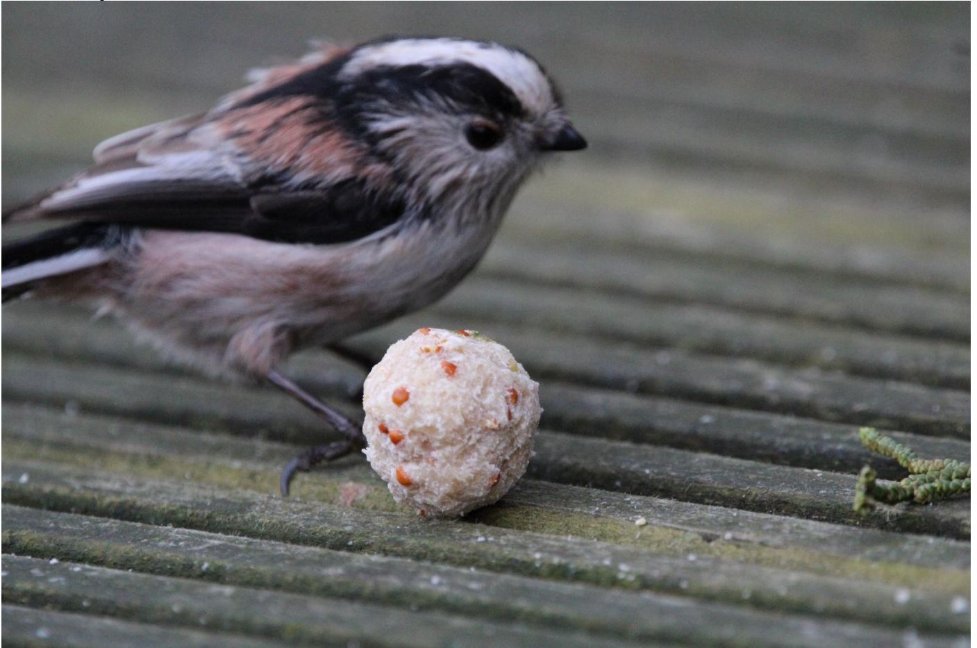
A long-Tailed Tit on the upper decking with a fat ball.

Long Tailed Tit: Over 19 have been seen around the Observatory on some days.